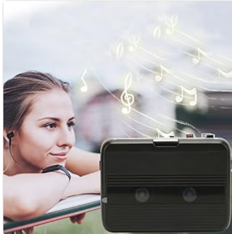
A person listening to music with headphones, illustrating the headphone usage.