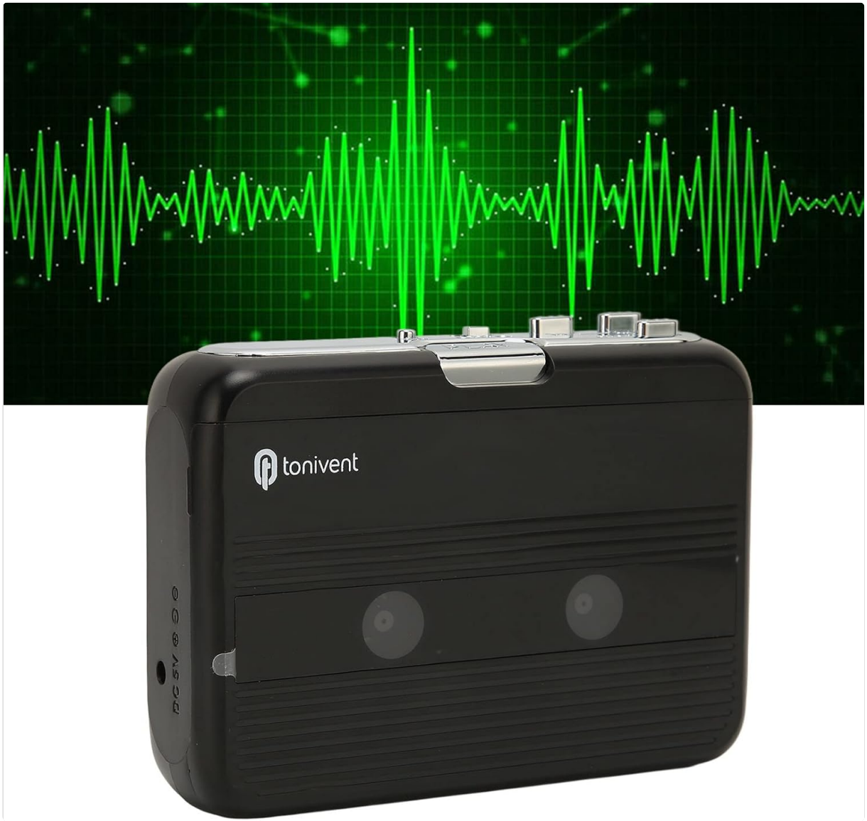
Front view of the Cuifati Portable Cassette Player with the cassette compartment door closed.