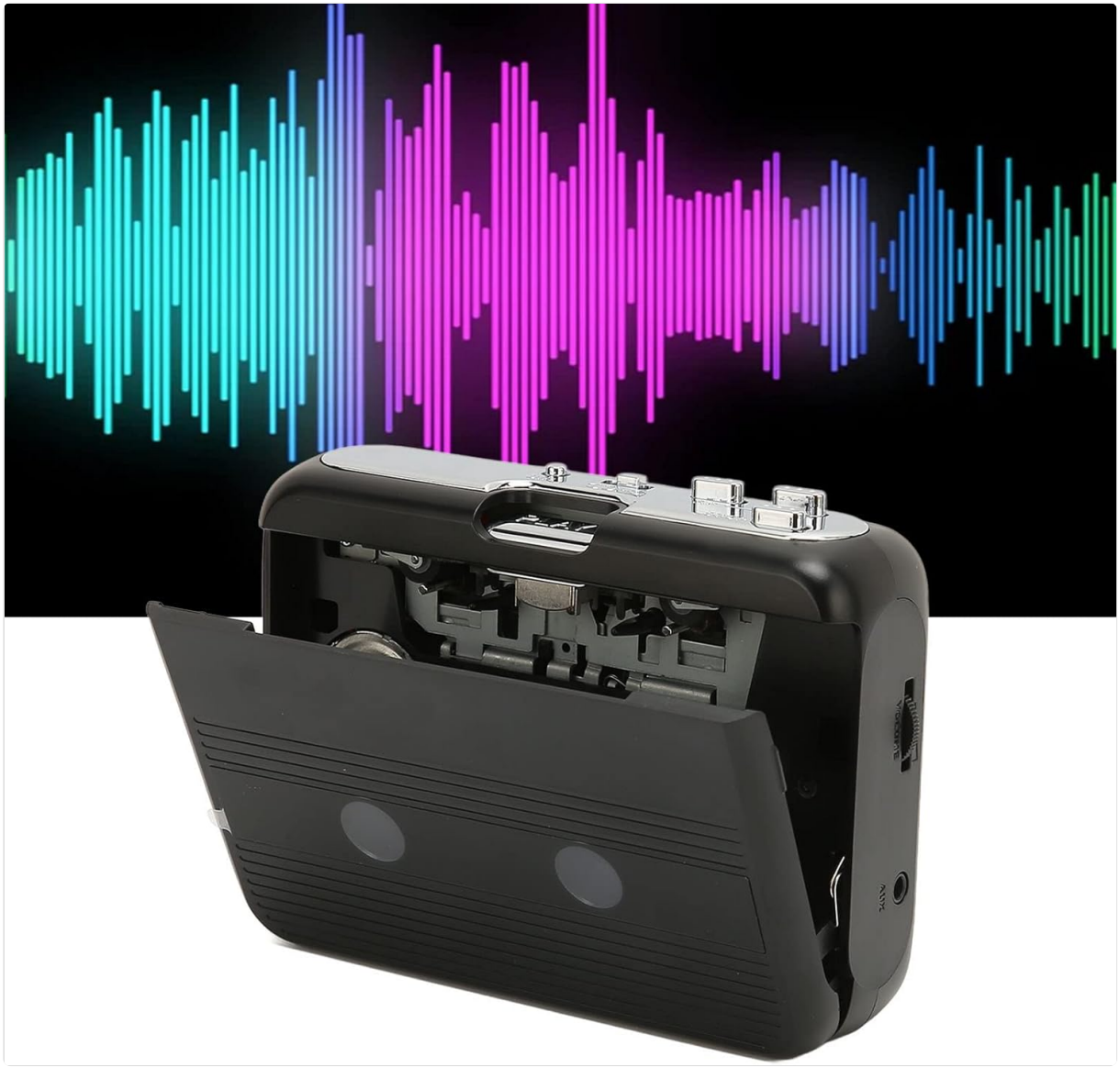
Front view of the Cuifati Portable Cassette Player with the cassette compartment door open, revealing the tape mechanism.