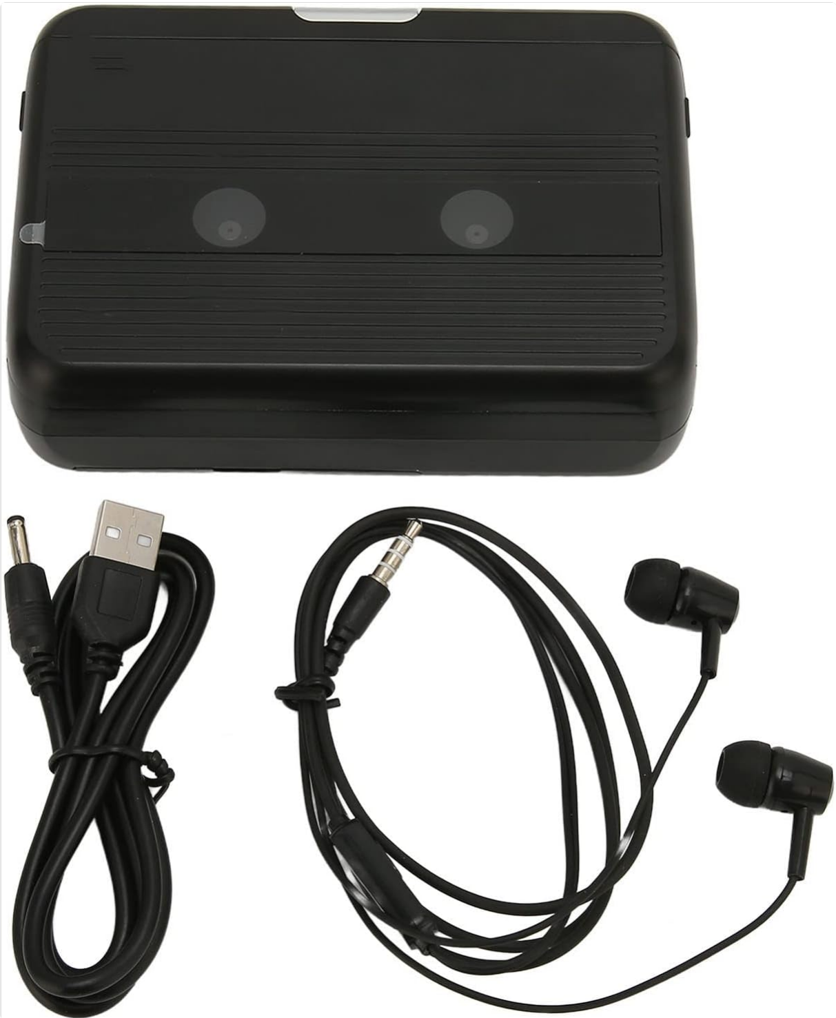
The Cuifati Portable Cassette Player shown alongside its included USB power cord and wired headphones.