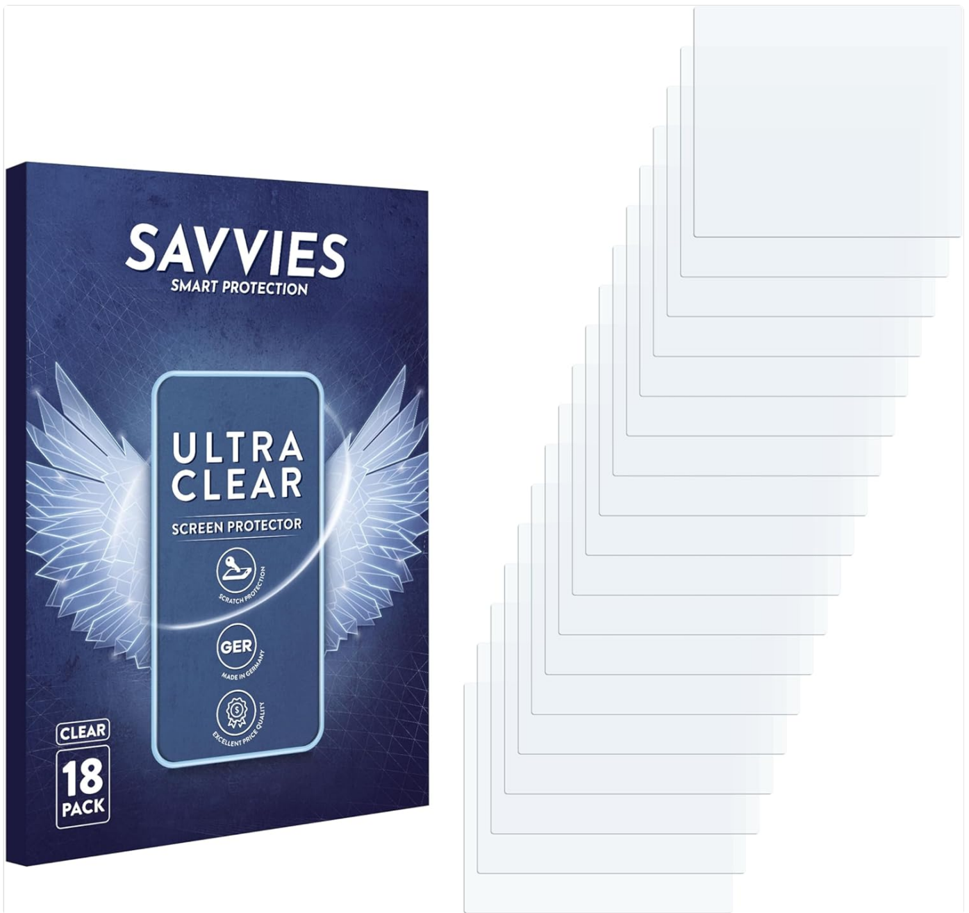
Figure 4: Savvies Ultra Clear Screen Protector packaging, showing the 18-pack quantity.