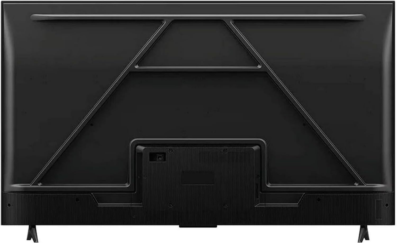
Figure 2.2: Rear View with Mounting Points

The TCL 55S451 TV is VESA compatible with a 200mm x 200mm pattern and requires M6 x 12 screws. A wall mount is not included. Refer to your wall mount's instructions for proper installation. Ensure adequate ventilation around the TV when wall-mounted.