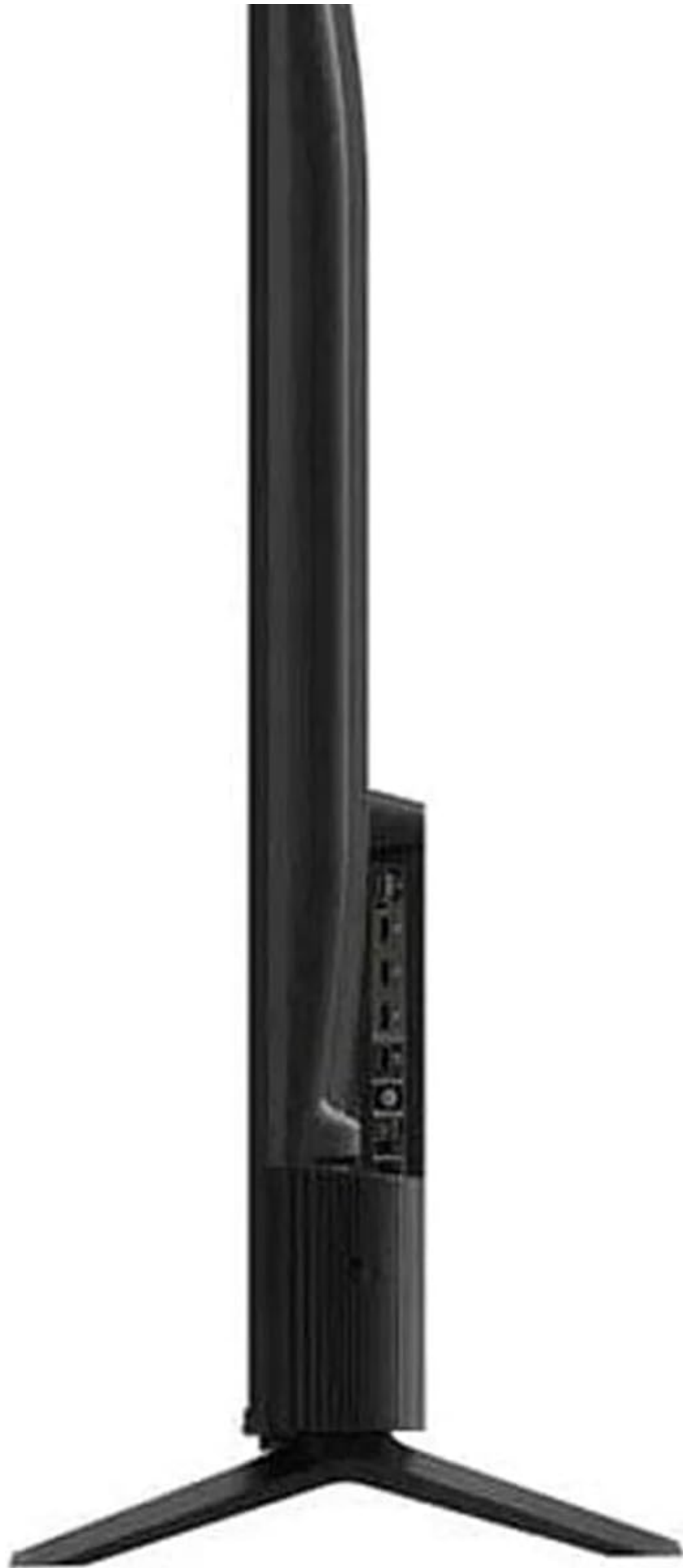
Figure 4.1: Slim Profile of the TCL Roku TV