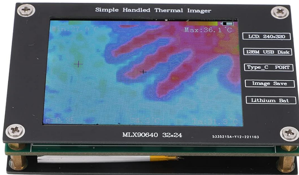
Image 3.1: The thermal imager, wiping cloth, and USB cable included in the package.

Lithium ion battery powered, USB C charging Up to 4 hours of battery life Built in SPI Flash chip, can store 100 pictures Connect computer or mobile phone to view and copy image file