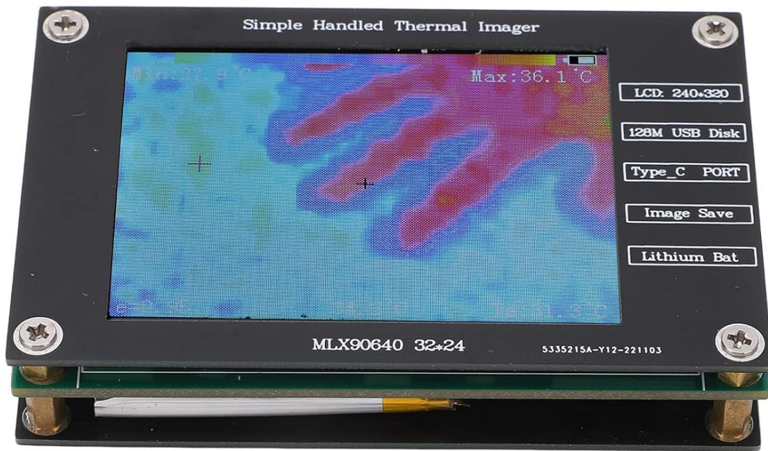
Image 4.4: Front view of the thermal imager, providing a clear perspective of the screen and its interface.