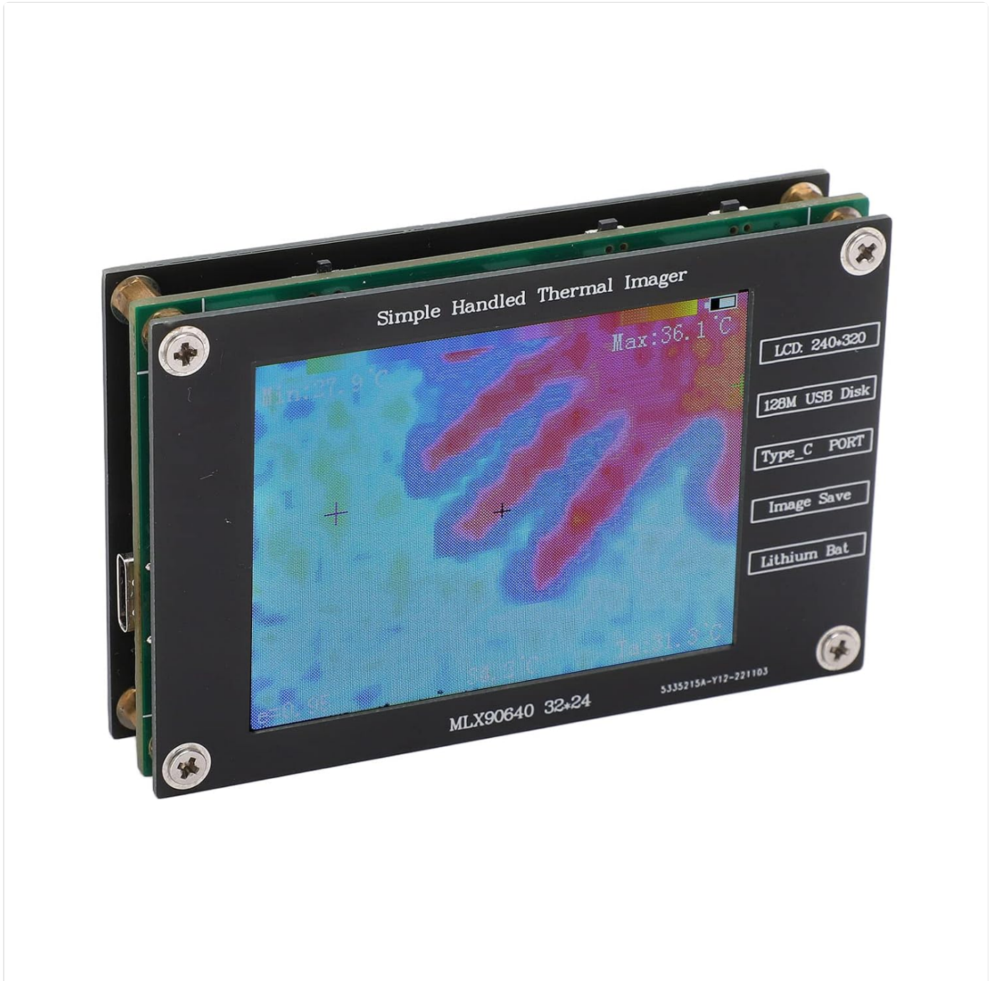
Image 3.2: Close-up view of the thermal imager, highlighting the USB-C charging port.

A full charge provides approximately 4 hours of working time. The device can be used while it is charging.