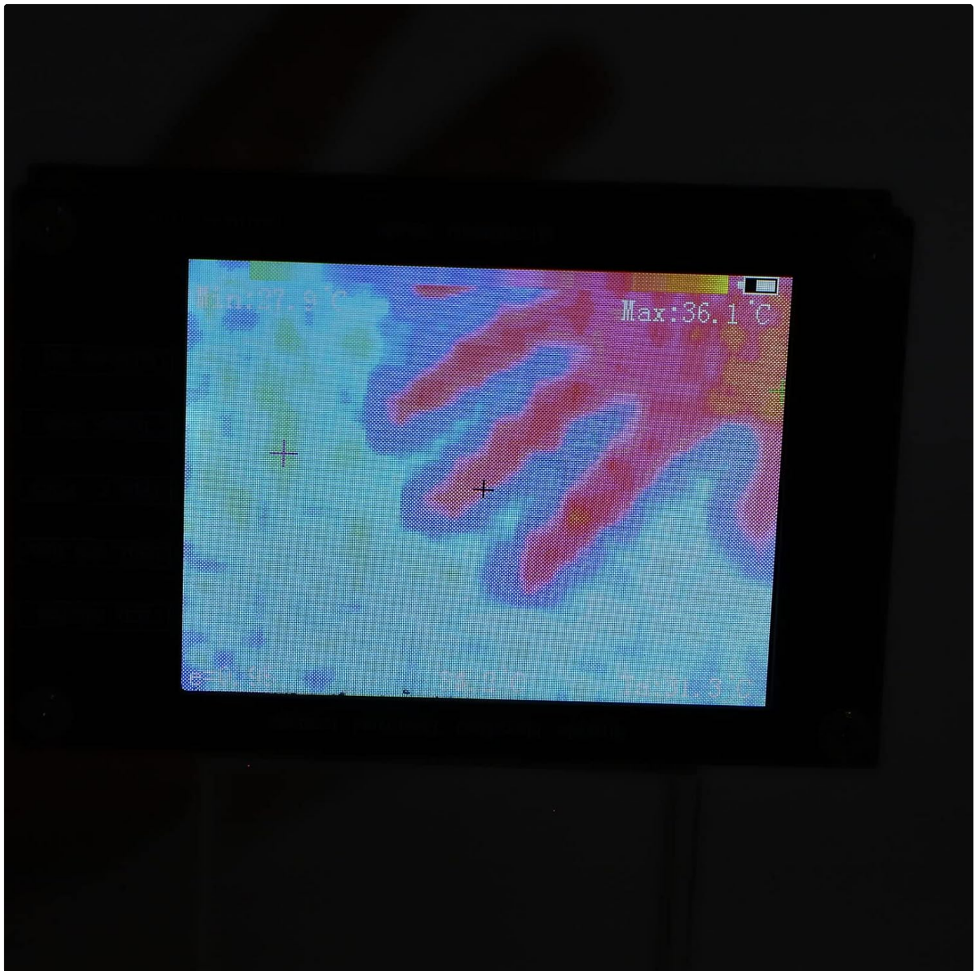
Image 4.2: The thermal imager's screen showing a thermal representation of a human hand, with temperature readings.