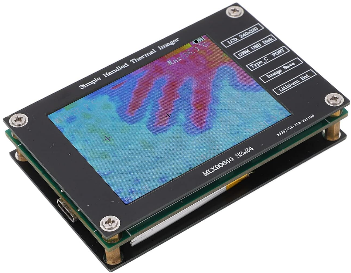
Image 4.3: An angled view of the thermal imager, demonstrating the clarity of the thermal display.