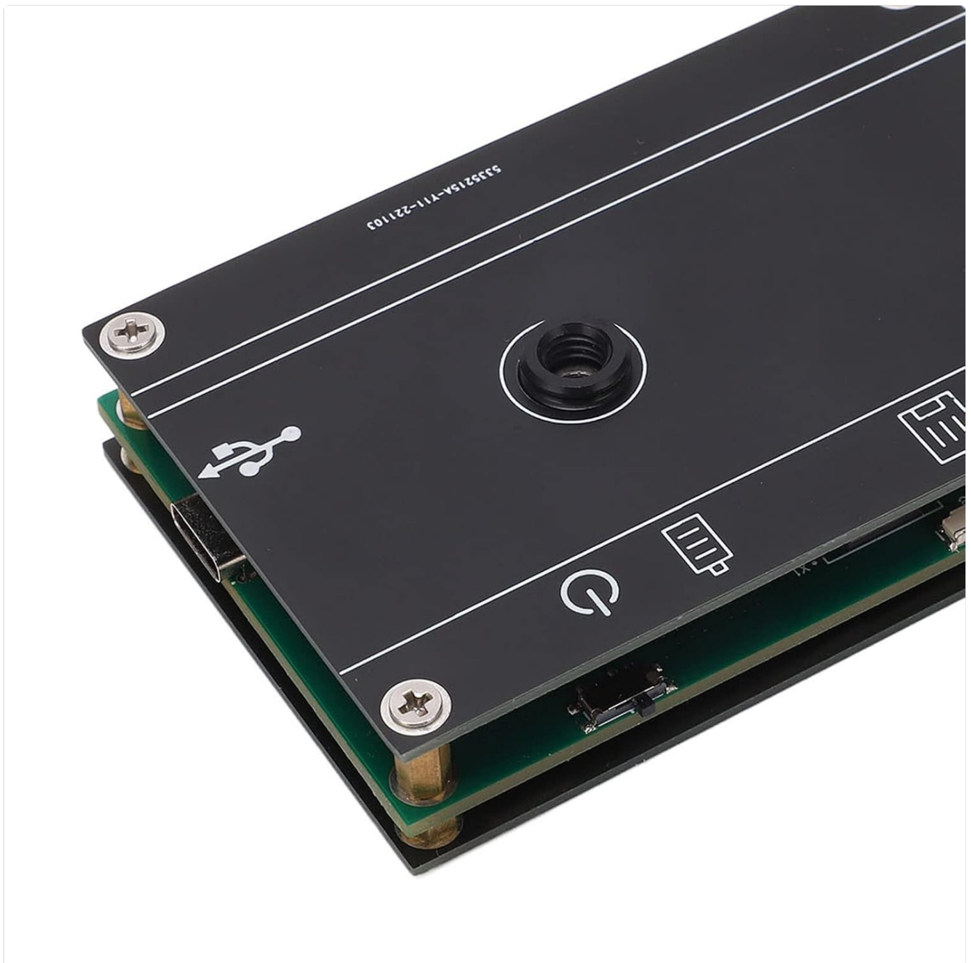
Image 4.1: Rear view of the thermal imager, showing the location of the power button and other indicators.