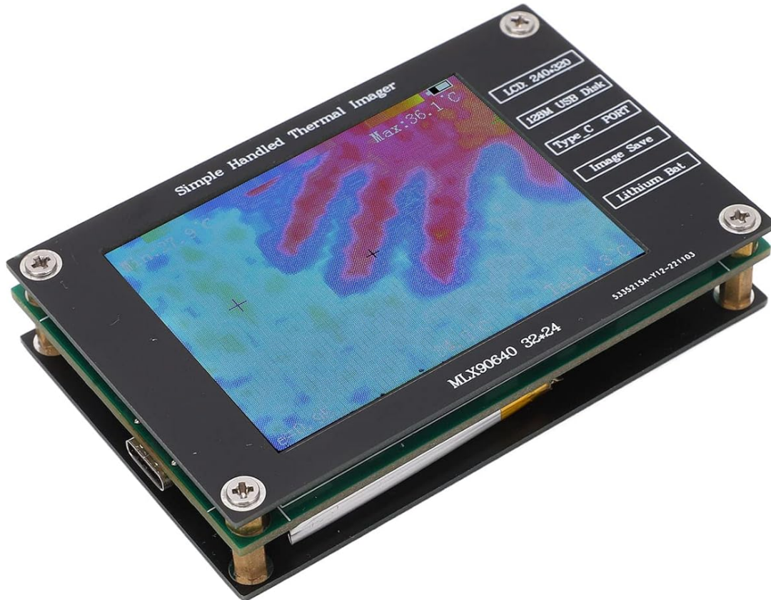
Image 4.5: Top-down view of the thermal imager, showing the full display area and surrounding controls.