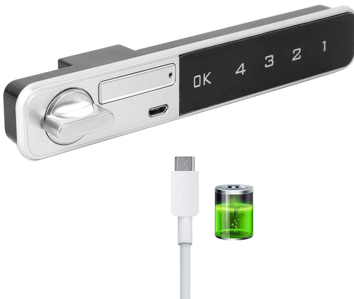
Image: A close-up view highlighting the USB emergency charging port on the lock.