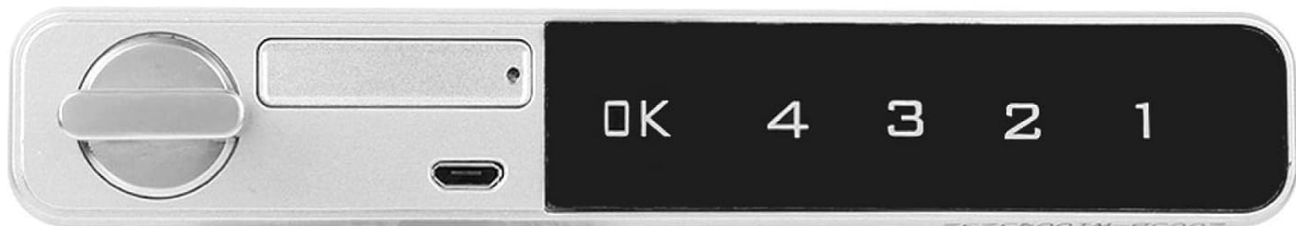
Image: Example of the electronic cabinet lock installed on a series of cabinets.