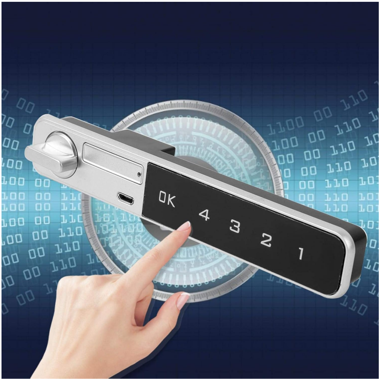
Image: A hand interacting with the touch keypad of the electronic cabinet lock.