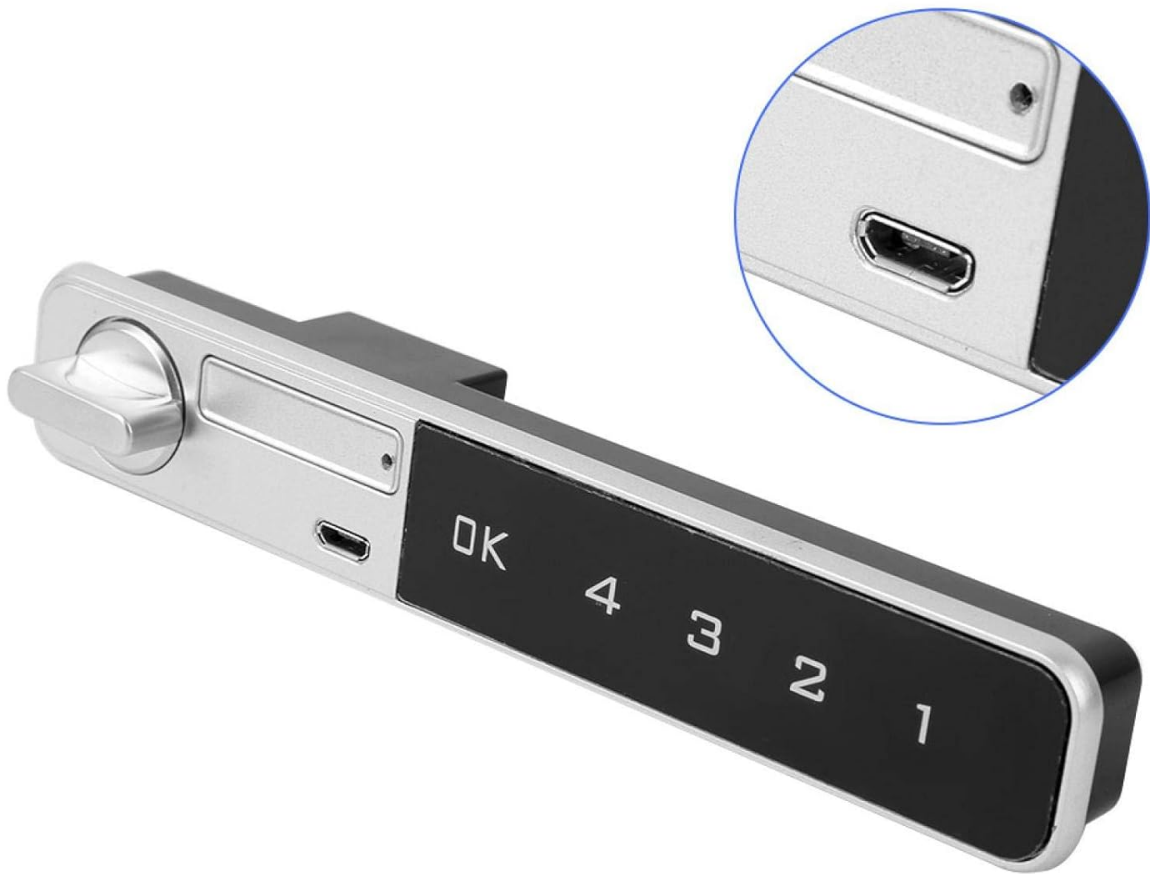
Image: Overview of the ADIUM Keyless Entry Electronic Cabinet Lock, showing the main unit and its components.