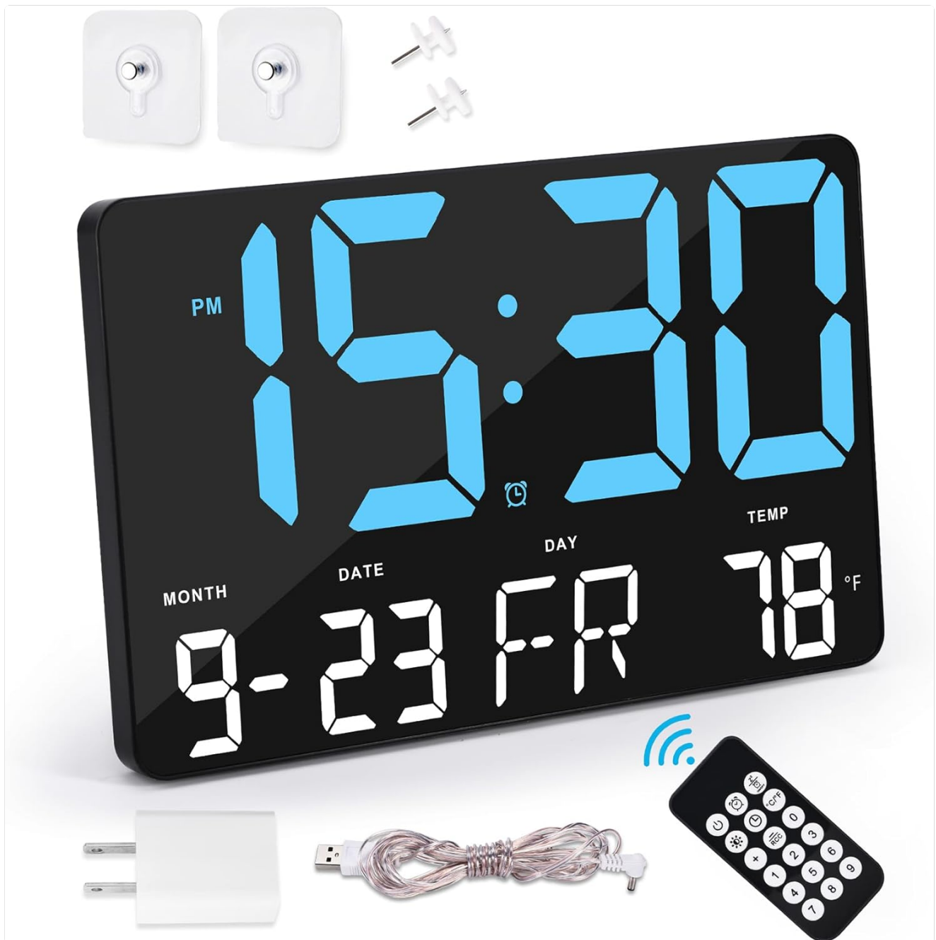
Image: Amgico Digital Alarm Clock with included accessories: power adapter, USB cable, remote control, CR2032 battery, and mounting hardware.