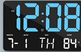
Amgico Large Clock