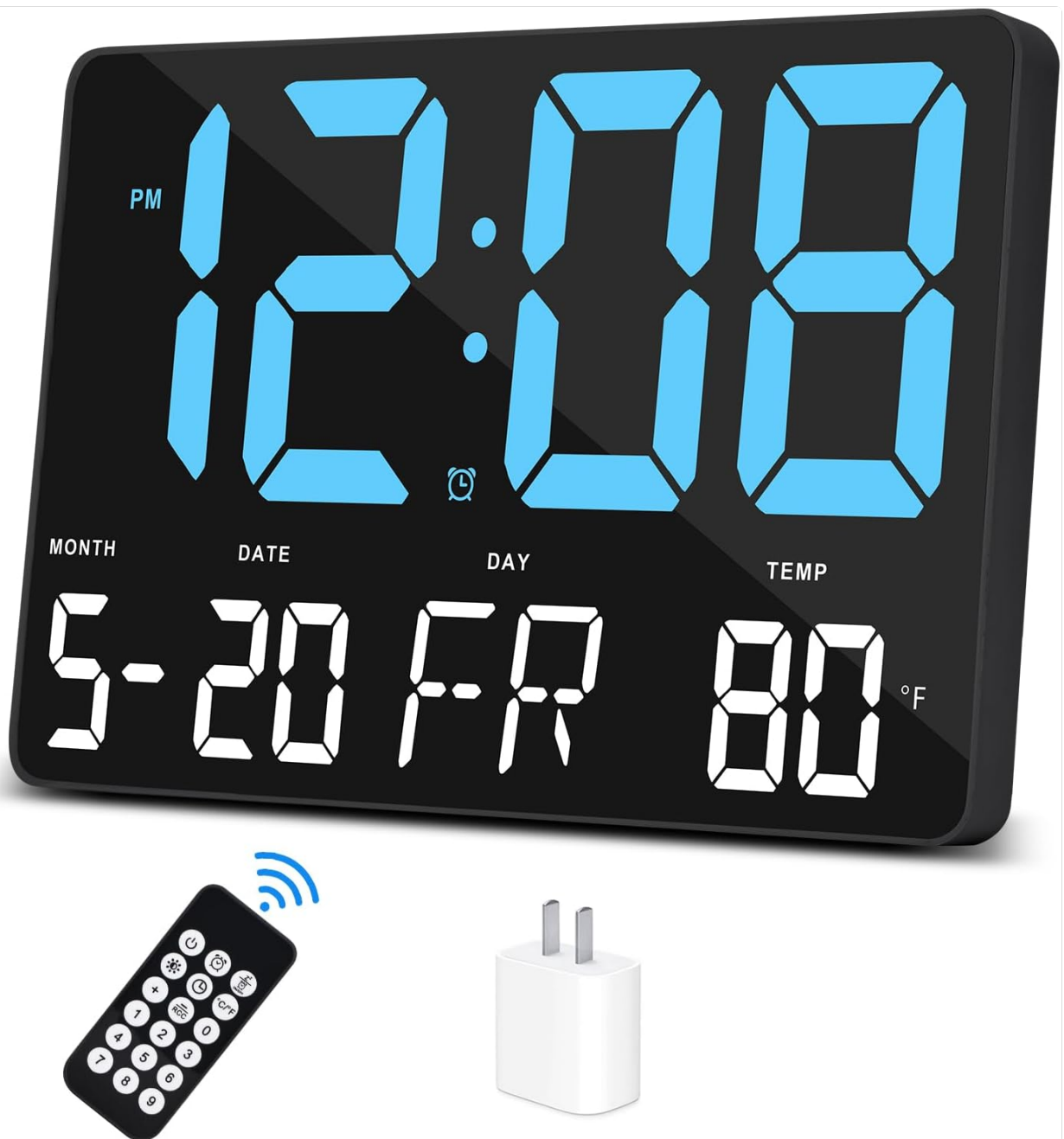
Image: The Amgico Digital Alarm Clock displaying time, date, and temperature, shown with its remote control and power adapter.