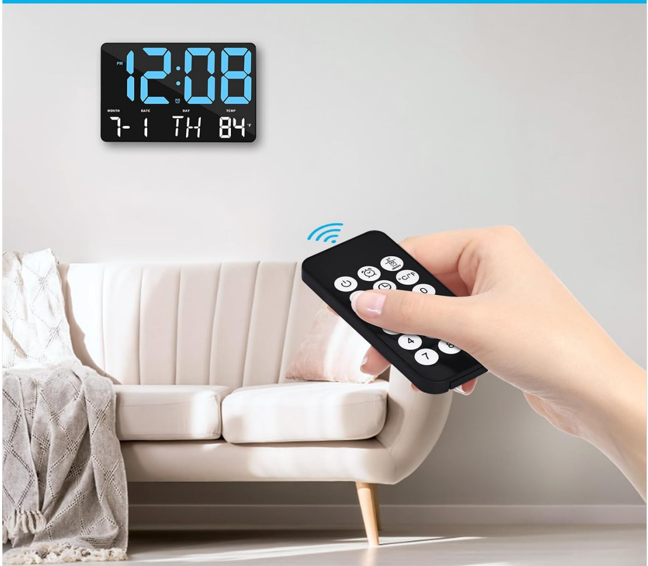
Image: A hand holding the wireless remote control, demonstrating its use to adjust the Amgico Digital Alarm Clock from a distance.