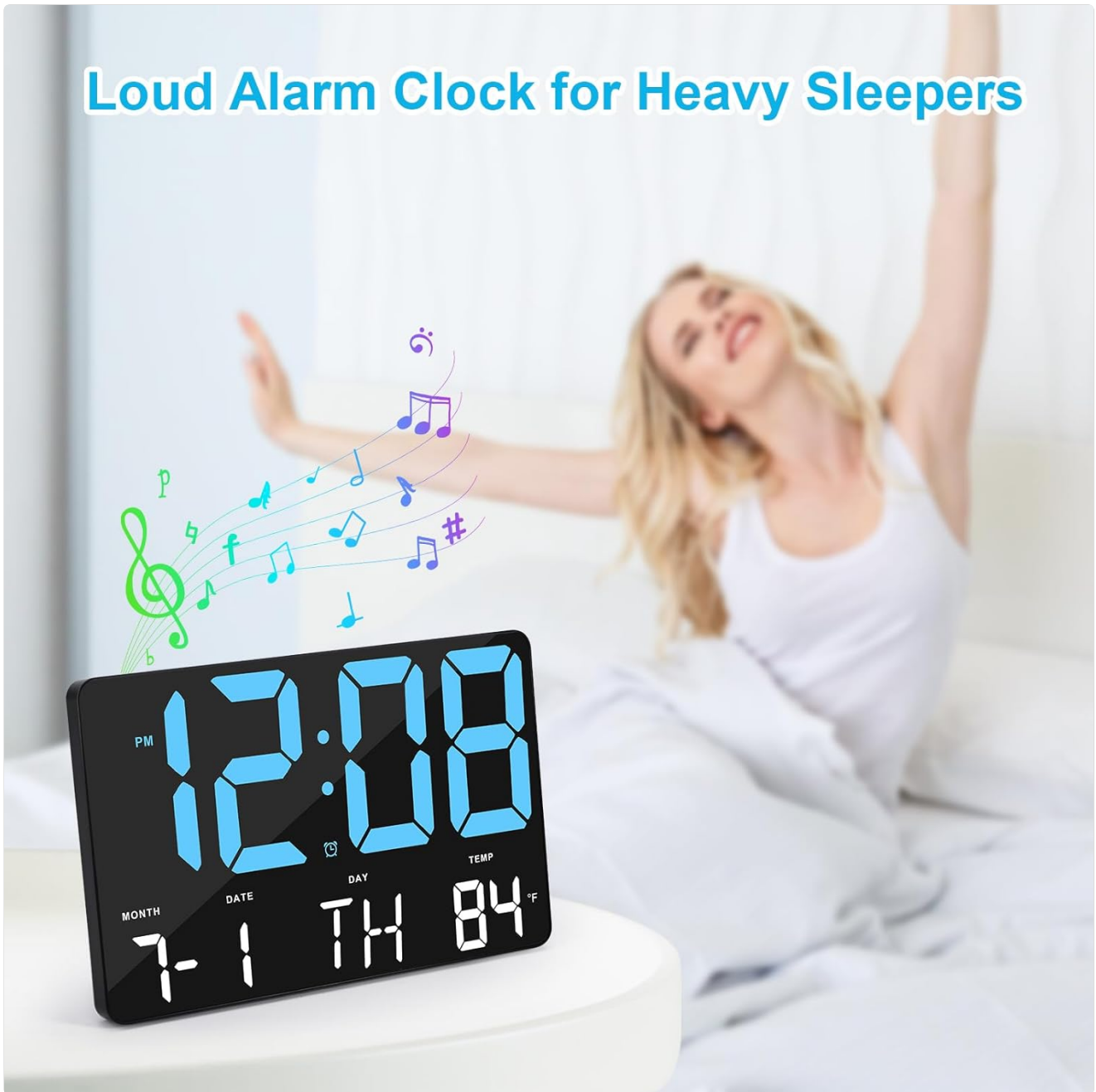
Image: The Amgico Digital Alarm Clock on a nightstand, illustrating its alarm function with musical notes emanating from the display, indicating a loud alarm suitable for heavy sleepers.