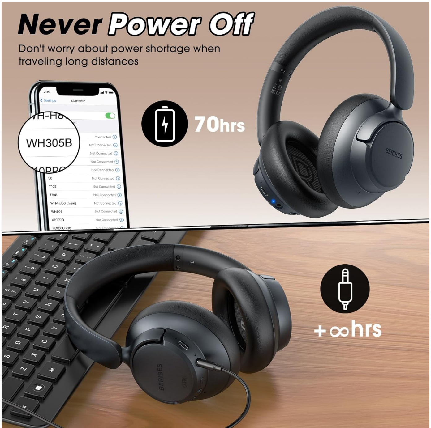
The image shows the headphones successfully paired with a smartphone via Bluetooth, with the device name 'WH305B' visible on the screen.