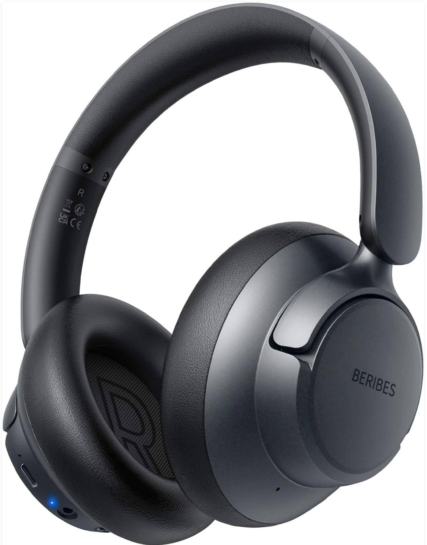
Front view of the BERIBES WH305B headphones in black.