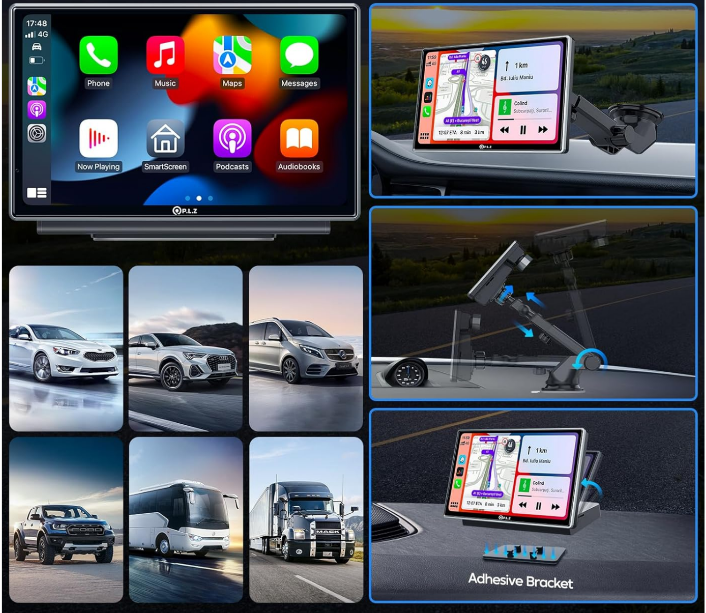
Figure 5.1: Universal compatibility and multiple installation options for the PLZ screen.