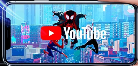
Figure 4.3: Wireless Mirror Link function for displaying smartphone content on the larger screen.