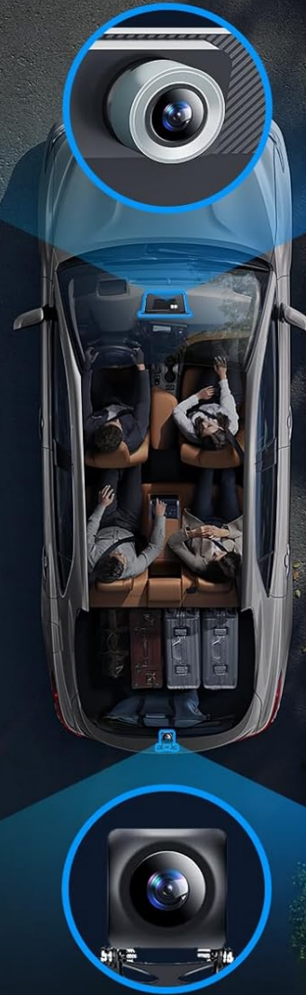
Figure 4.4: Integrated 2.5K Dash Camera and 1080P Rear Camera features.