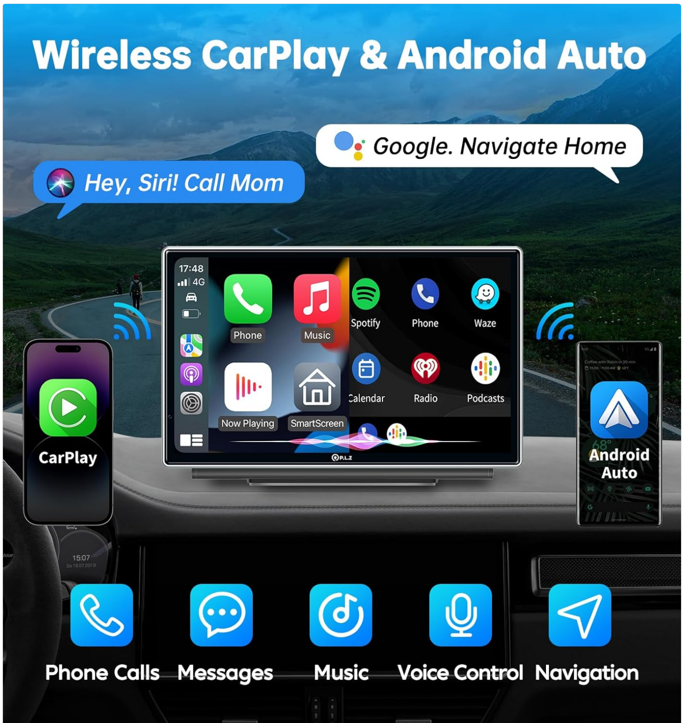
Figure 4.1: Main features of the PLZ Portable Car Stereo Screen, including wireless CarPlay and Android Auto.