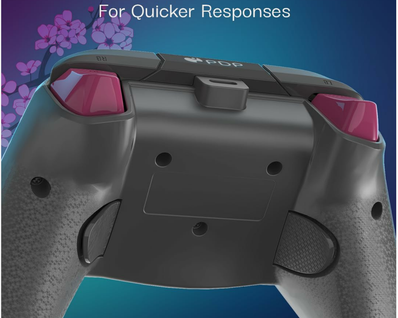
Image 4.1: The programmable back buttons are located on the underside of the controller grips.