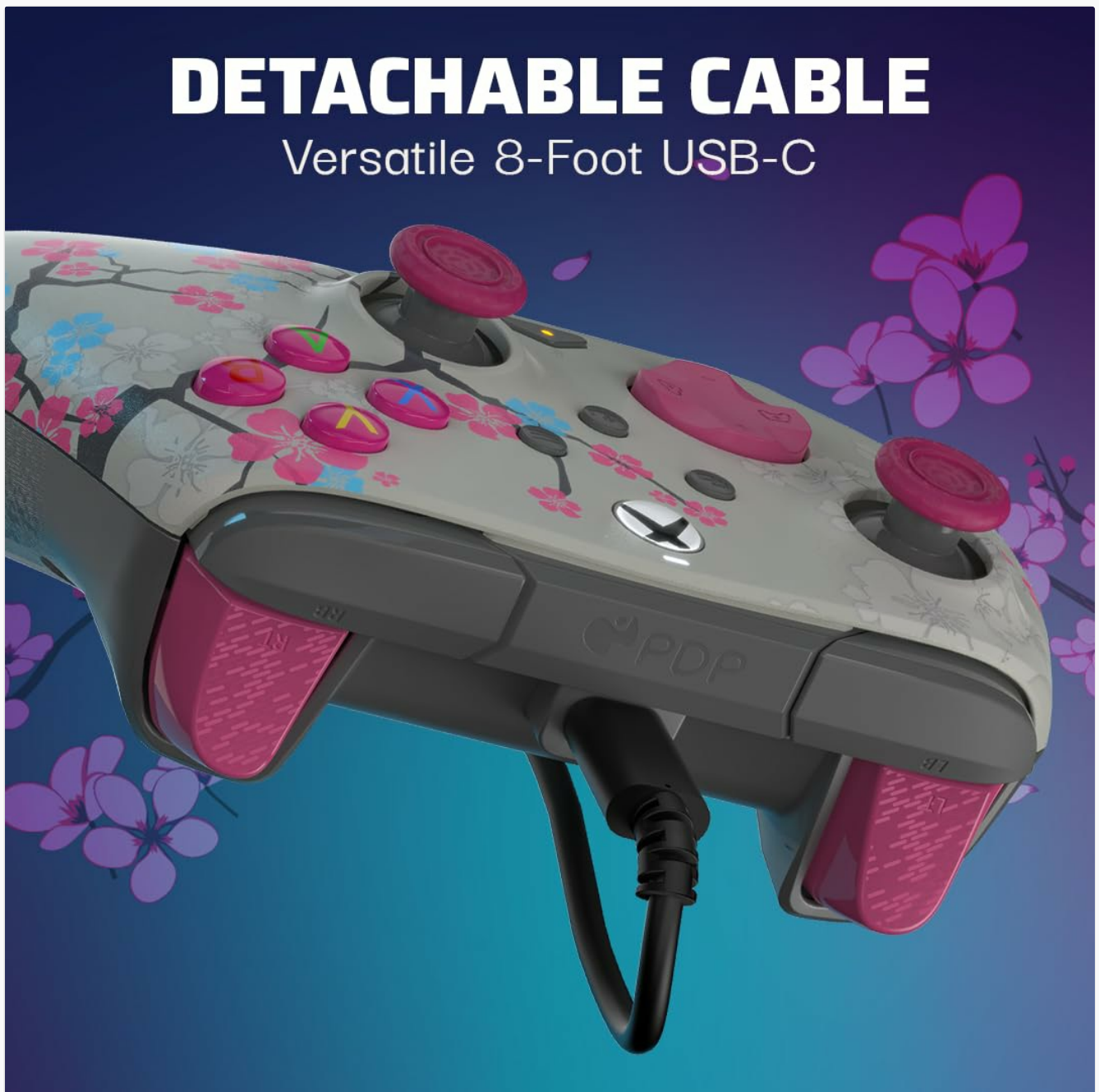
Image 3.1: The detachable 8-foot USB-C cable provides a reliable wired connection.