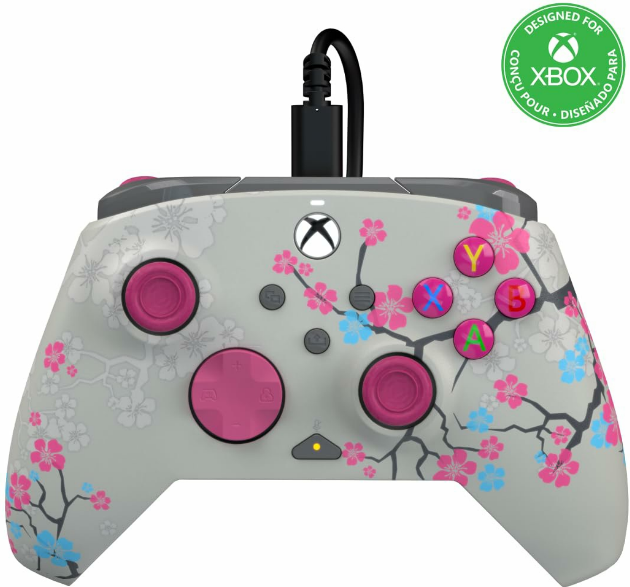
Image 1.1: Front view of the PDP Gaming REMATCH GLOW Enhanced Wired Controller with Cherry Blossom design.