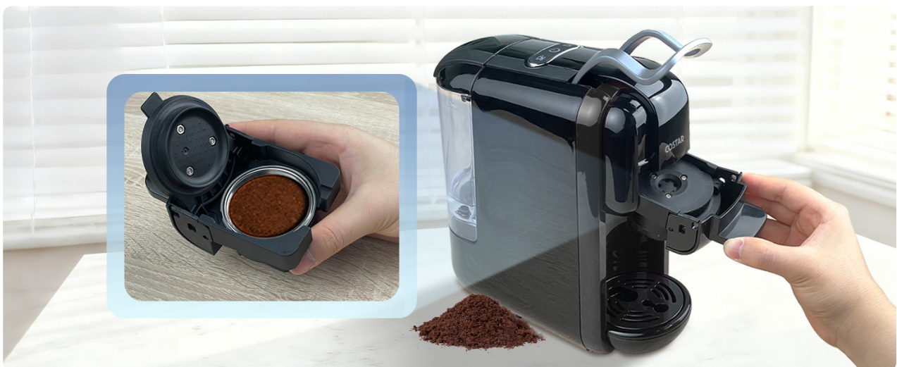
Figure 4.2: Adding and tamping coffee powder.