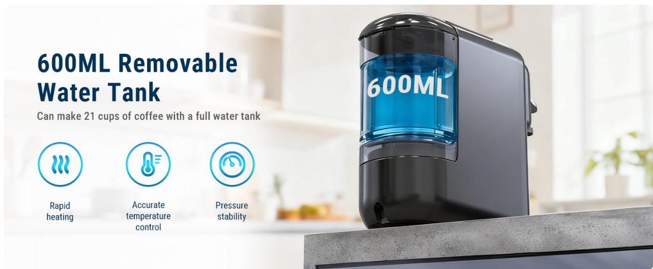
Figure 3.1: Filling the 600ml removable water tank.