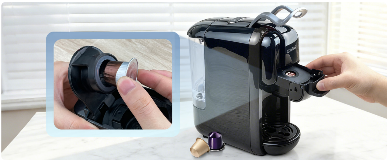
Figure 4.1: Inserting a coffee capsule.