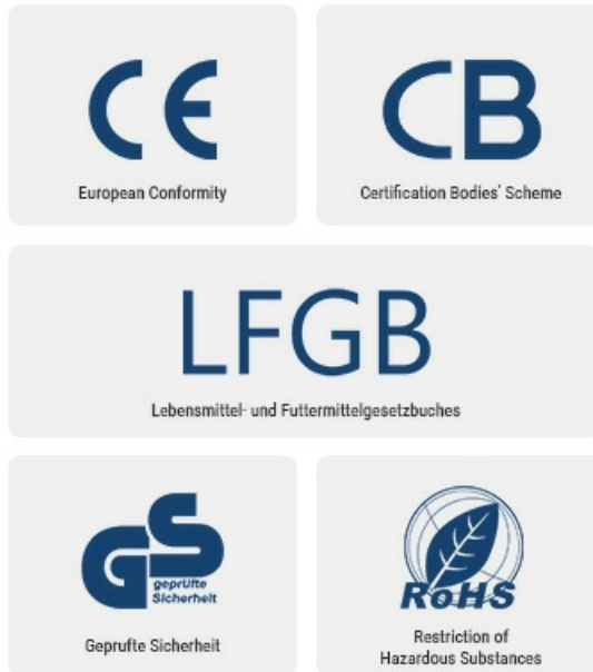
Figure 8.1: Global Certifications for the product.