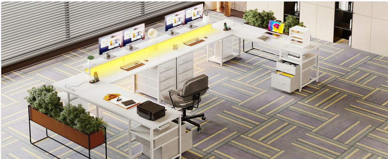
Image: The LED light strip with its control remote, illustrating lighting modes and color variations.