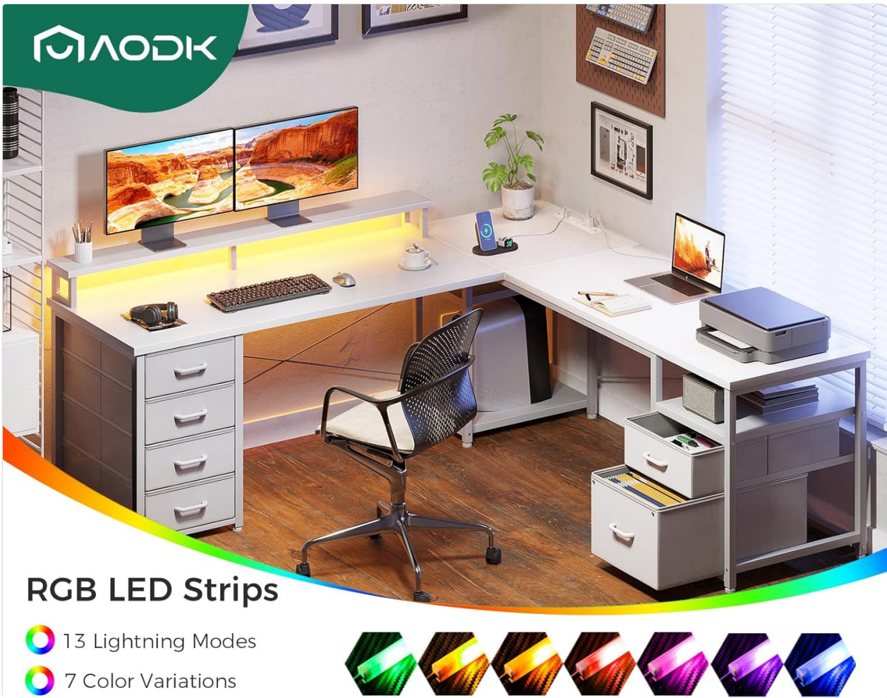
Image: The desk with RGB LED strips activated, showcasing various color options.