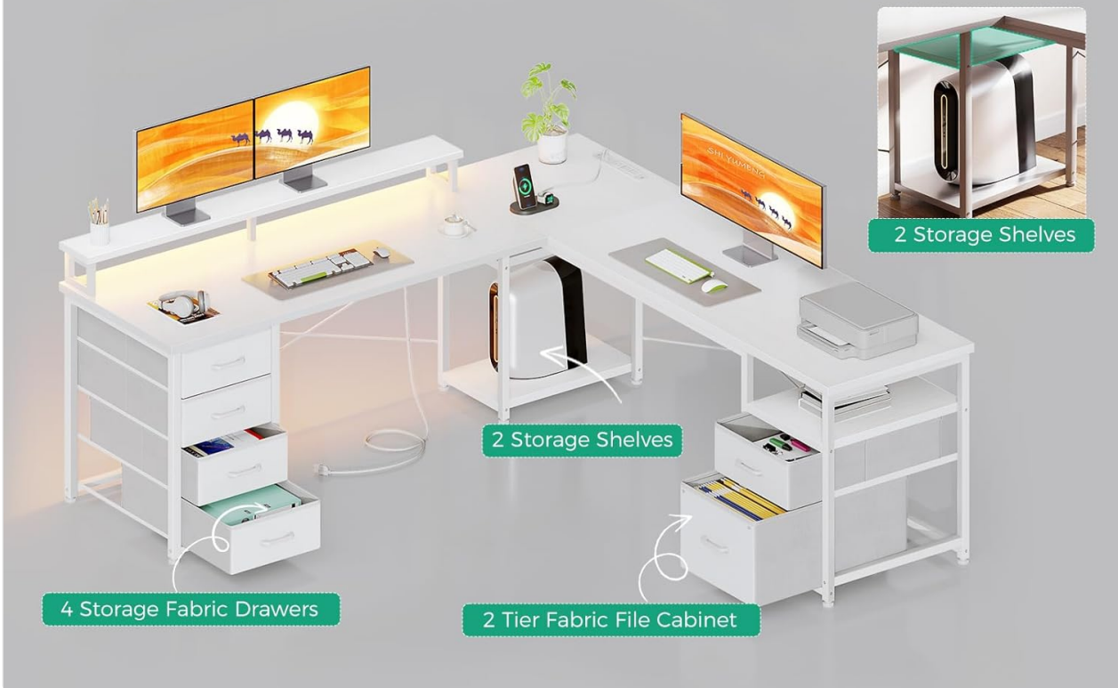
Image: Overview of the desk's storage capabilities, including fabric drawers and a file cabinet.

4 Storage Fabric Drawers | 2 Tier Fabric File Cabinet 2 Storage Shelves