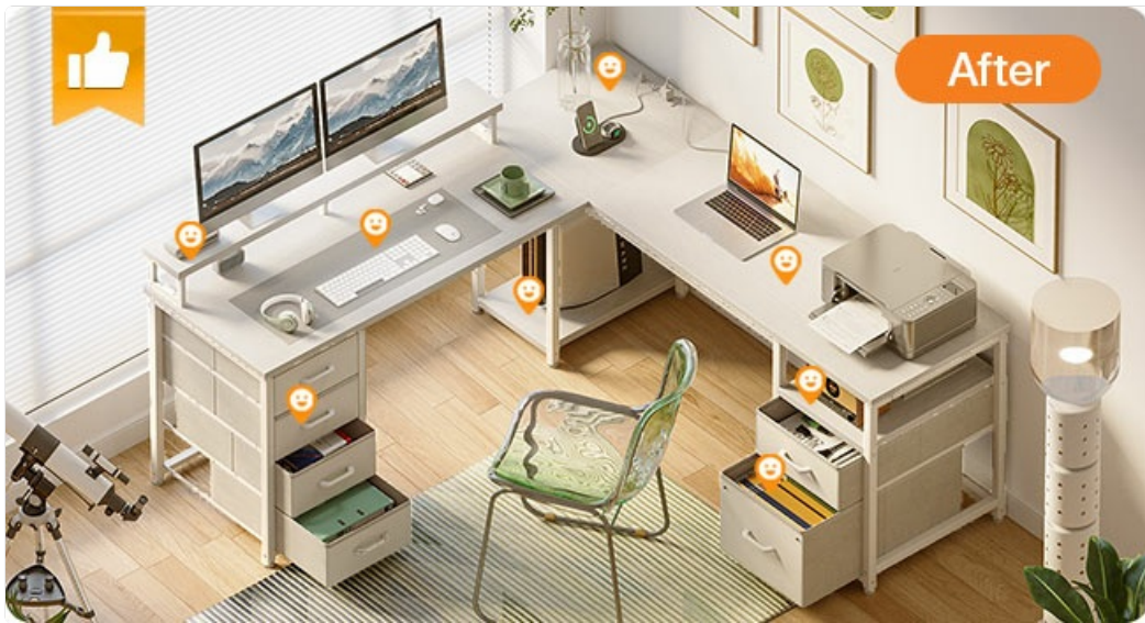
Image: Detailed view of the two-drawer fabric file cabinet, suitable for various document sizes.