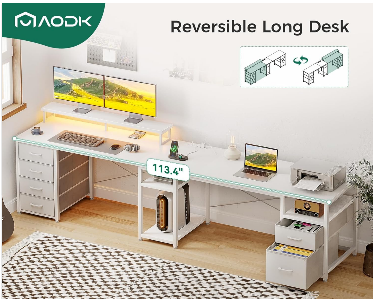
Image: The desk configured as a 113" long desk, demonstrating its adaptability for different spaces.