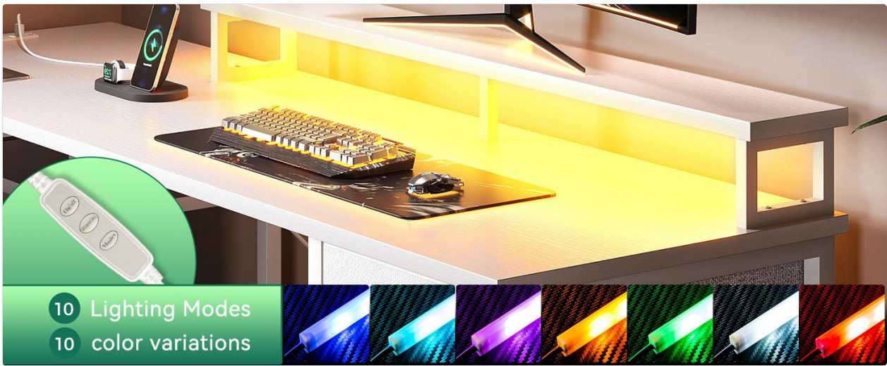
Image: The long monitor stand, designed to promote ergonomic posture and comfortable viewing.