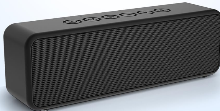
Figure 4: IPX6 Waterproof Feature