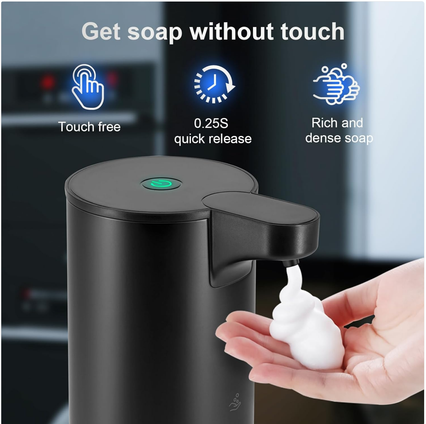
Image: The LAOPAO X8 automatic foaming soap dispenser in black, dispensing a rich lather of foam soap into an outstretched hand.

Once the dispenser is turned on, place your hand underneath the nozzle. The high-precision infrared sensor will detect your hand and release foam in approximately 0.25 seconds.