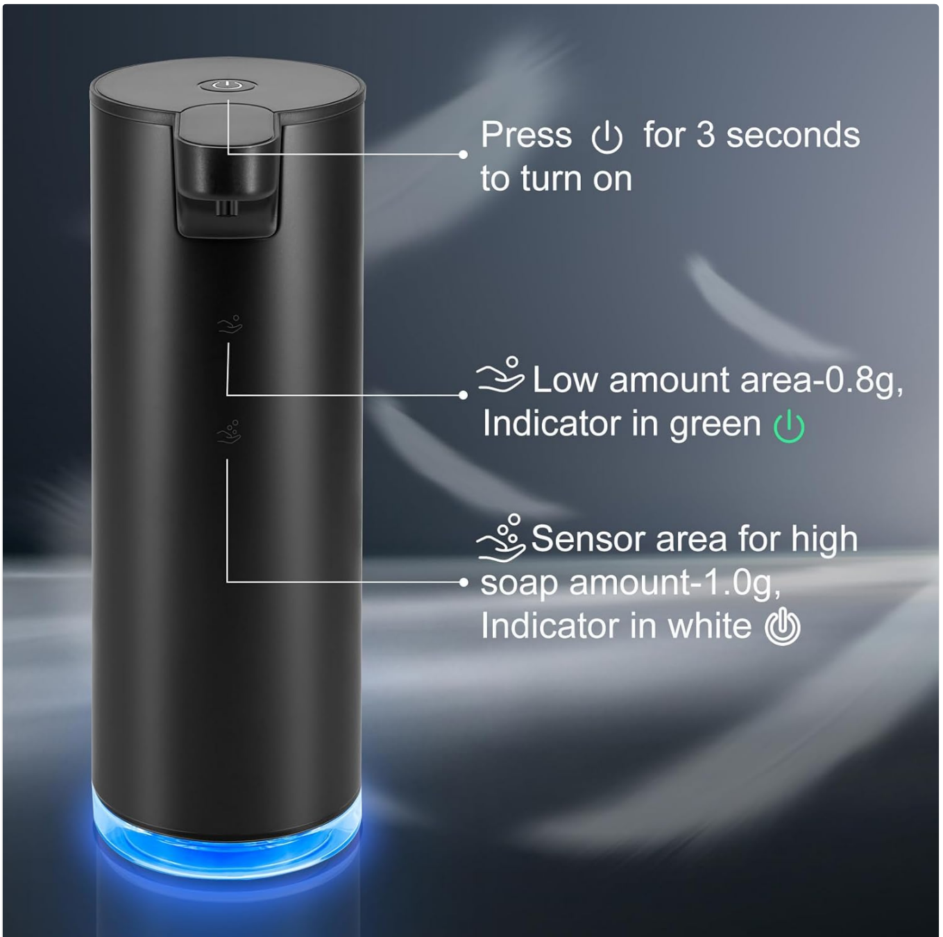
Image: A diagram of the LAOPAO X8 dispenser highlighting the sensor areas for dispensing 0.8g (low amount, green indicator) and 1.0g (high amount, white indicator) of soap.