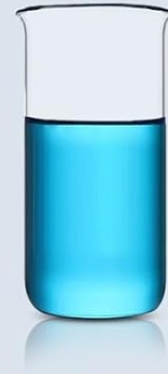
Image: A visual guide illustrating the dilution process for liquid soap (4-6 parts water to 1 part soap) and the direct use of foam soap.