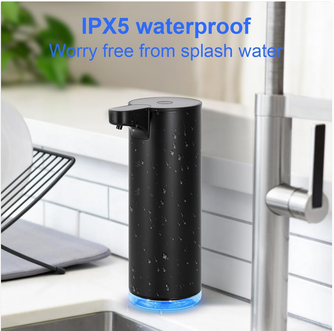
Image: The LAOPAO X8 dispenser standing on a countertop with water droplets on its black surface, demonstrating its IPX5 waterproof capability.

The dispenser has an IPX5 waterproof rating, meaning it is protected against low-pressure water jets from any direction. This makes it suitable for use in bathrooms and kitchens without worry of splashing water. Ensure the rubber plug for the USB charging port is securely closed to prevent moisture entry.