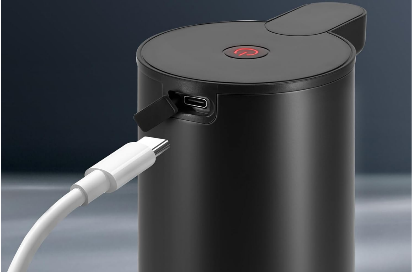
Image: The LAOPAO X8 dispenser with its USB charging port visible, connected to a white charging cable.