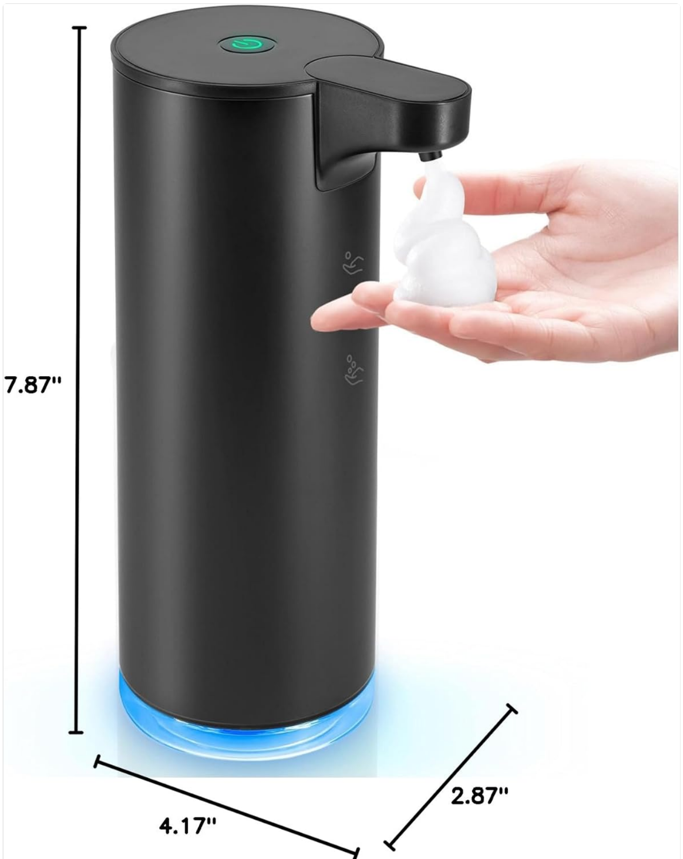
Image: The LAOPAO X8 dispenser with its length (7.87"), width (2.87"), and depth (4.17") clearly indicated.