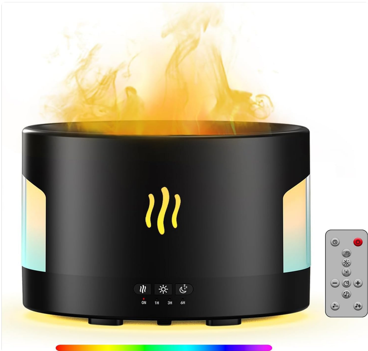
Figure 7: The main product image showing the diffuser unit and its remote control.