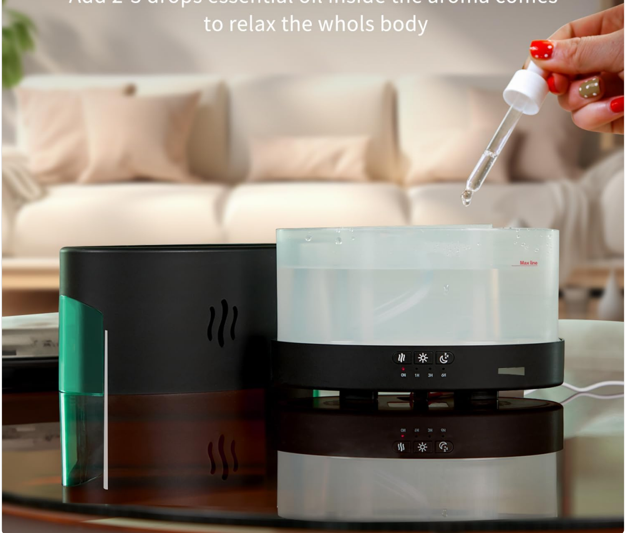
Figure 6: The diffuser highlighting its 3 modes timer function for scheduled operation.

Add 2-3 drops essential oil inside the aroma comes to relax the whols body