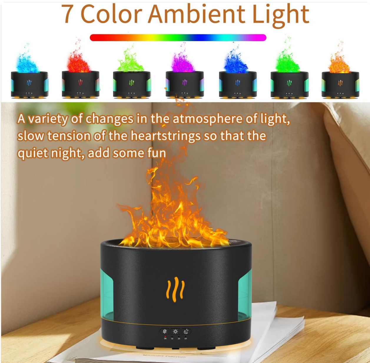
Figure 3: The diffuser showcasing its 7-color ambient light options, creating various atmospheric effects.

Press the light button (looks like a sun icon) on the unit or remote to cycle through the 7-color flame effects. The combination of RGB lights and mist creates a visually appealing simulated flame. You can also dim the light for a softer ambiance, making it suitable as a night light.