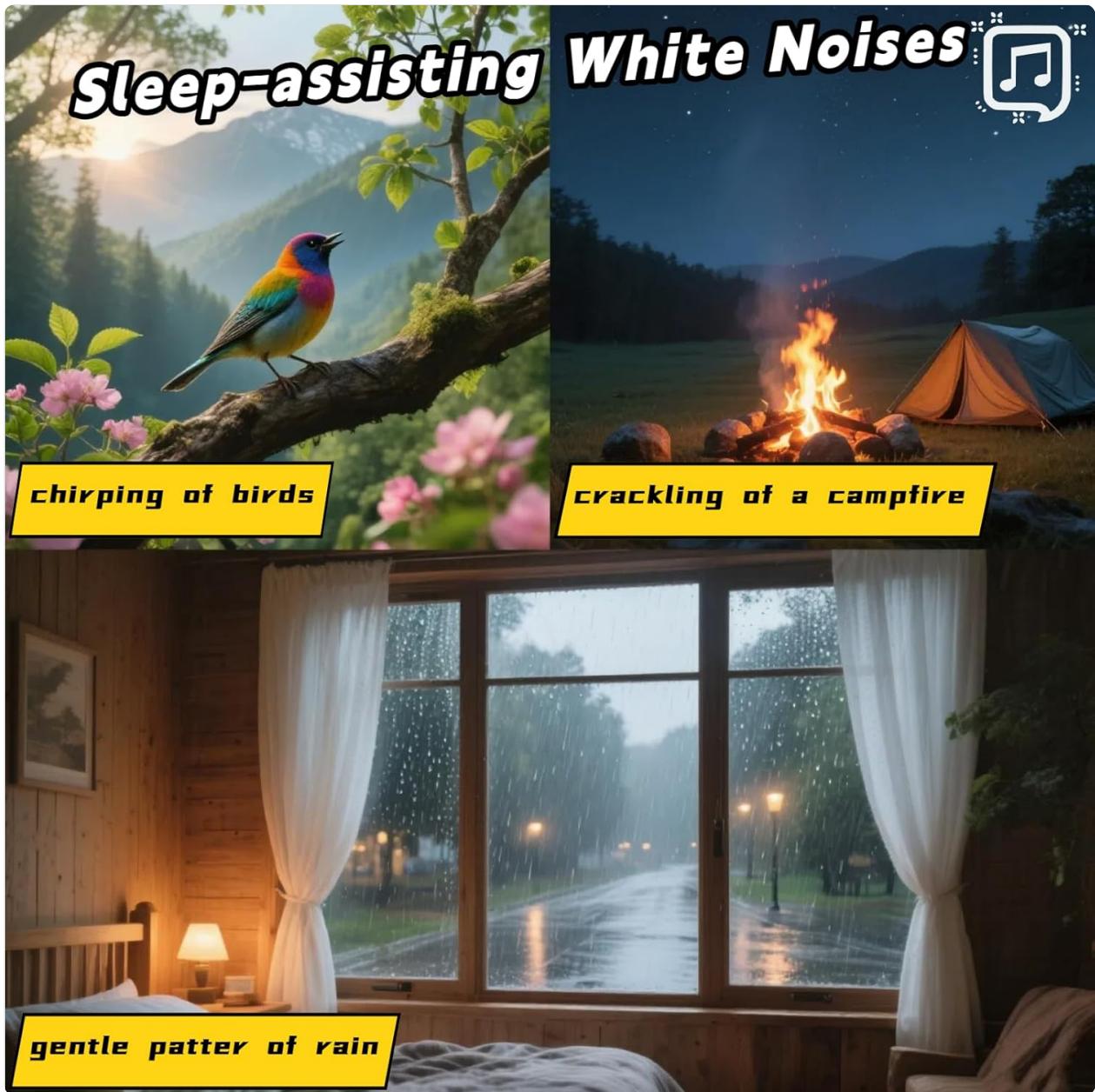
Figure 5: Visual representation of the sleep-assisting white noises available, including nature sounds.