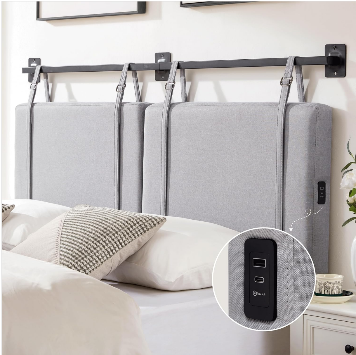
Image: Overview of the Weture Wall Mounted Queen Headboard, showing the two upholstered panels, mounting bar, and integrated USB/Type-C charging port.