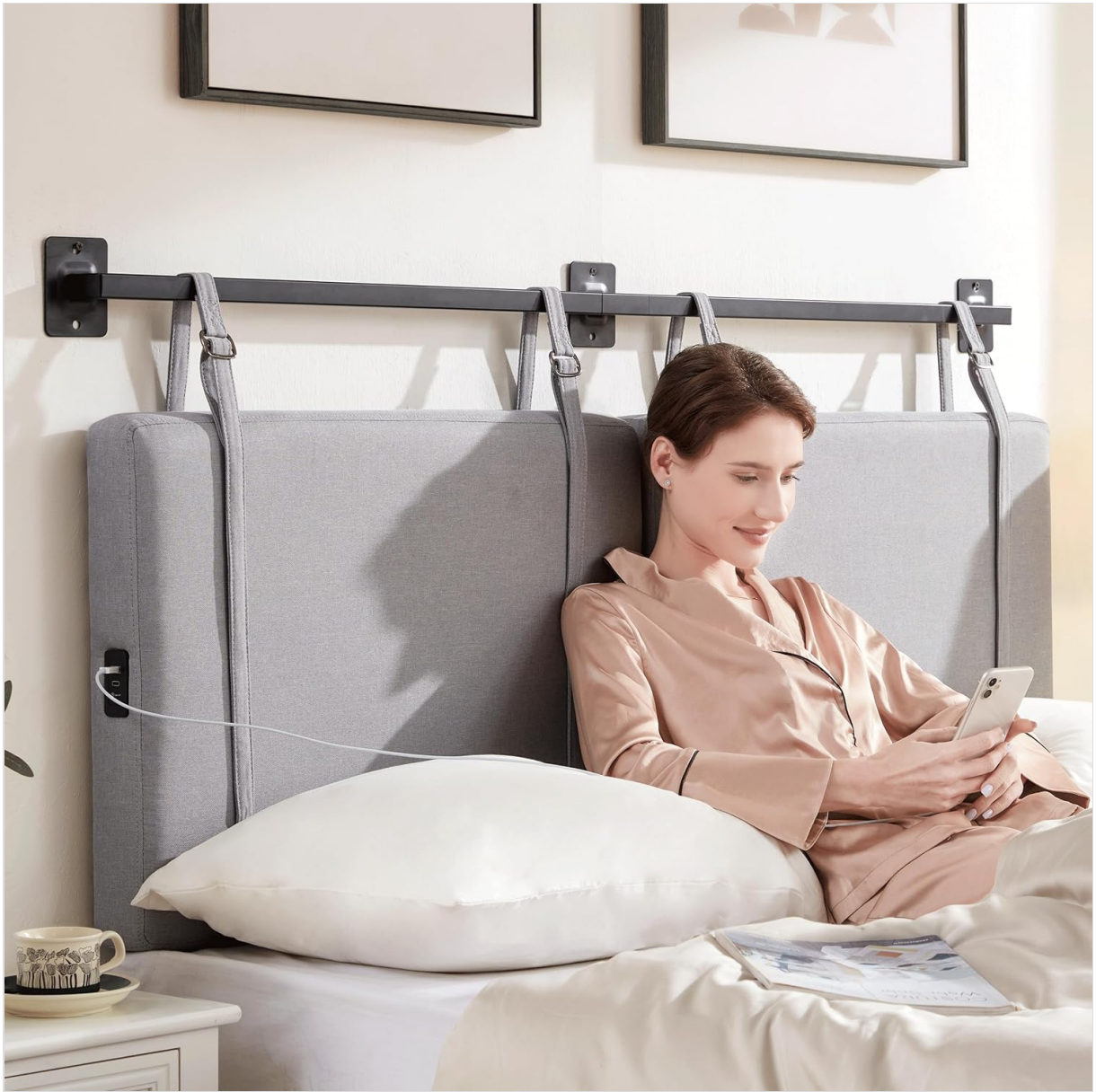
Image: A person comfortably leaning against the headboard while using a mobile phone, which is connected to the headboard's charging port.