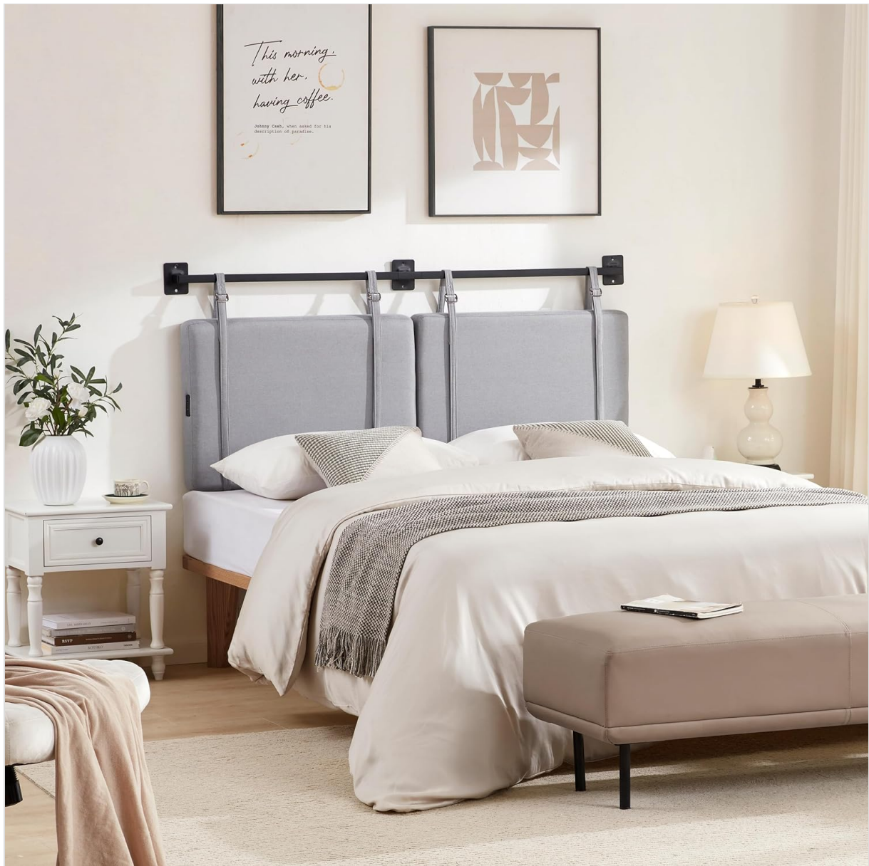
Image: A fully assembled Weture Queen Headboard behind a bed, illustrating the overall appearance and adjustable height capability.