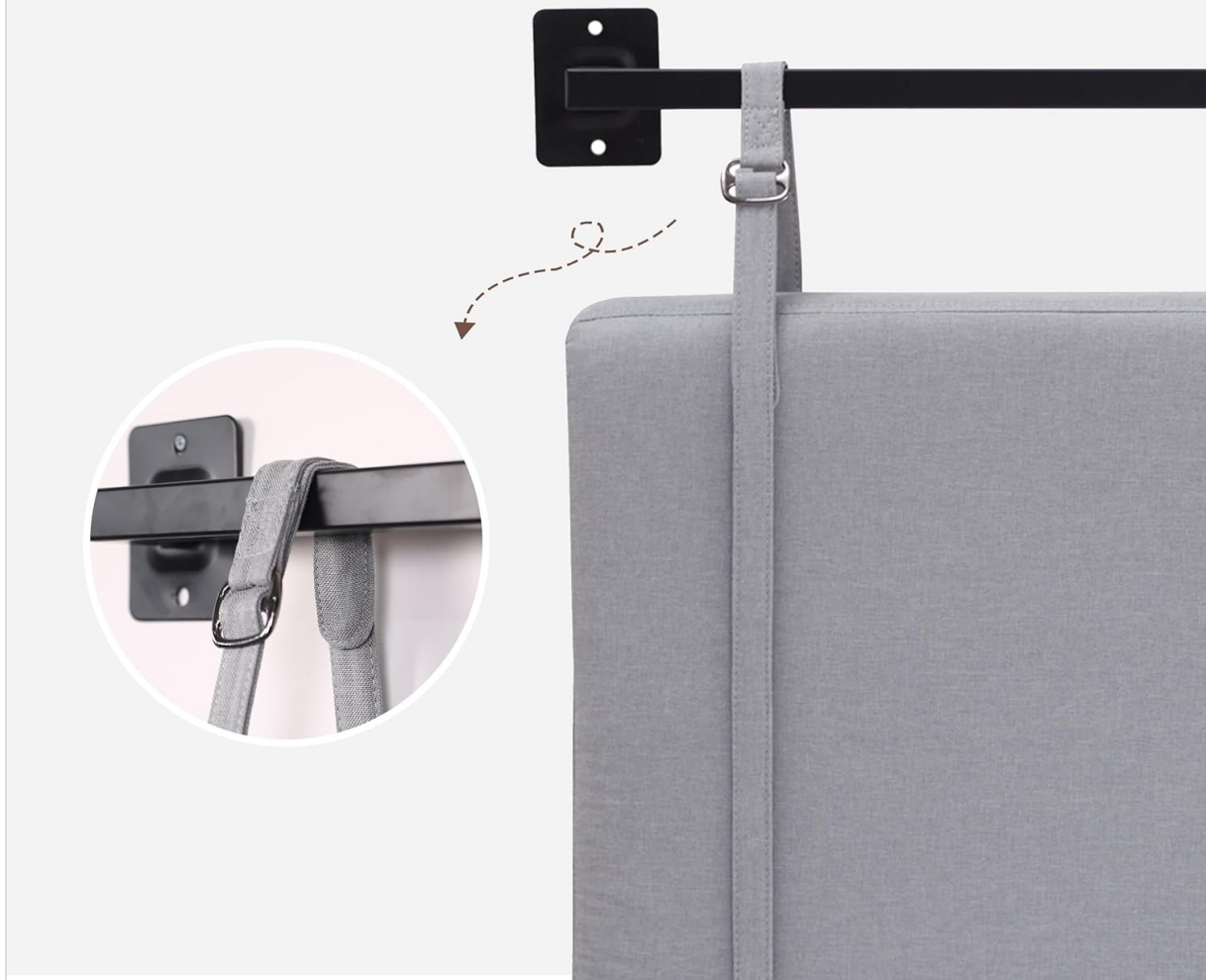
Image: Detailed view showing how the fabric strap with a metal buckle is properly installed over the mounting bar, ensuring secure attachment.