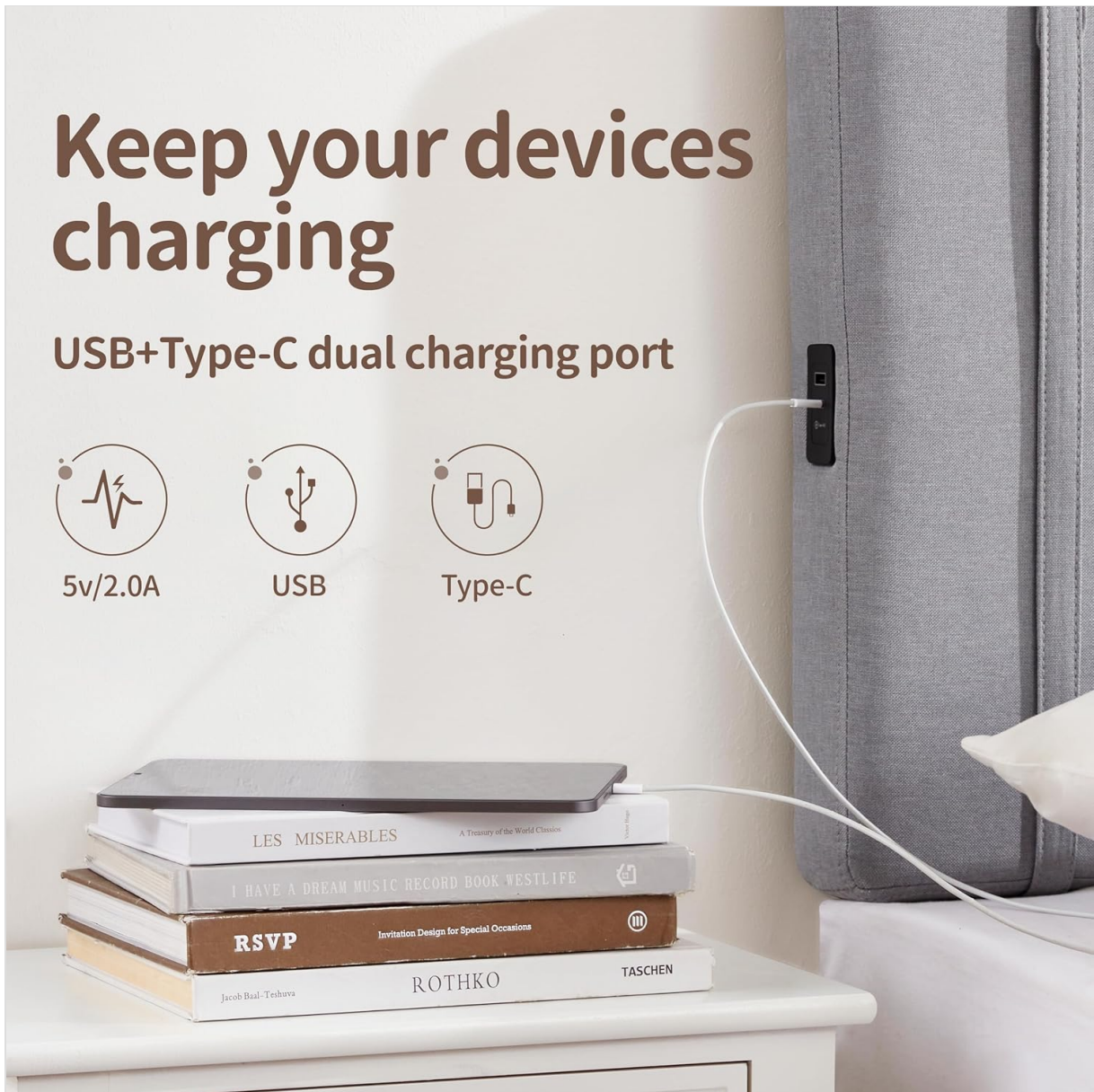
Image: A close-up view of the integrated USB and Type-C charging ports on the side of the headboard, with devices connected and charging.