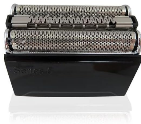
Image: A detailed diagram illustrating the ultrathin omentum technology, showing how the 0.056 mm membrane and mesh capture beard roots for an efficient shave.

0.056 mm ultra-thin membrane and the skin perfect fit, 2000 + mesh beard root easily shaved.