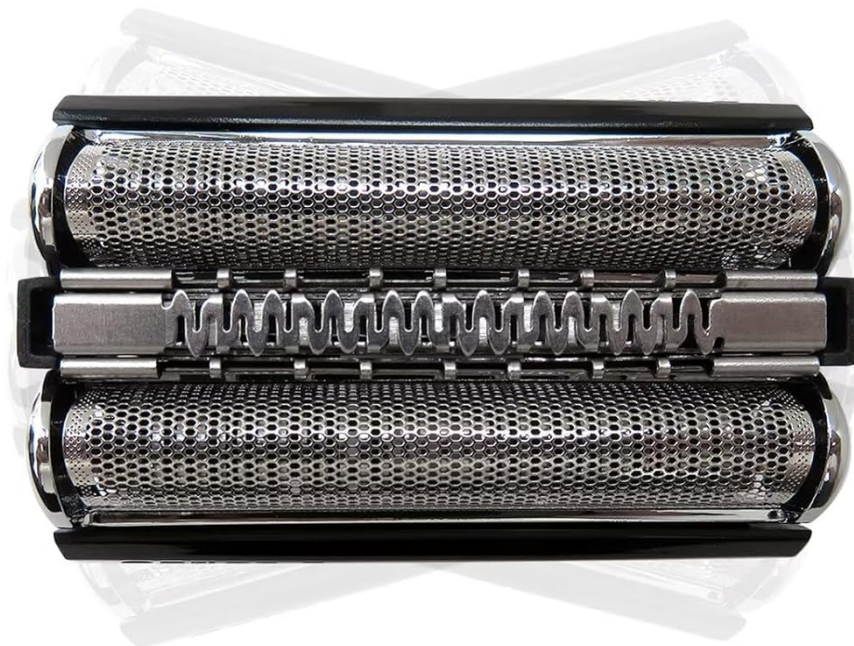
Image: An illustration demonstrating the effectiveness of the floating three heads on different beard lengths, from short stubble to longer whiskers.