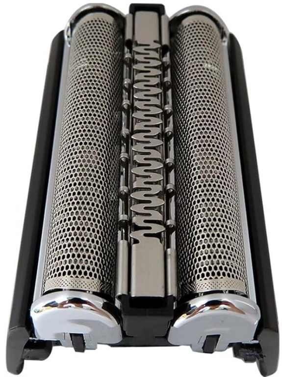
Image: The 52S replacement head, shown both in its sealed packaging and as a standalone unit, highlighting its design and components.