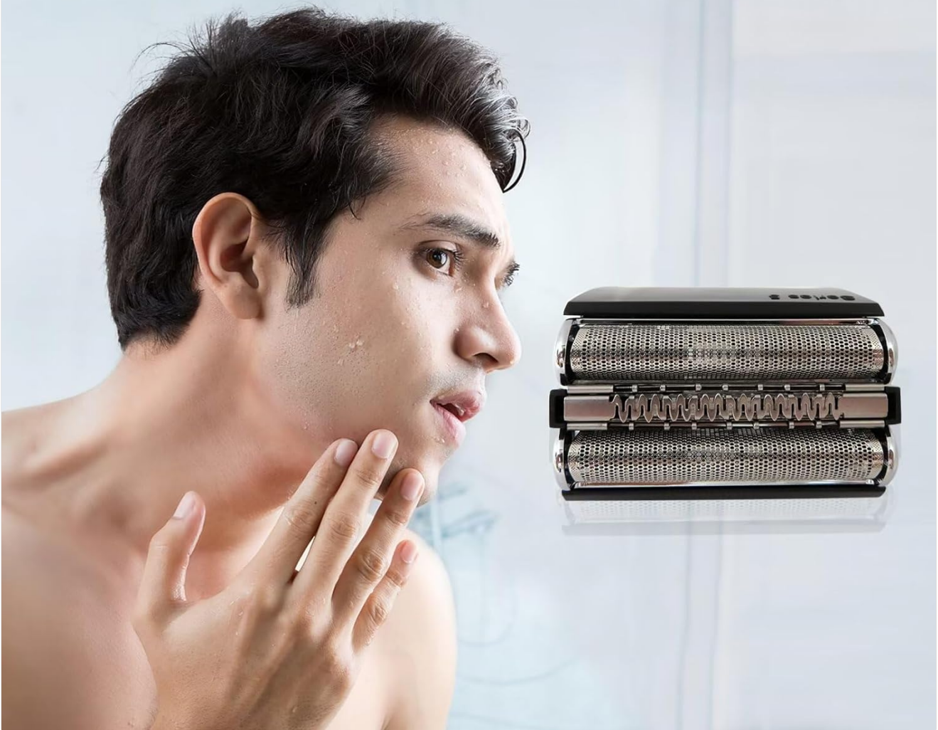
Image: A visual representation of the shaver head in use, emphasizing its clean and smooth shaving capability, which is maintained through proper cleaning.

Easy to clean, easy to remove, direct washing, high-quality knife net, easy and smooth shaving clean beard.