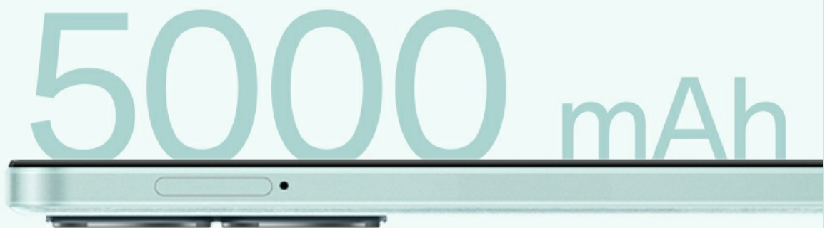
Figure 3: The OPPO A58 is equipped with a 5000mAh large battery.