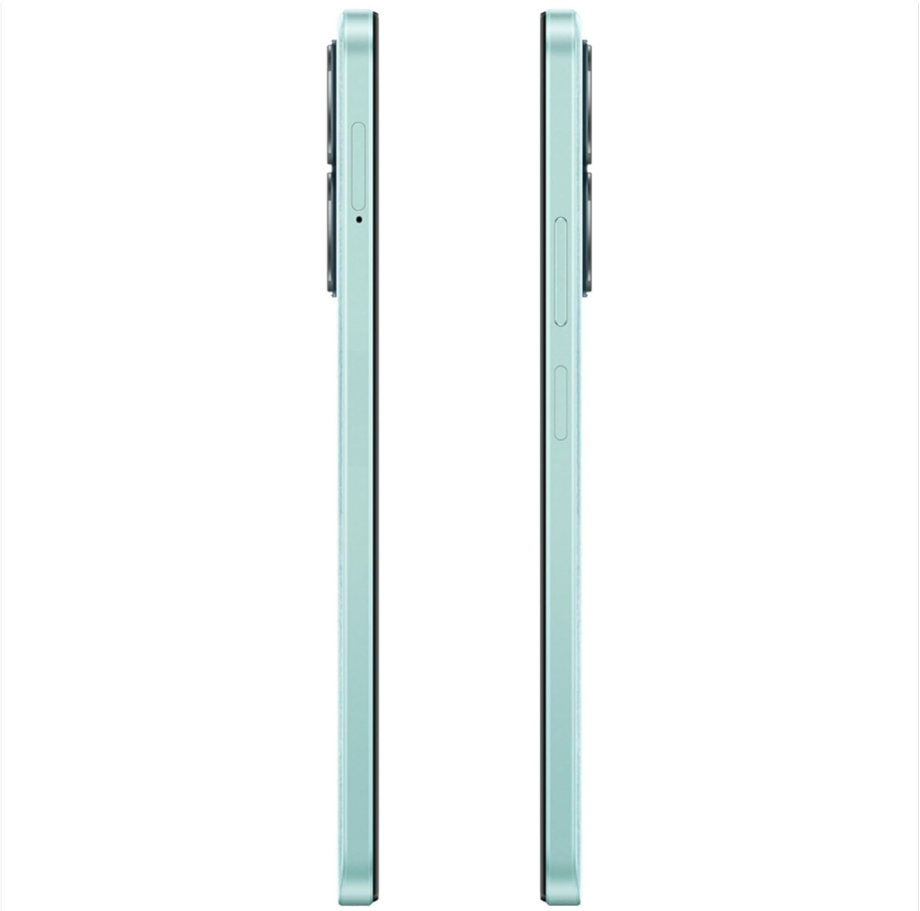
Figure 2: Side view of the OPPO A58, indicating the SIM card tray location.