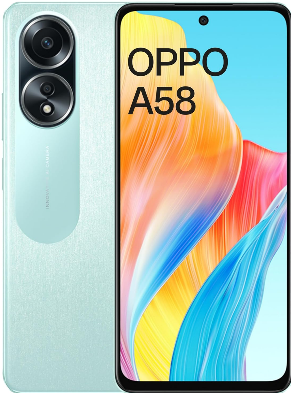
Figure 1: Front view of the OPPO A58 smartphone.