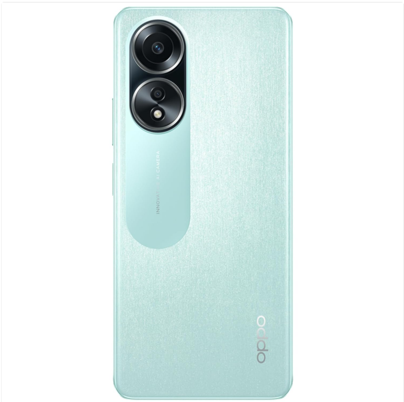
Figure 5: Rear view of the OPPO A58, highlighting the dual camera system.