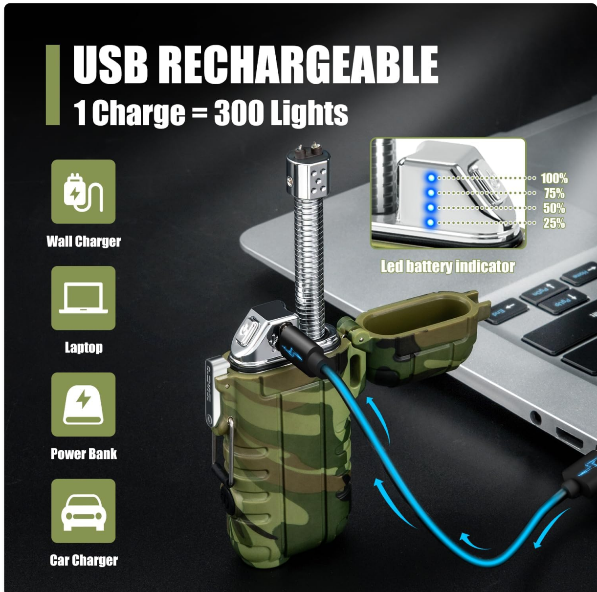
Figure 1: Lighter charging via USB-C with LED battery indicator.