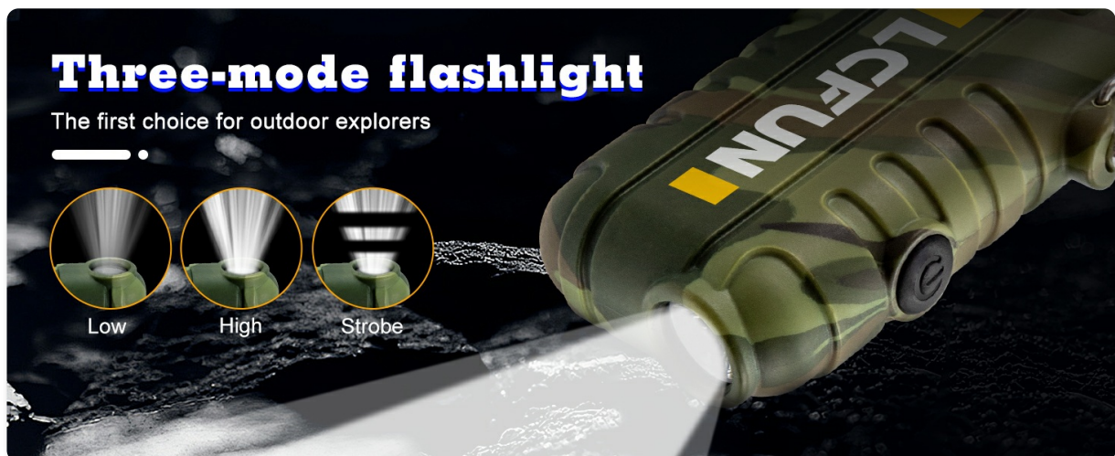
Figure 6: Visual representation of the three flashlight modes.