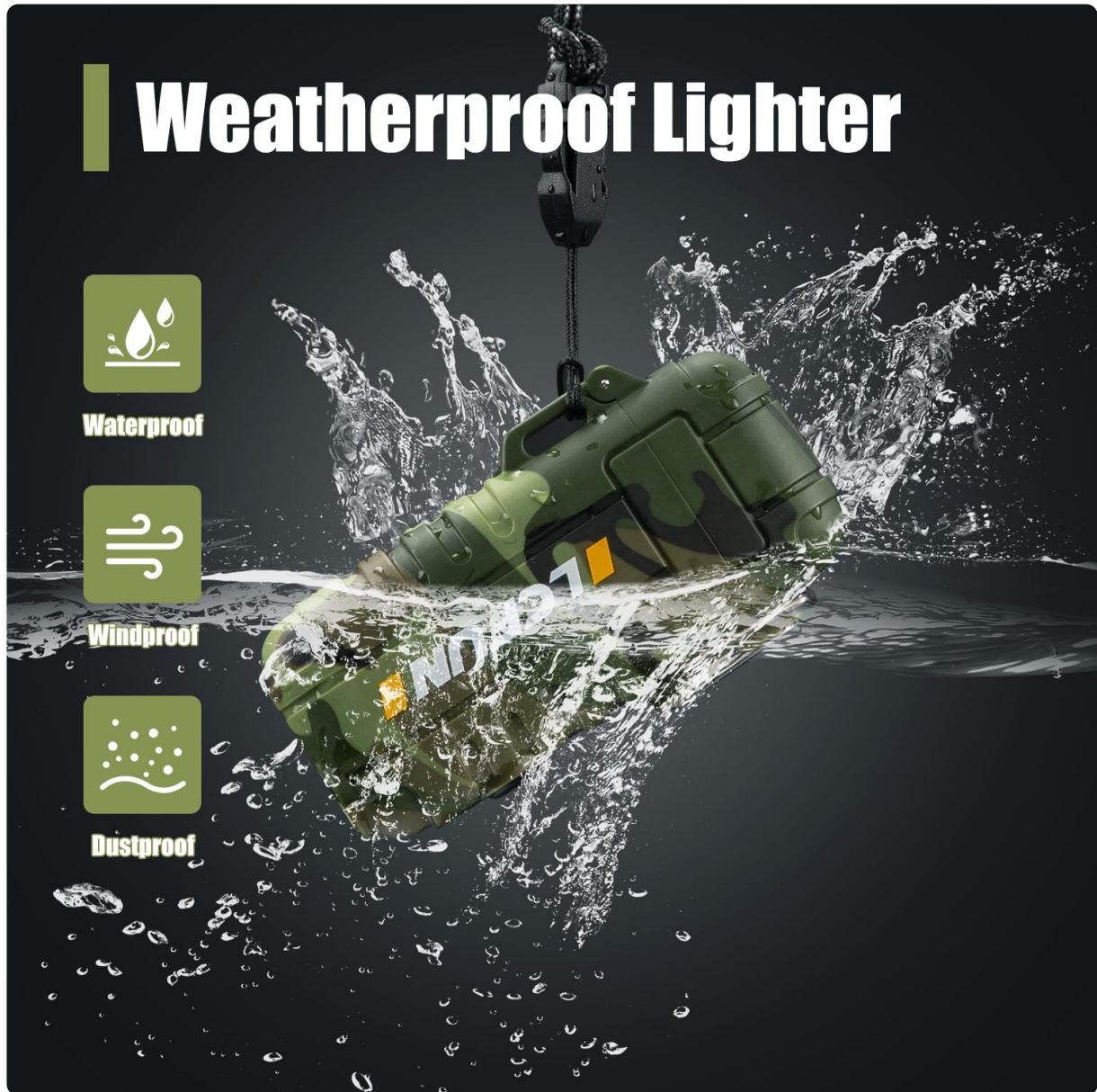
Figure 7: Lighter demonstrating its waterproof, windproof, and dustproof features.