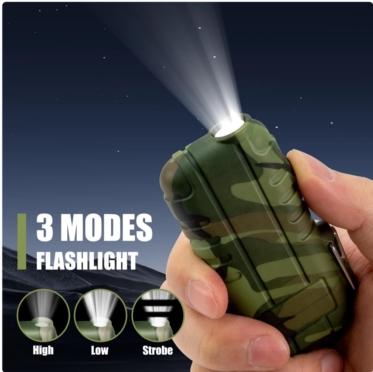
Figure 5: The 3-mode flashlight in operation.