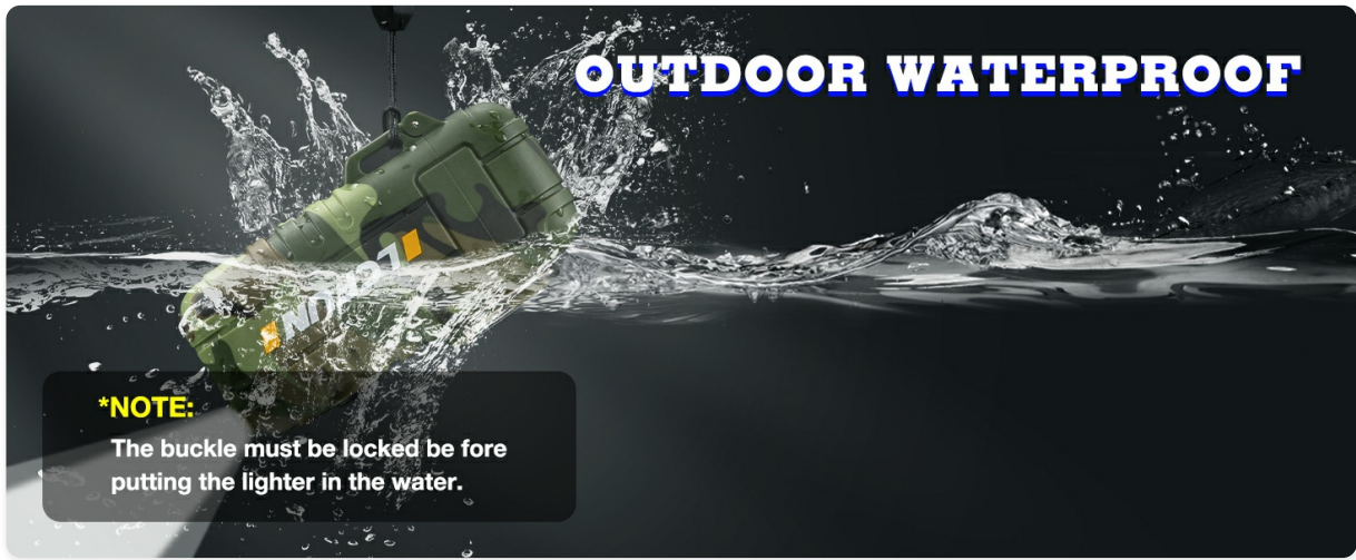
Figure 8: Outdoor waterproof feature with important note on buckle lock.

Your browser does not support the video tag.