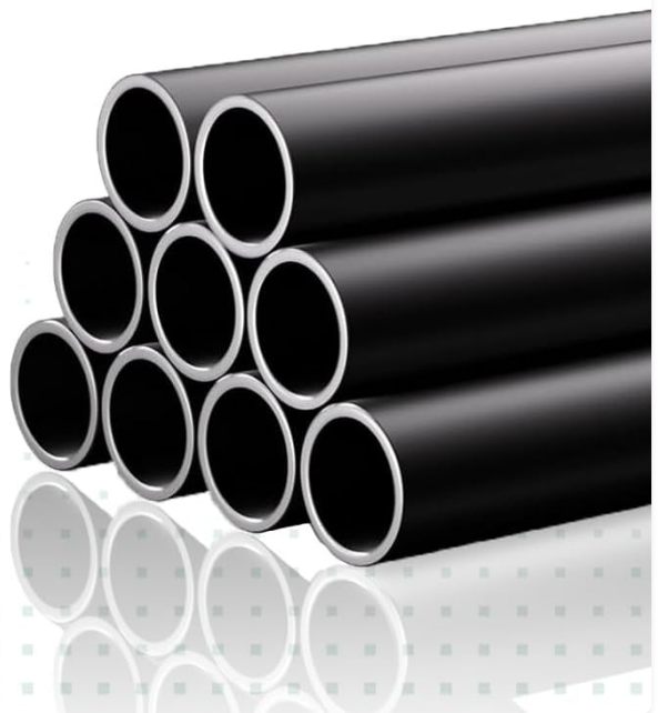
Image: Diagram illustrating the specifications of the steel pipes, including 18mm diameter and 1mm thickness, emphasizing properties like no deformation, no color peeling, and no rust.