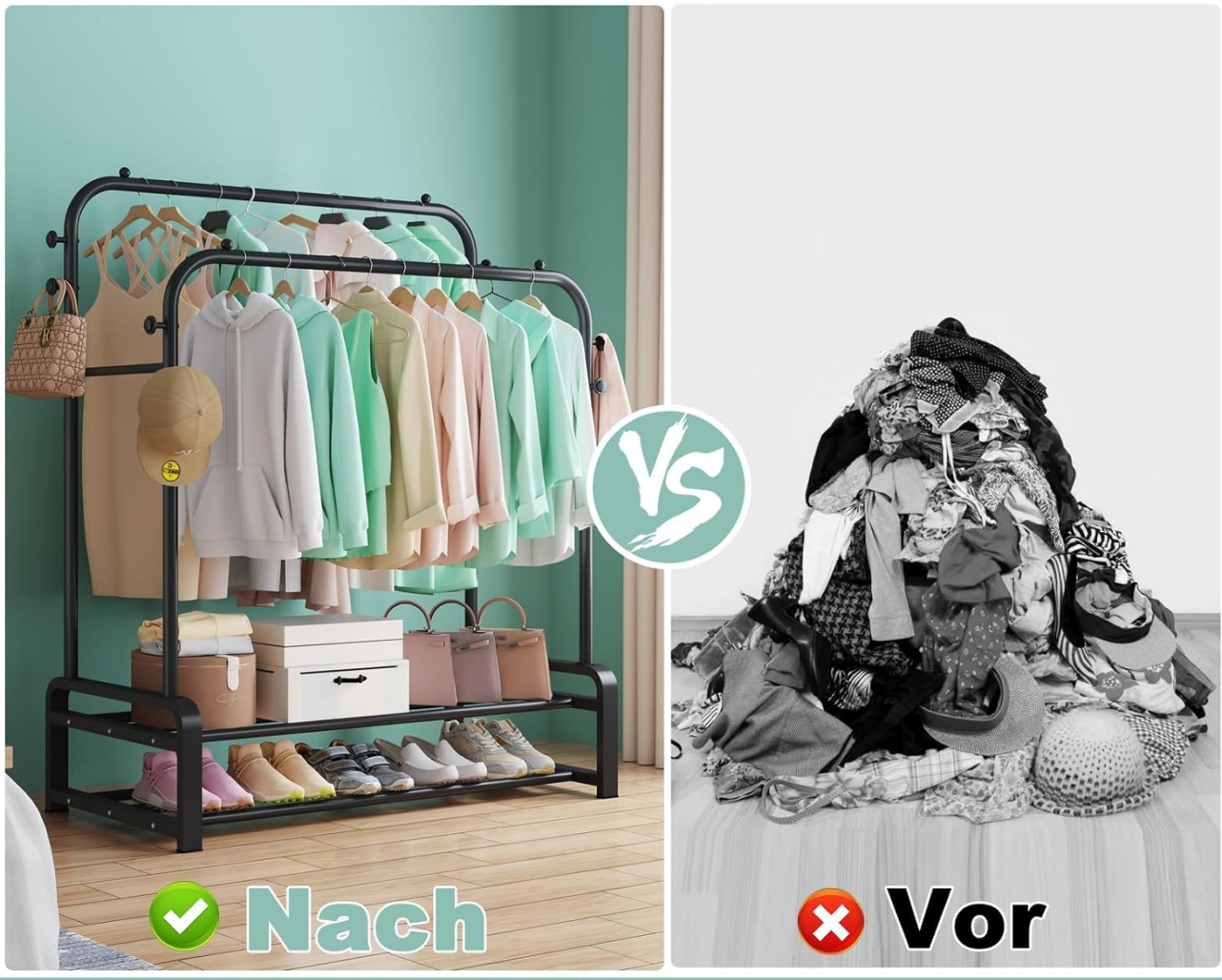
Image: A visual comparison illustrating the effectiveness of the coat rack in organizing a room, showing a neat space with the rack compared to a cluttered area without it.