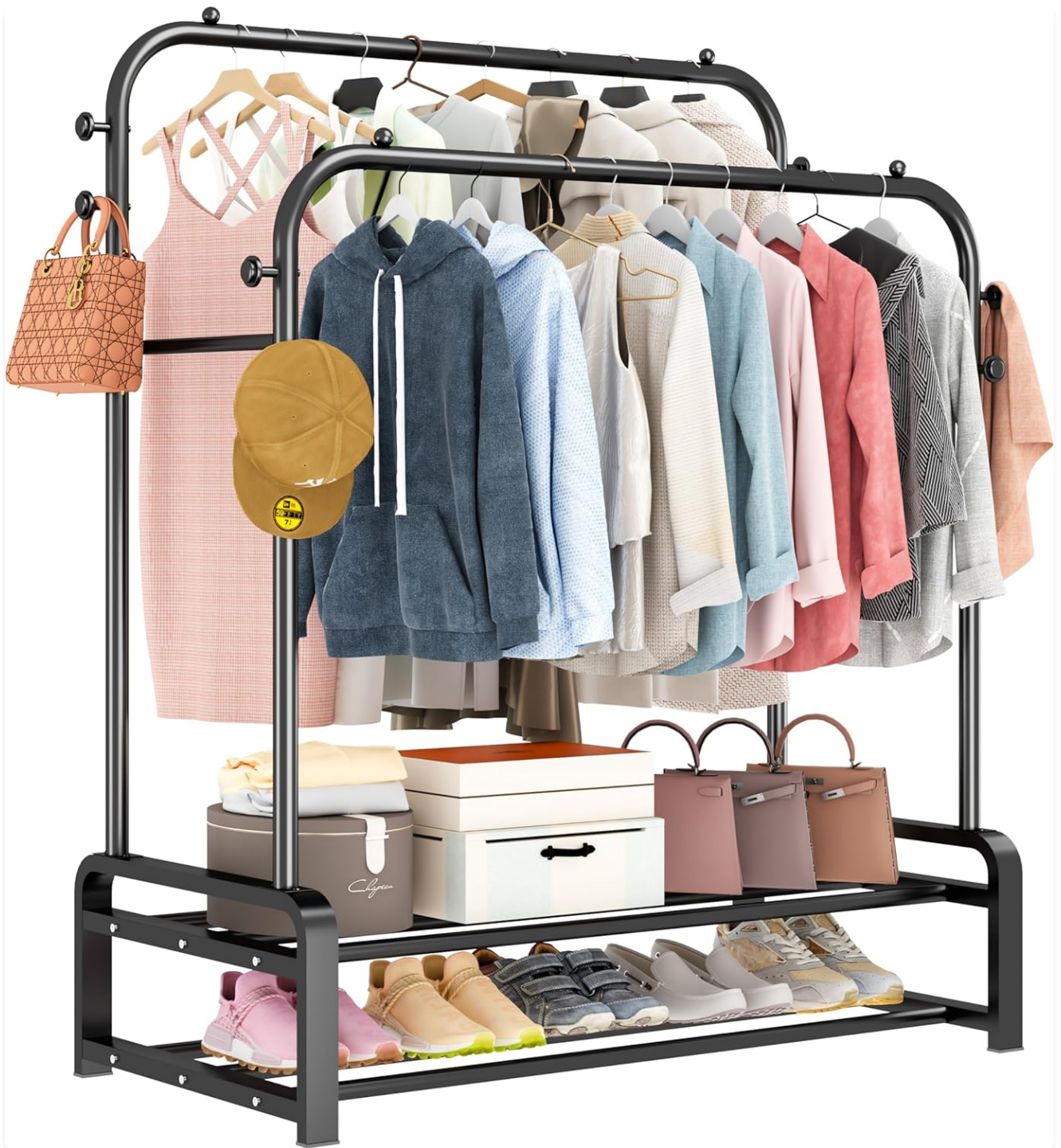
Image: The SMILOVII Freestanding Coat Rack, showcasing its double hanging rods, side hooks, and two shoe shelves, fully loaded with various garments, bags, and footwear.