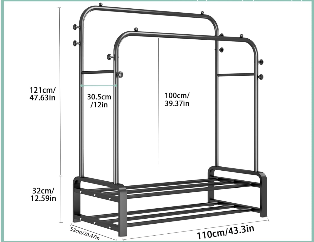
Image: A detailed diagram illustrating the overall dimensions of the coat rack, including height, width, and depth, along with specific measurements for hanging rods and shelf heights.

Produktgröße: 110cm ( L ) x 52cm ( W ) x 153cm ( H ) 43.3 in ( L ) x 20.47 in ( W ) x 60.23 in ( H )