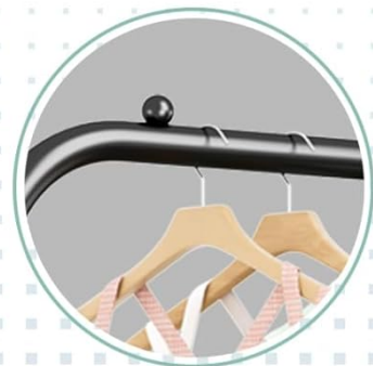
Image: A close-up illustration highlighting the key features: double hanging rods, side hooks, shoe shelves, and the anti-slip beads on the top bar.

Zwei rutschfeste Perlen auf der Oberseite der Kleiderstange verhindern kann die Kleidung vor dem Herunterfallen.