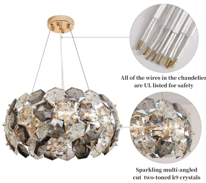
Close-up view highlighting the UL listed wires and the sparkling multi-angled K9 crystals.