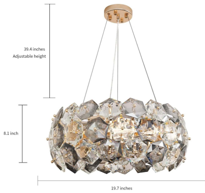
Detailed dimensions of the chandelier, including adjustable chain length.

showcasing its hexagonal crystal design and warm illumination.