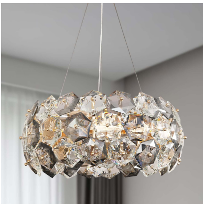
The GDLUOAO Crystal Chandelier,