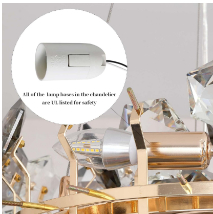
Detail of the UL listed lamp bases, ensuring electrical safety.