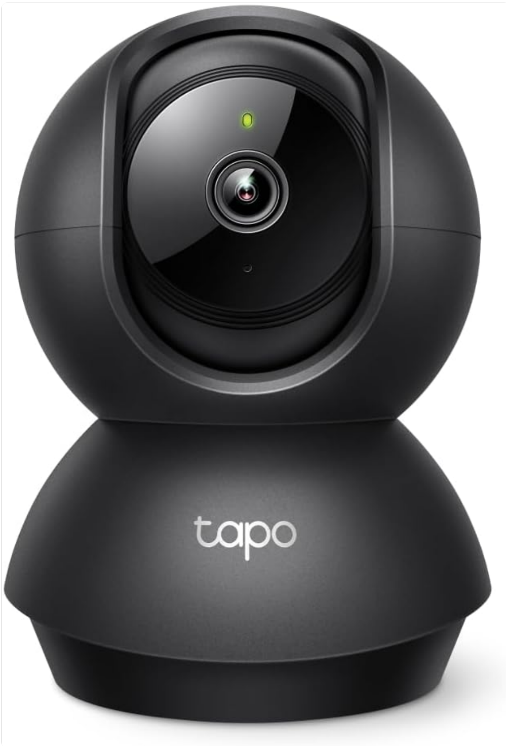
Image: The Tapo C211 Indoor Security Camera, a compact black dome-shaped camera with a rotating head and a wide base, designed for indoor surveillance.