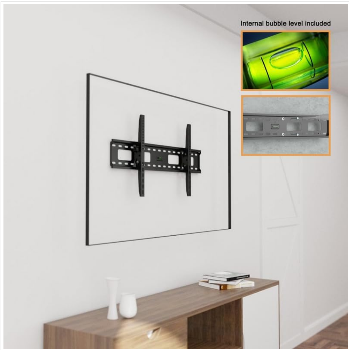
Image 4: The wall plate securely mounted to the wall, demonstrating the use of the integrated bubble level to ensure a perfectly horizontal installation.