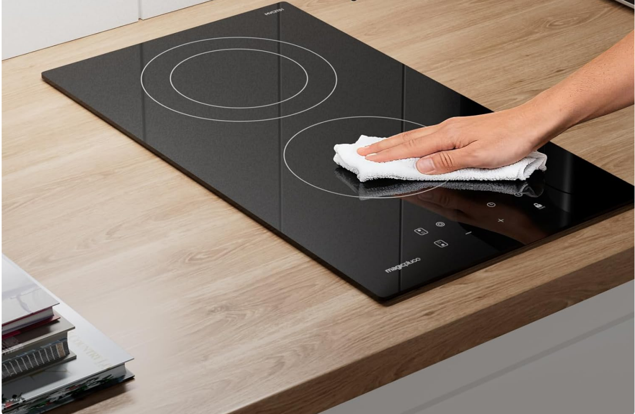
Image: A hand cleaning the ceramic hob surface, demonstrating its easy-to-clean and durable properties.