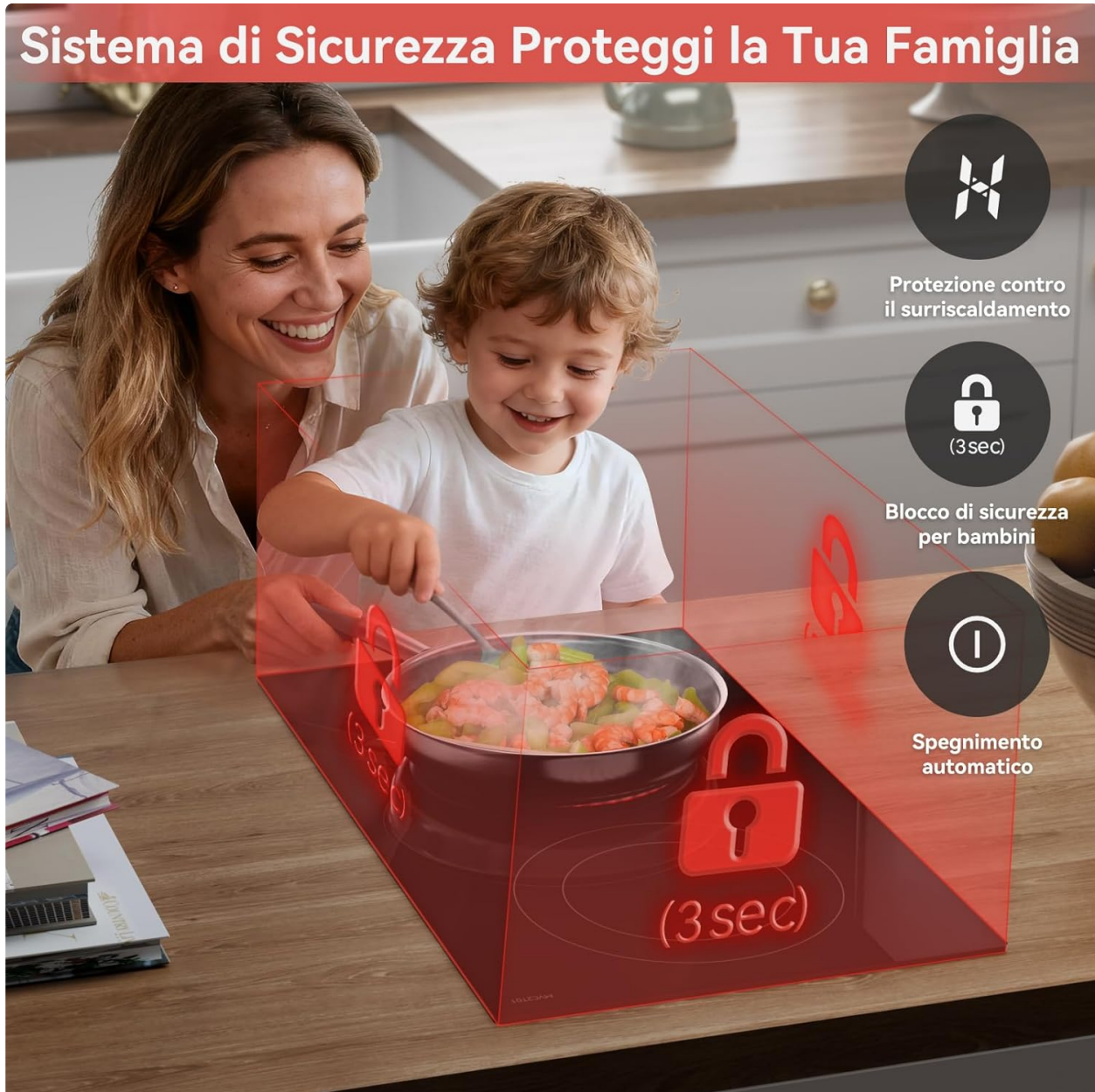
Image: A child safety lock feature is shown on the hob's control panel, emphasizing safety around children.