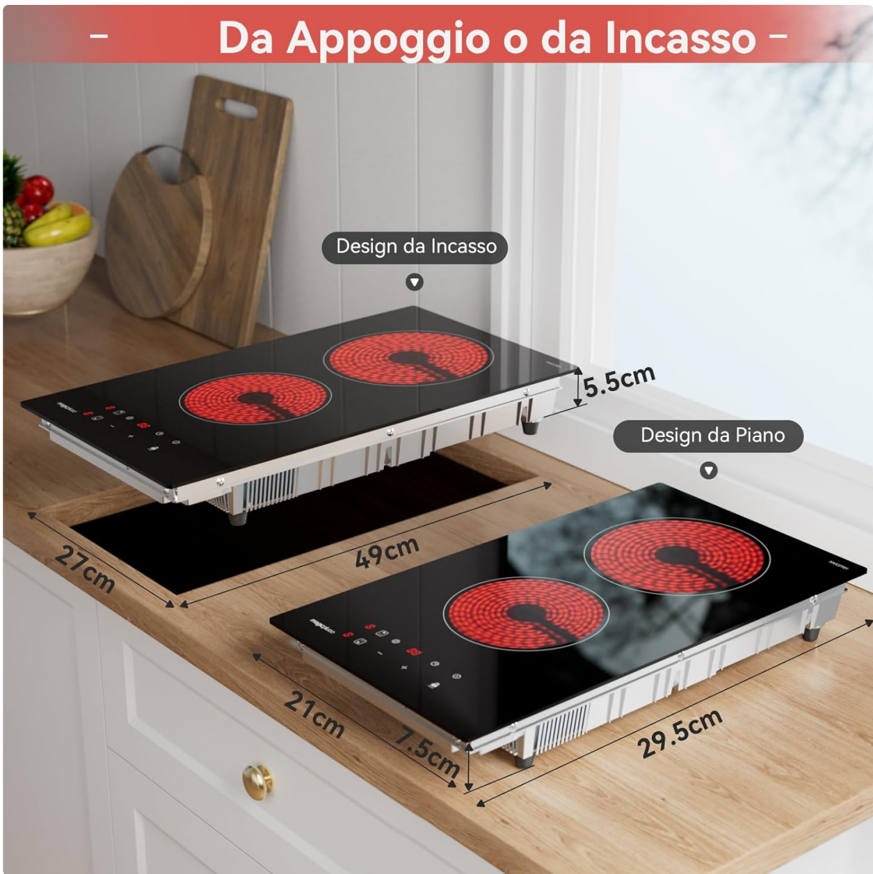
Image: The magicplux 2-Zone Ceramic Hob, showcasing its sleek black ceramic surface and two cooking zones.