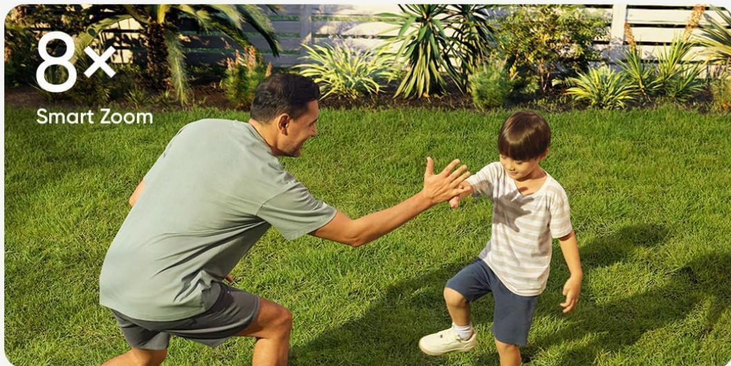
Image: Dual cameras provide multi-dimensional protection.