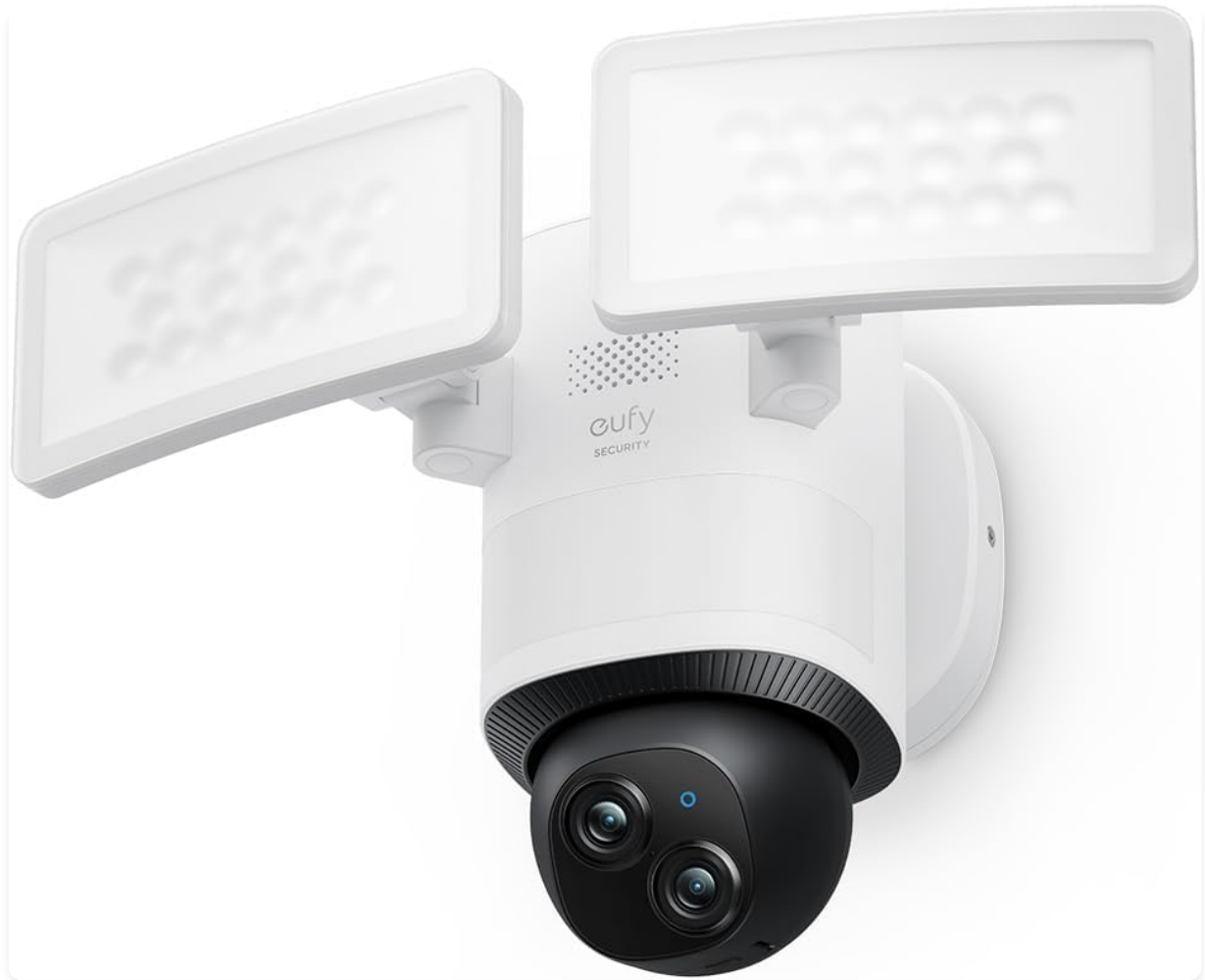
Image: eufy Security Floodlight Camera E340.