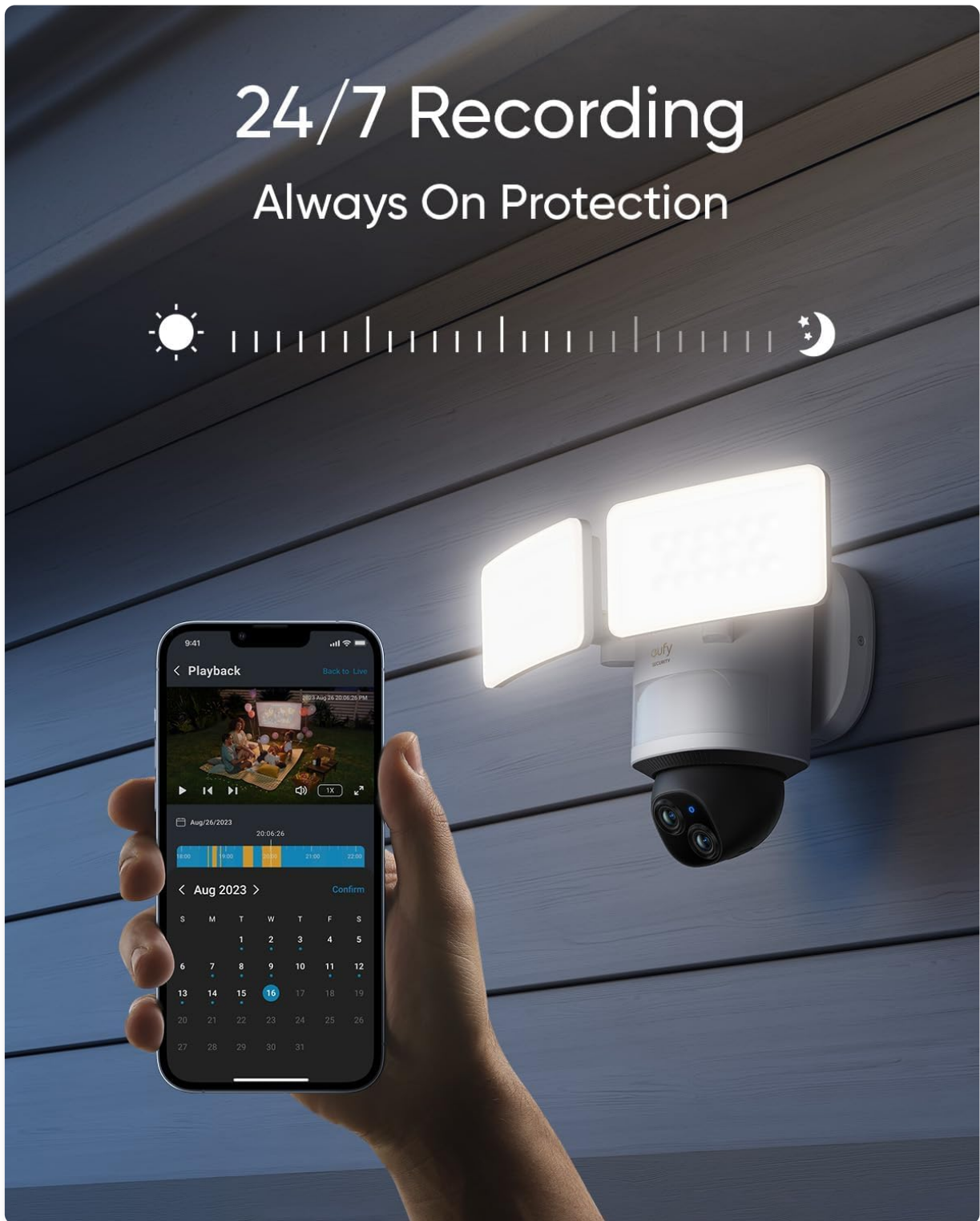
Image: 24/7 recording provides always-on protection.