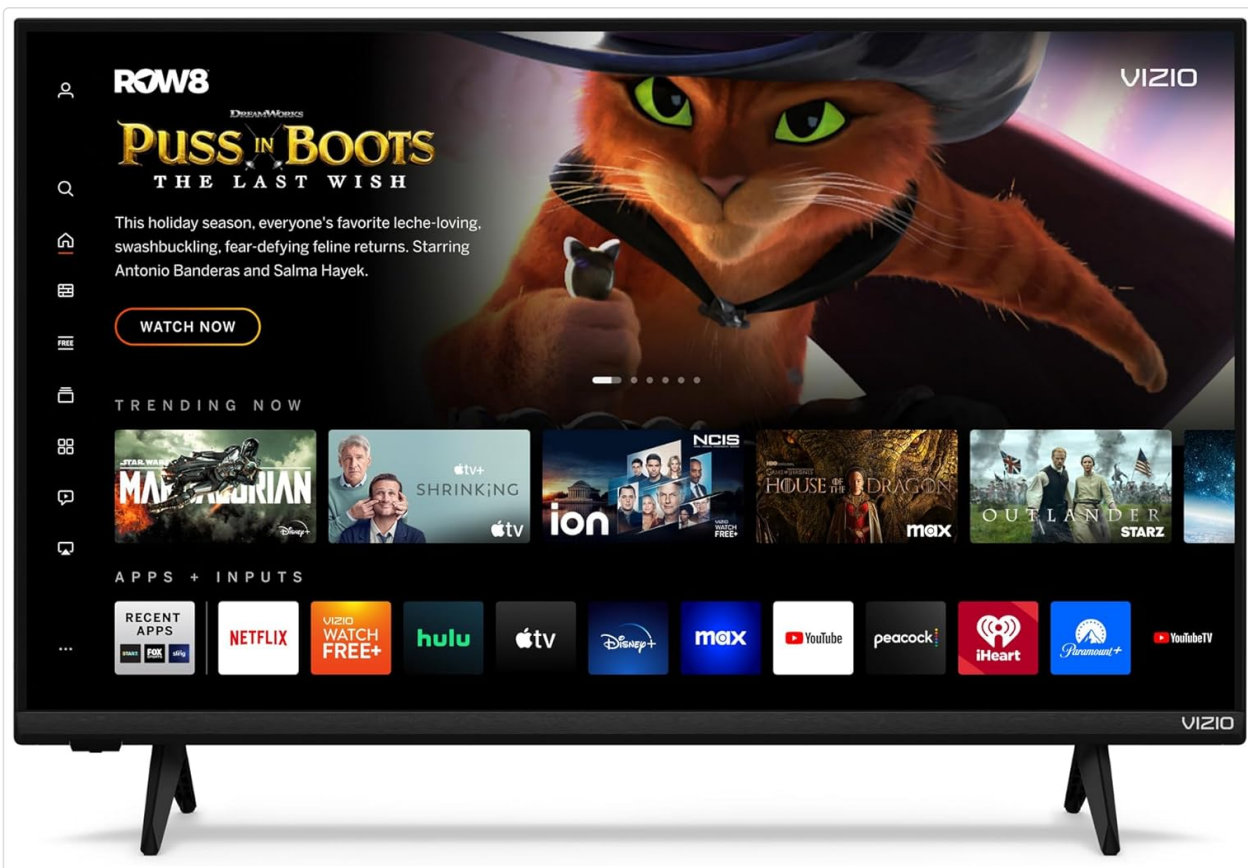
The VIZIO 32-inch D-Series Smart TV, showcasing its sleek design and included accessories.