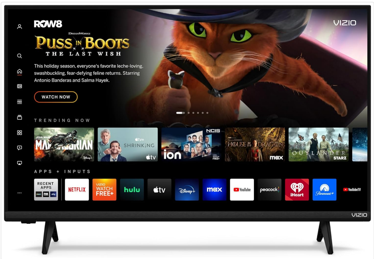
The VIZIO SmartCast interface, offering a user-friendly layout for accessing apps and content.

using your remote control to browse trending shows, live TV, free movies, and various apps.