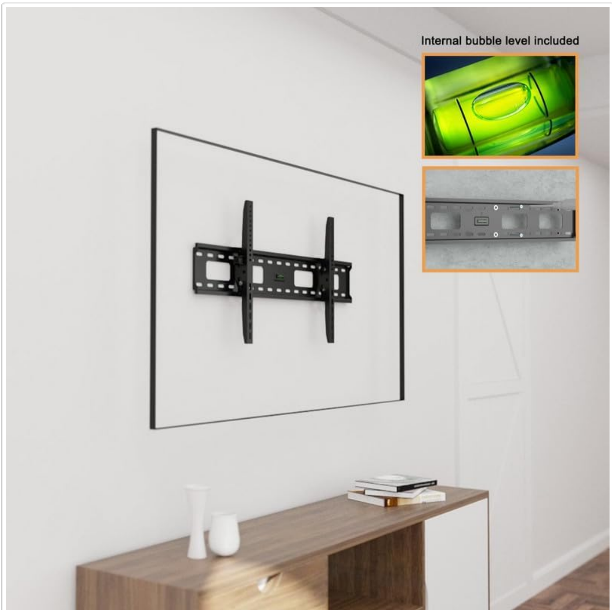
Image: The wall plate of the TV mount securely attached to the wall, demonstrating the use of the integrated bubble level for accurate positioning.