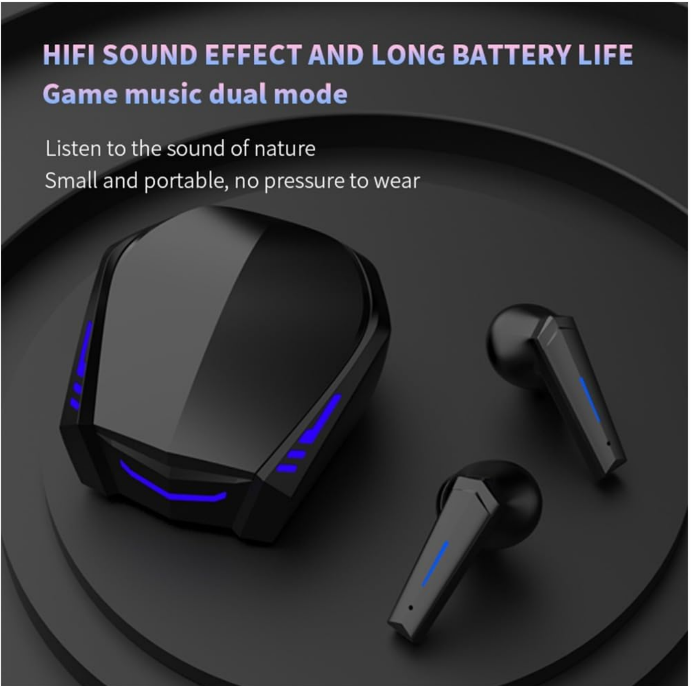
Image: The TWS F1 earbuds and their charging case, highlighting the HiFi sound effect and long battery life, along with the game and music dual mode.