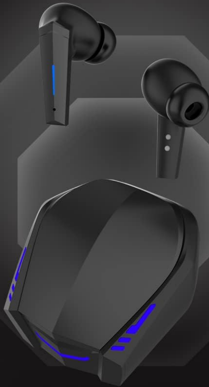
Image: The TWS F1 earbuds and charging case, emphasizing their design for gamers with Bluetooth 5.0 dual transmission, a 15-meter

Bluetooth 5.0 dual transmission, 15 meters uninterrupted link, strong anti-interference In game mode, the signal is more concentrated and stronger