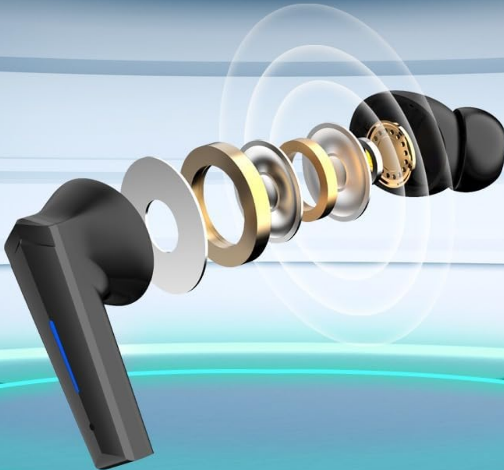
Image: An exploded diagram of the TWS F1 earbud, showcasing its 10mm high-resolution large moving coil with a Graphene composite diaphragm, responsible for its high-fidelity sound quality.

HIFI sound quality, listen to the sounds of nature