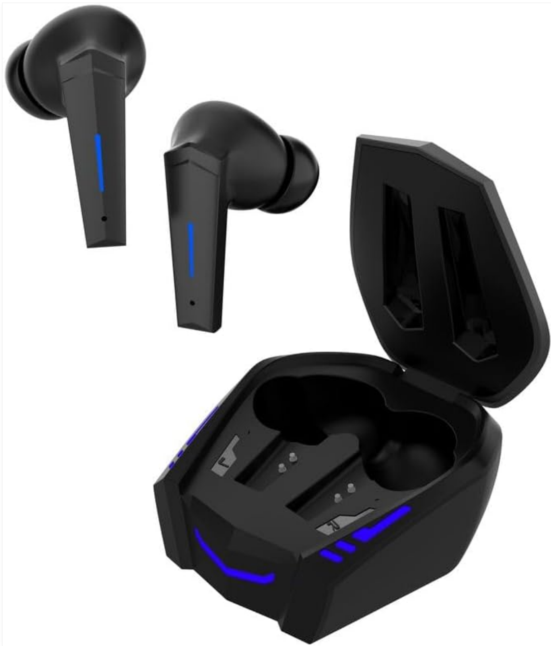
Image: The TWS F1 Gaming Earbuds placed inside their open charging case, ready for charging or pairing.