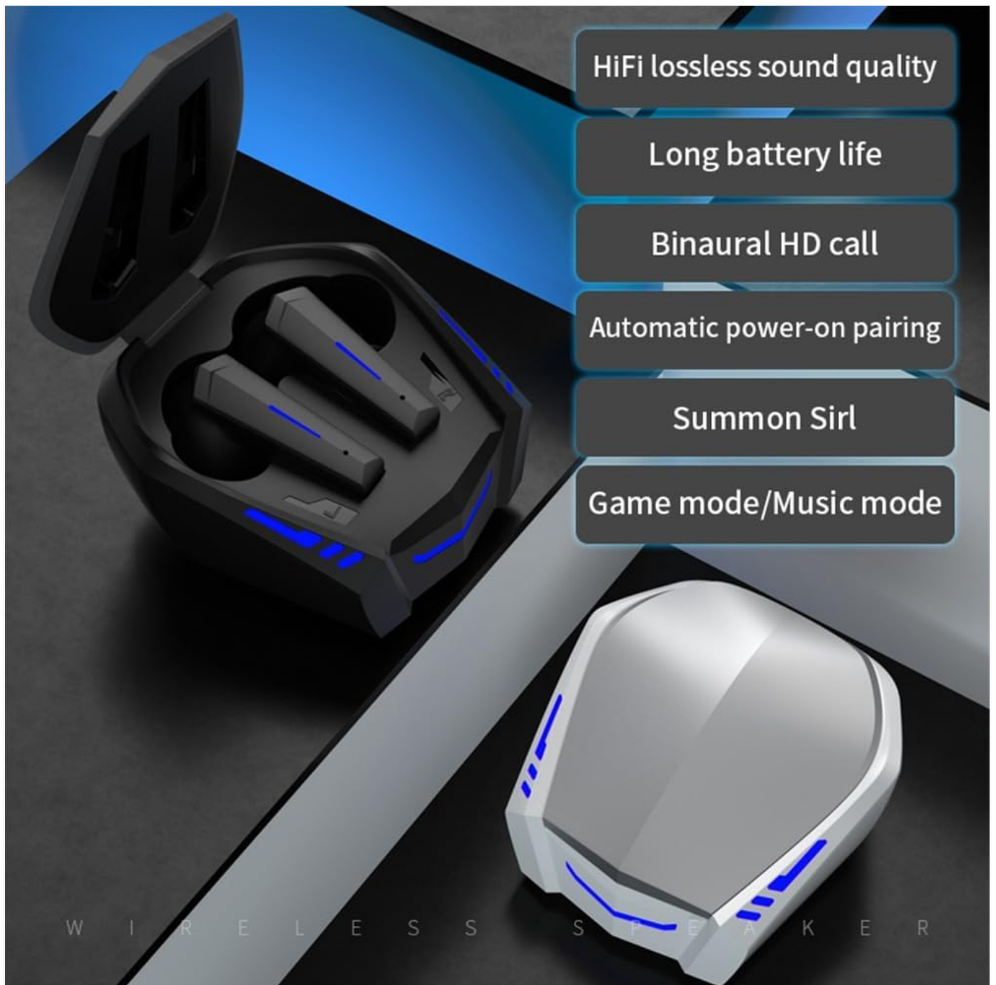
Image: A detailed view of the TWS F1 earbuds in their charging case, illustrating key features such as HiFi lossless sound, long battery life, HD calls, automatic pairing, Siri support, and dual game/music modes.