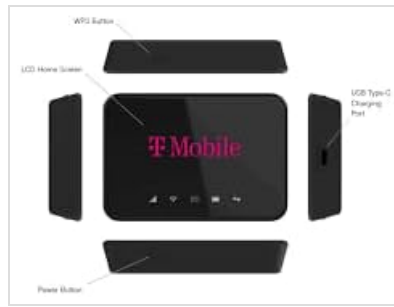
Image: Front view of the T-Mobile TMOHS1 Hotspot with labels indicating the WPS button, LCD Home Screen, USB Type-C Charging Port, and Power Button.