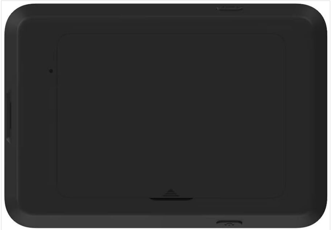
Image: Rear view of the T-Mobile TMOHS1 Hotspot's removable battery cover.