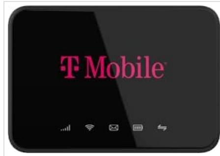
Image: Front view of the T-Mobile TMOHS1 Hotspot's display, showing active status indicators.