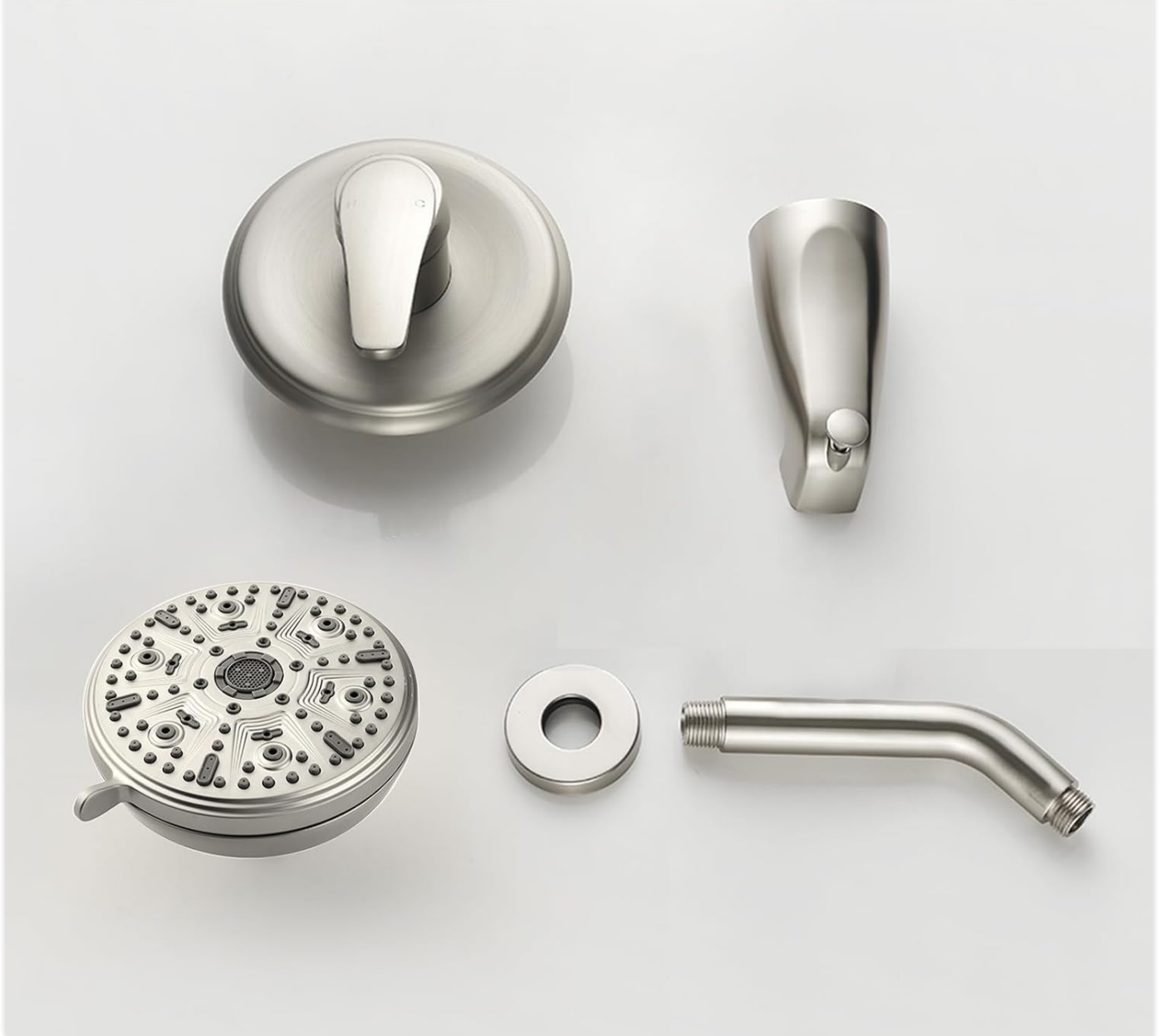
Figure 2: All components included in the product packaging.