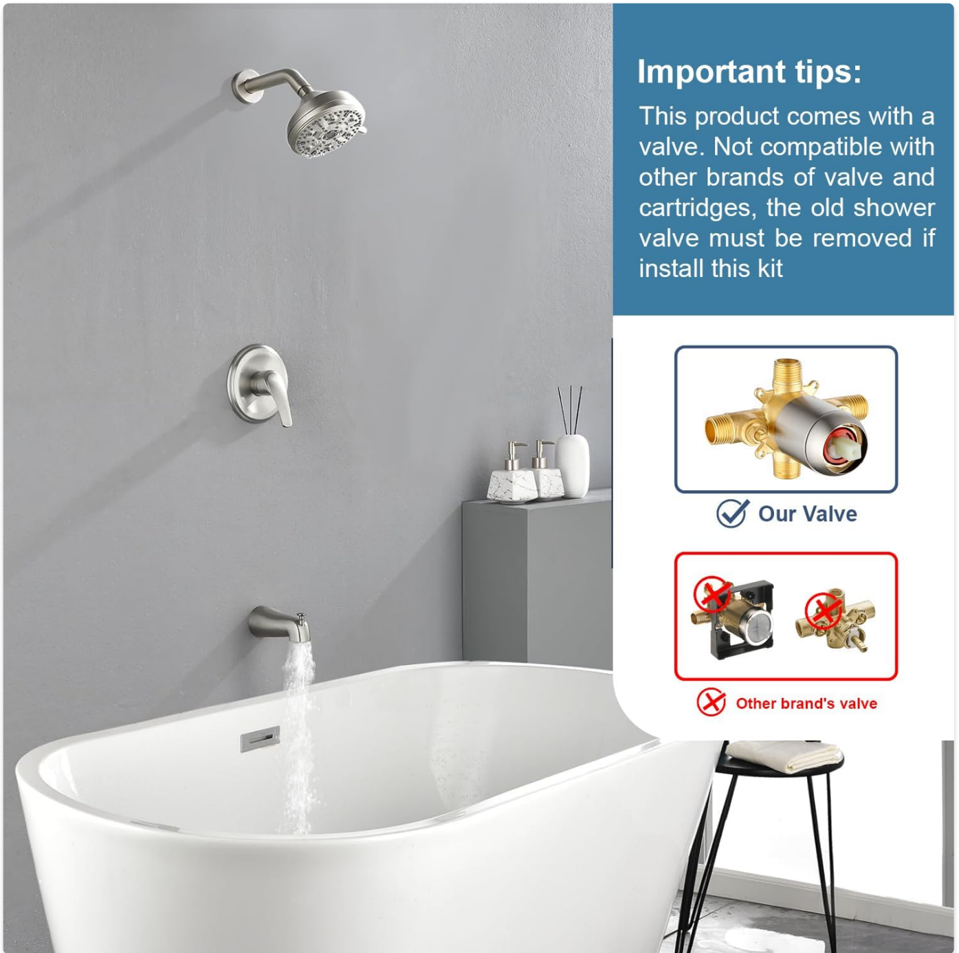
Figure 1: Important tips regarding valve compatibility. This product's valve is not compatible with other brands; remove old valves if present.