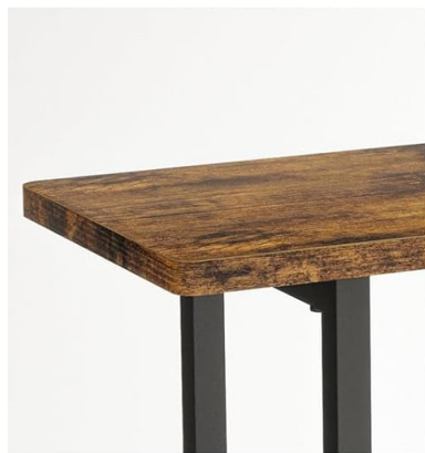
Premium MDF Board