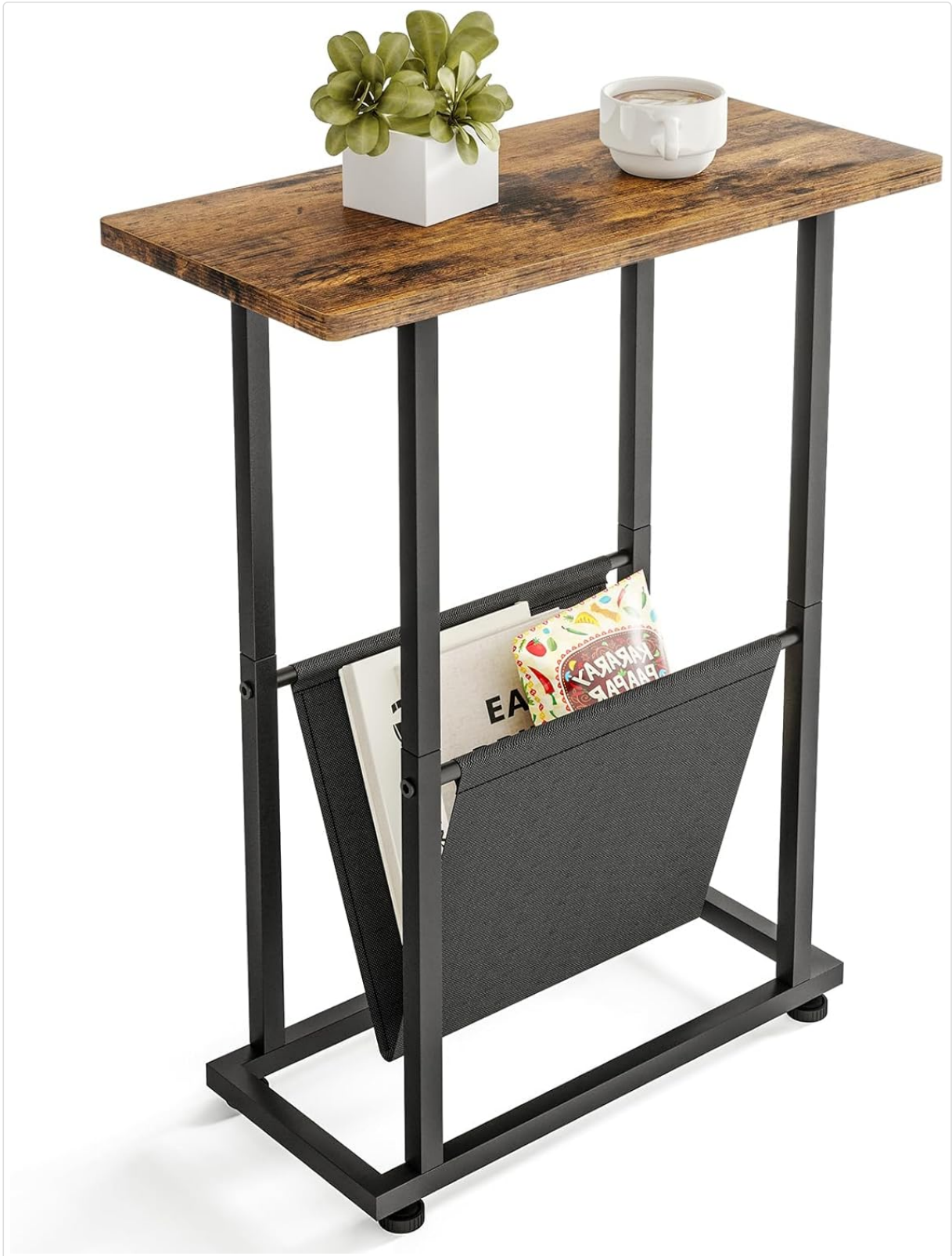
Image: Overview of the assembled Fixwal Narrow Side Table, showcasing its rustic brown tabletop, black metal frame, and fabric storage sling.