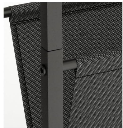
Non Slip Nut

Image: The side table used in a living room, displaying its capacity to hold various items on its surface and within its fabric storage compartment.