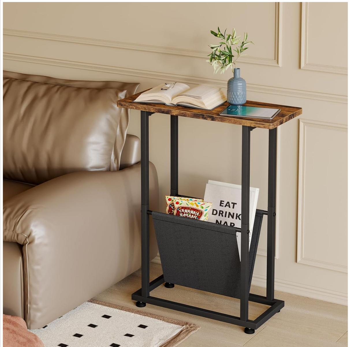
Image: The side table positioned beside a light-colored sofa, demonstrating its use as a convenient surface for personal items and a storage solution for reading materials.