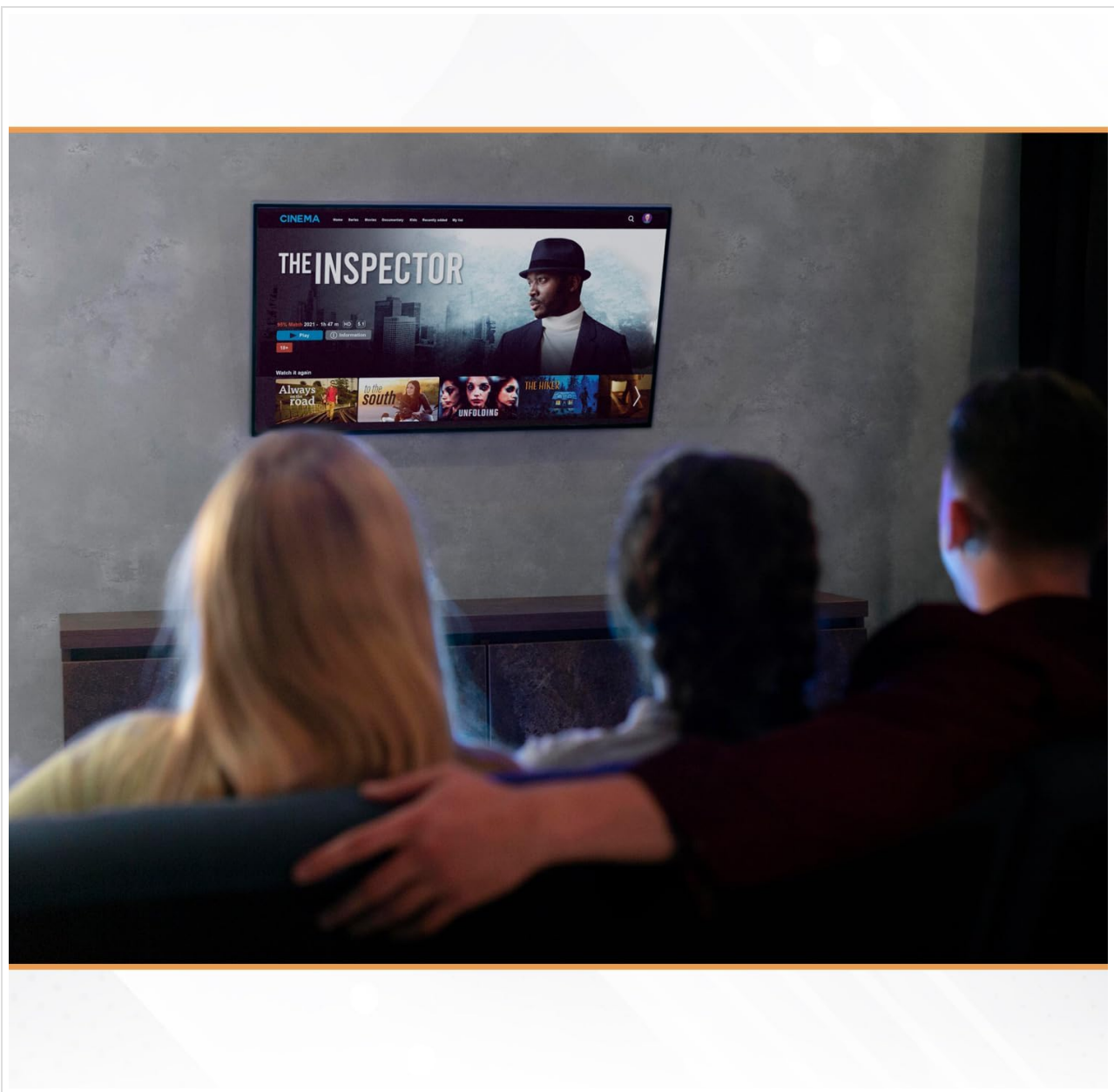
Image: A family watching television, demonstrating how the tilt feature of the wall mount can enhance viewing comfort from various seating positions.