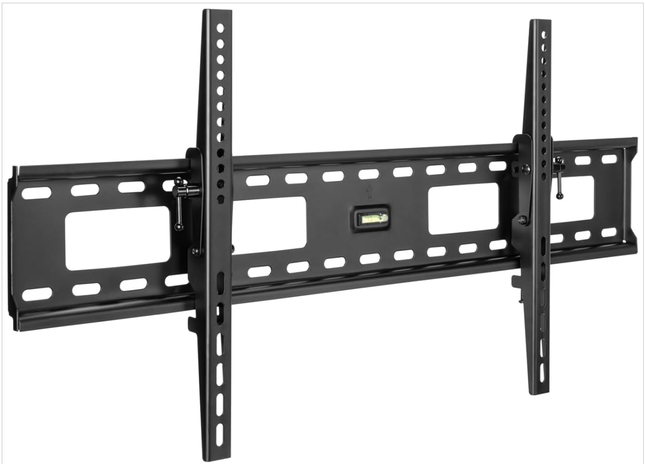
Image: The main components of the TV wall mount, including the wall plate and TV brackets.