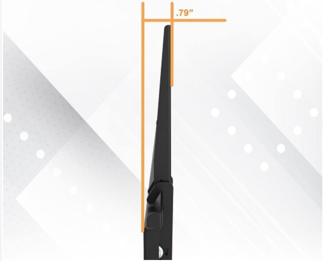
Image: A side profile view illustrating the ultra-slim design of the TV wall mount, showing how closely the TV sits to the wall.