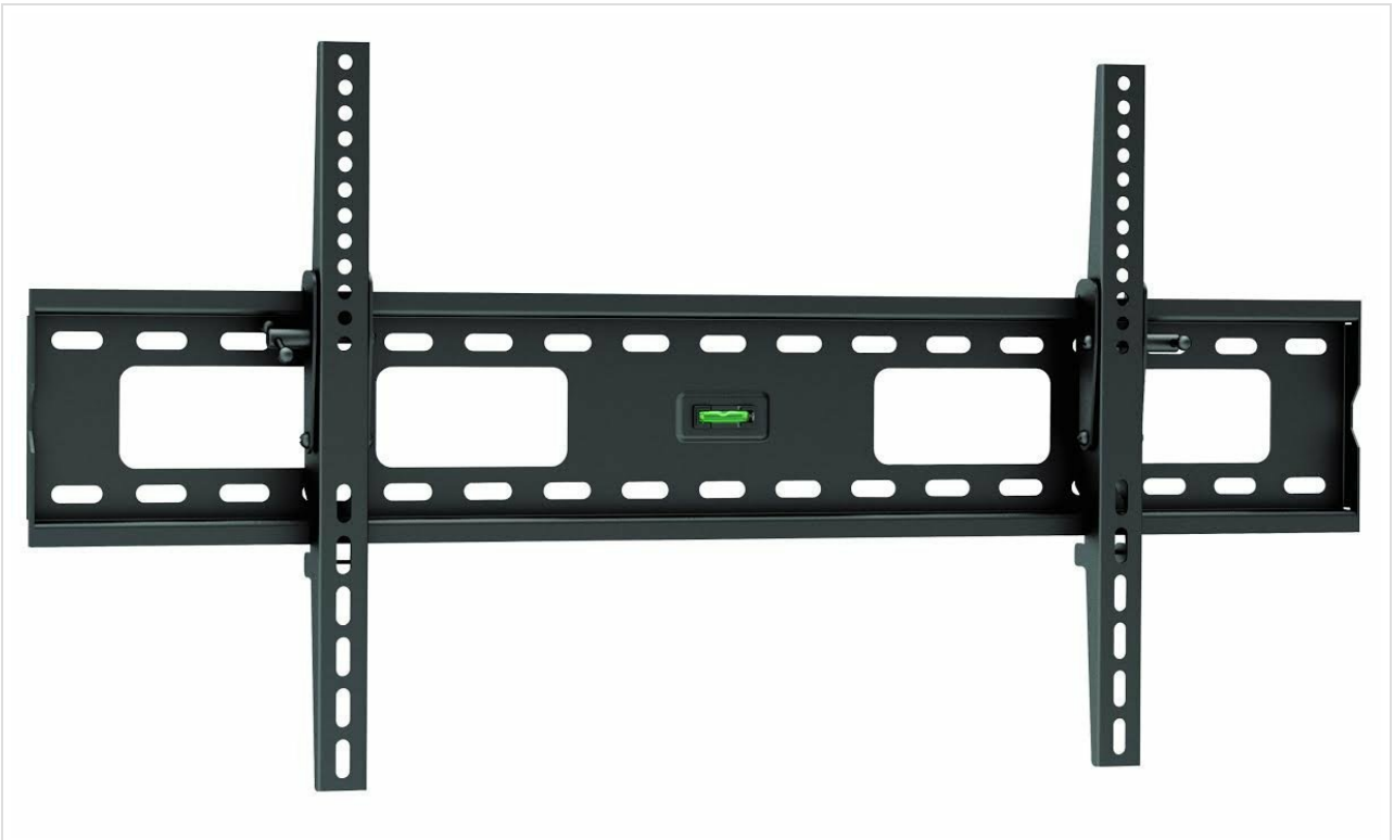
Image: The Stellar Mounts Ultra Slim Tilt TV Wall Mount, showcasing its sleek design and robust construction.

This manual provides detailed instructions for the installation, operation, and maintenance of your Stellar Mounts Ultra Slim Tilt TV Wall Mount, designed specifically for the 43R4A5R 43" Class Select Series 4K Smart RokuTV. This premium, heavy-duty wall mount offers a low-profile design, tilt adjustment, and horizontal adjustment for optimal viewing angles and reduced glare.