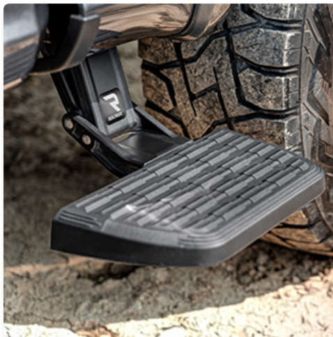
Image: Close-up view of the Bedstep 2 installed on a truck, positioned near the rear tire for easy access to the bed.