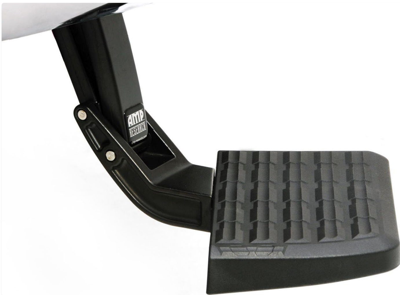
Image: The AMP Research Bedstep 2 in its deployed position, showing the textured non-slip surface.

The AMP Research Bedstep 2 is a strong, rugged, non-slip, and retractable bumper step designed to provide easier and safer access to your pickup truck's cargo area. It quickly flips down with a foot nudge and supports up to 300 lbs. This innovative step mounts under the rear bumper, allowing full functionality even with an open tailgate or when towing. It is proudly manufactured in the USA using global materials.