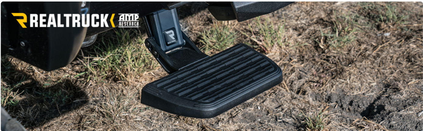
Image: The Bedstep 2 shown in its deployed state, highlighting the AMP Research branding.

The self-lubricating bushings ensure smooth operation in various weather conditions.