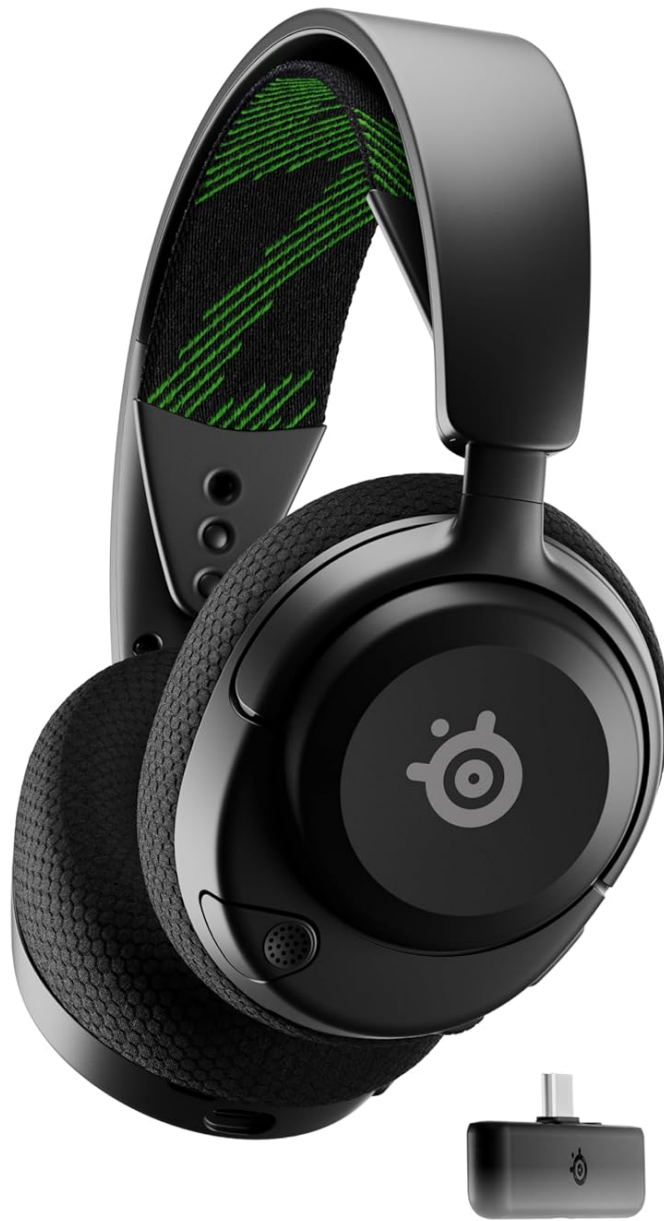
Image: The SteelSeries Arctis Nova 4X Wireless Gaming Headset with its USB-C dongle.