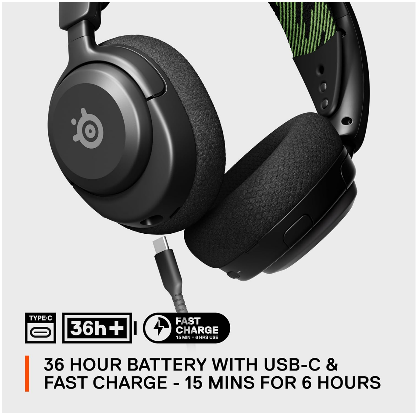
Image: Close-up of the headset showing the USB-C charging port and indicating 36+ hours of battery life with fast charge capability.