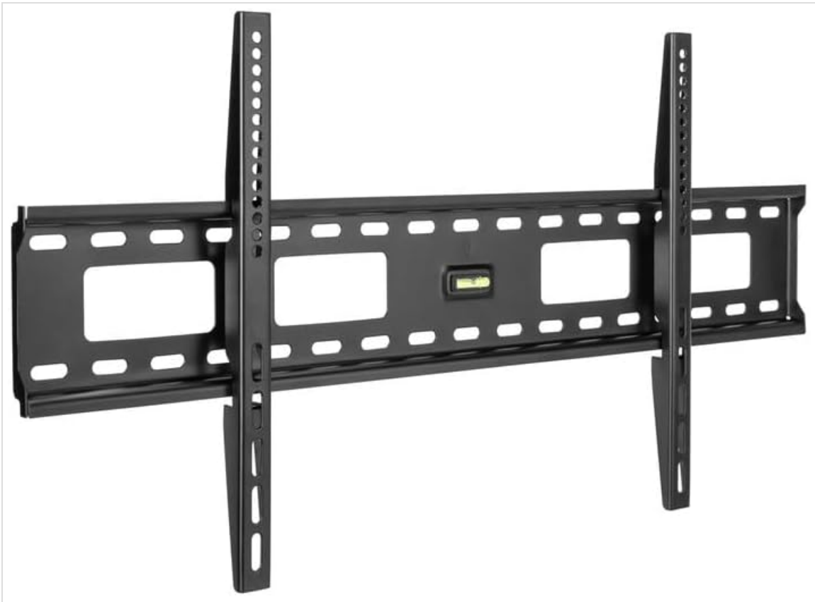
Image: Displays the main components of the Stellar Mounts Ultra Slim Flat TV Wall Mount, including the wall plate and TV brackets.

For a visual guide, please refer to the official installation video: