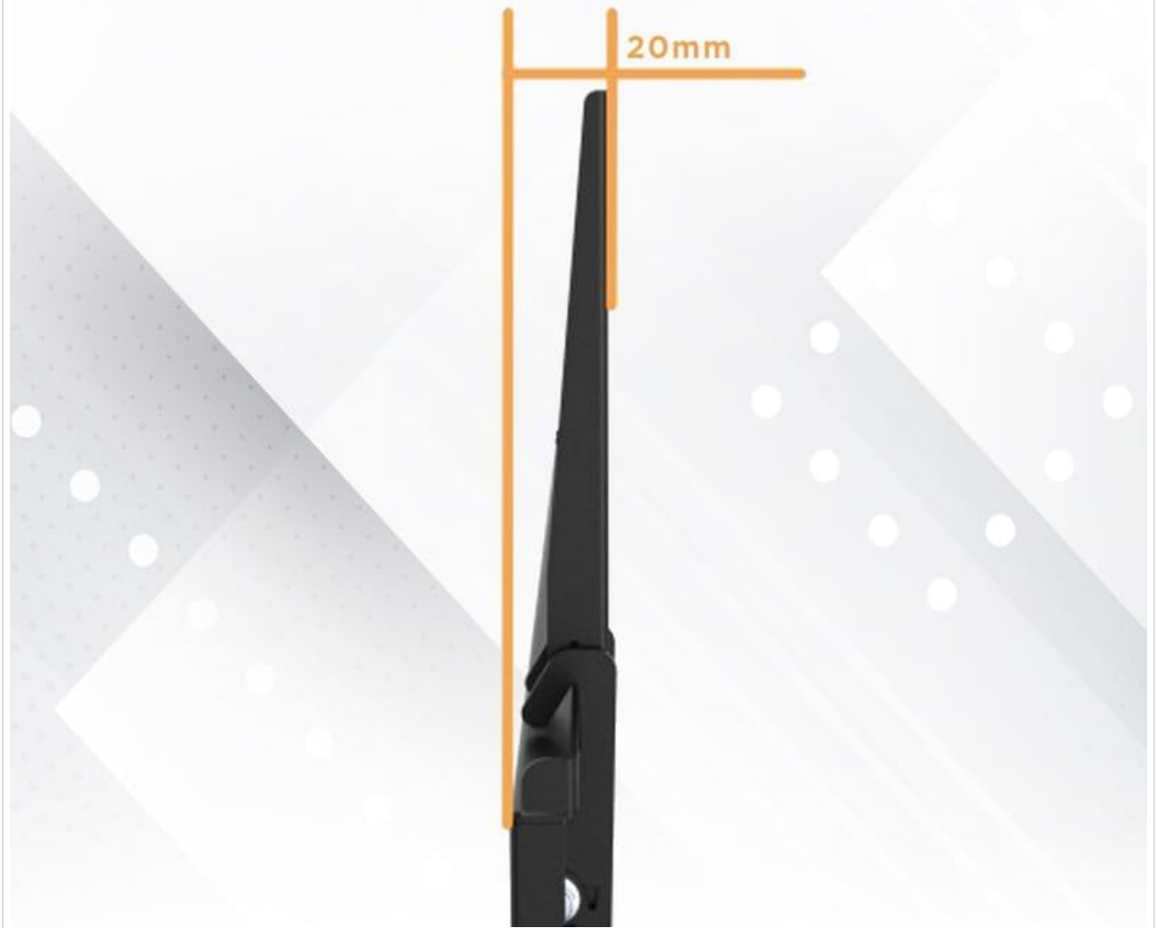
Image: Illustrates the ultra-slim design, showing the TV mounted with a minimal 20mm (approximately 0.8 inches) gap from the wall, contributing to a seamless aesthetic.