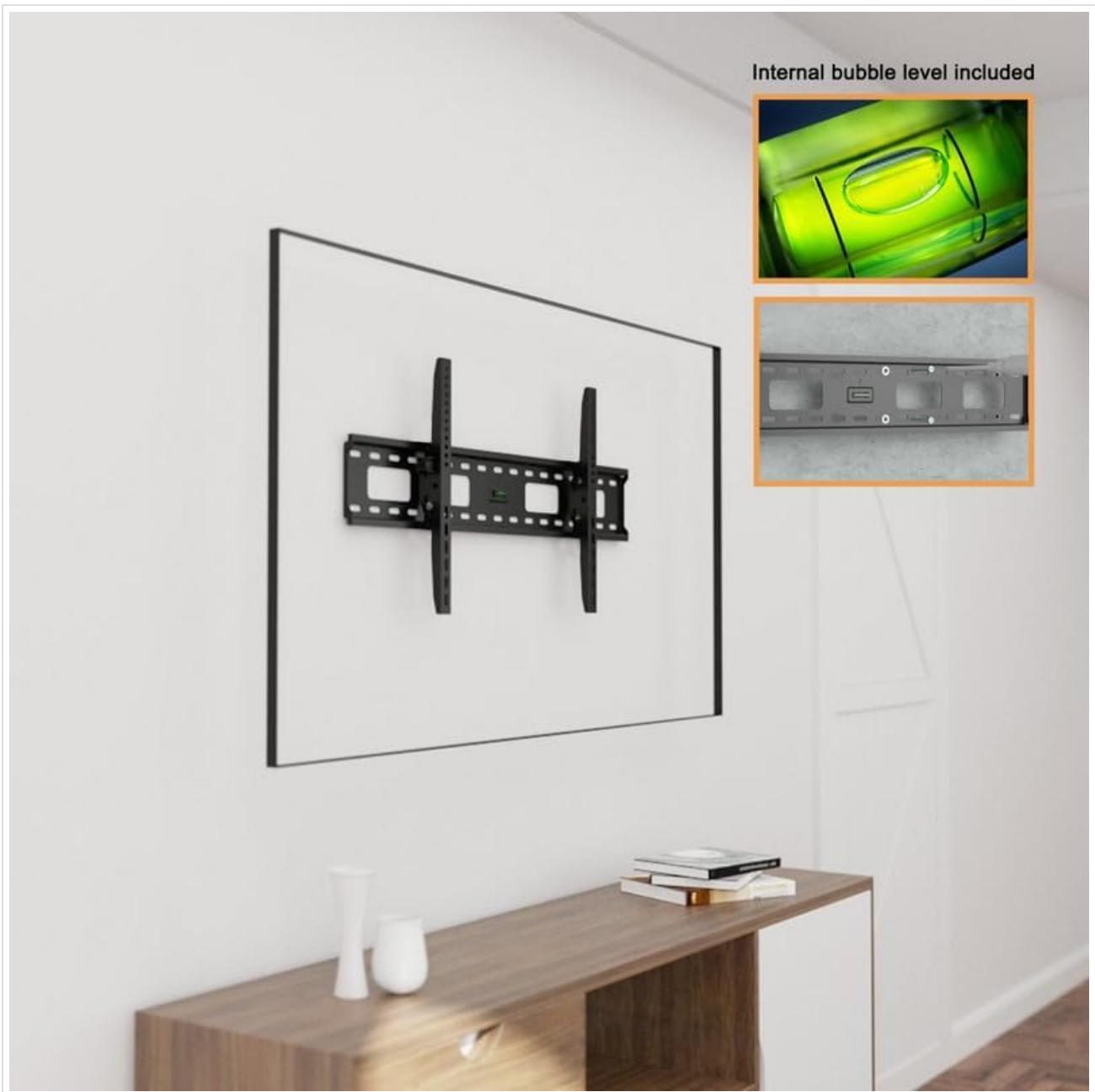
Image: Shows the wall plate with an integrated bubble level, aiding in precise horizontal alignment during installation.