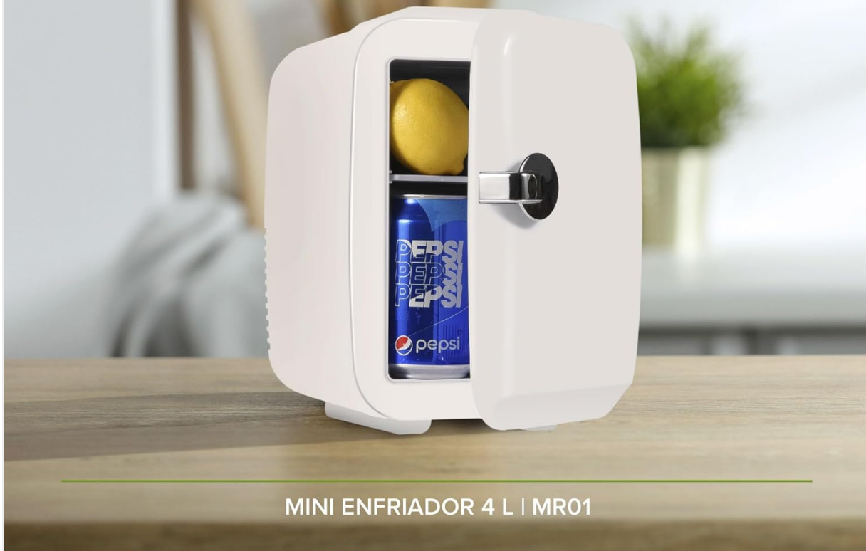
MINI ENFRIADOR 4 L | MR01

¡El mini refri que todos quieren lo tenemos nosotros!