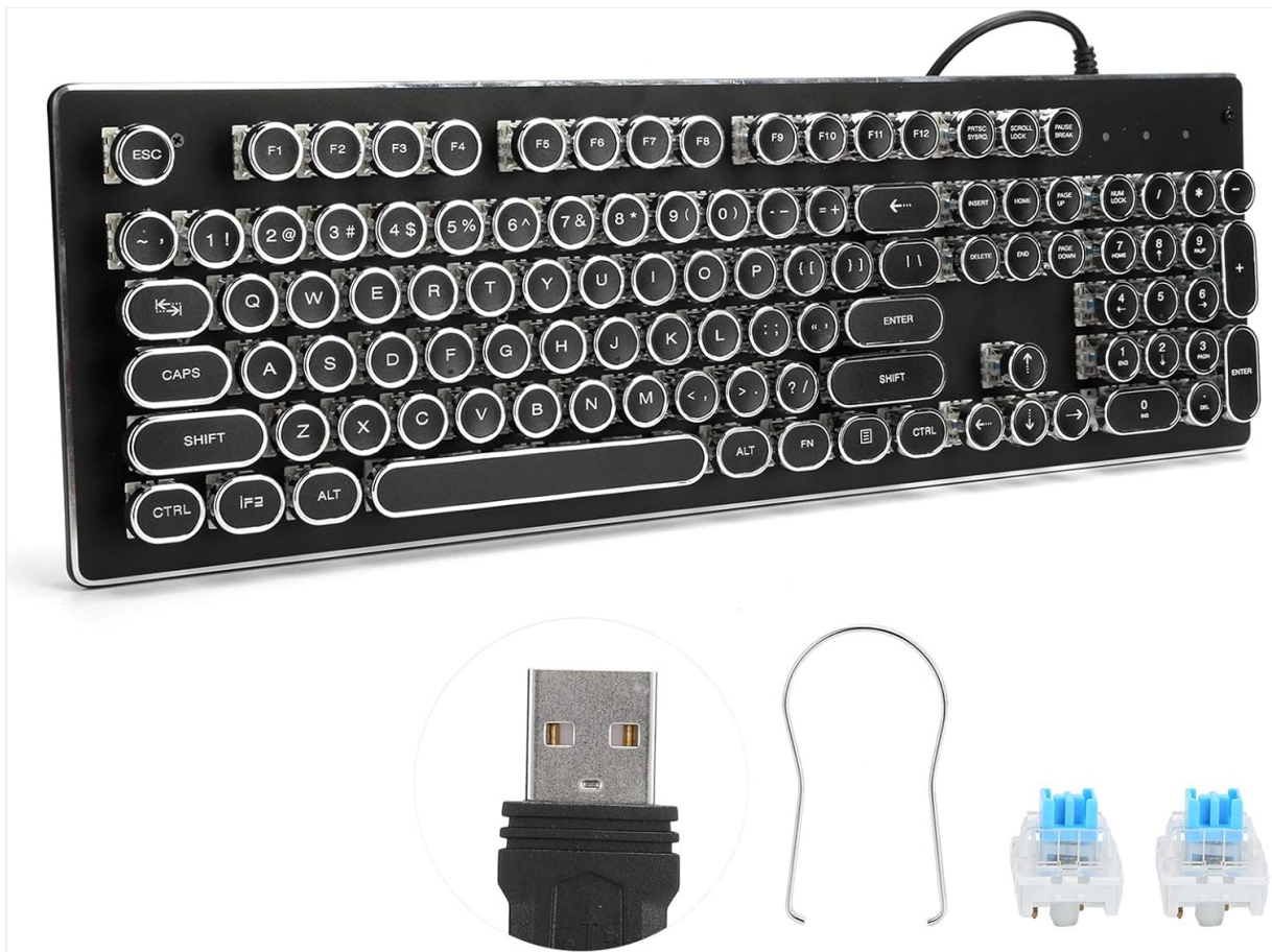
Image: The keyboard's USB connector is shown alongside the keycap puller and spare switches, illustrating the connection method and included accessories.