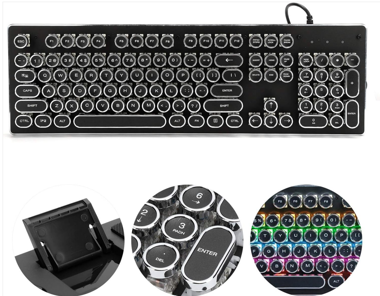
Image: This image highlights various features including the adjustable feet for ergonomic positioning, the design of the keycaps, and the vibrant RGB lighting, all contributing to the keyboard's overall user experience and maintenance considerations.