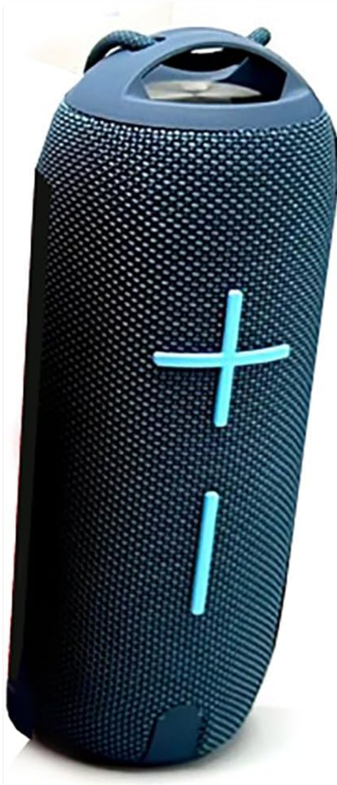
Image: A side view of the MOREKA Bluetooth Speaker, highlighting the input ports typically covered by a waterproof flap, such as USB and TF card slots.