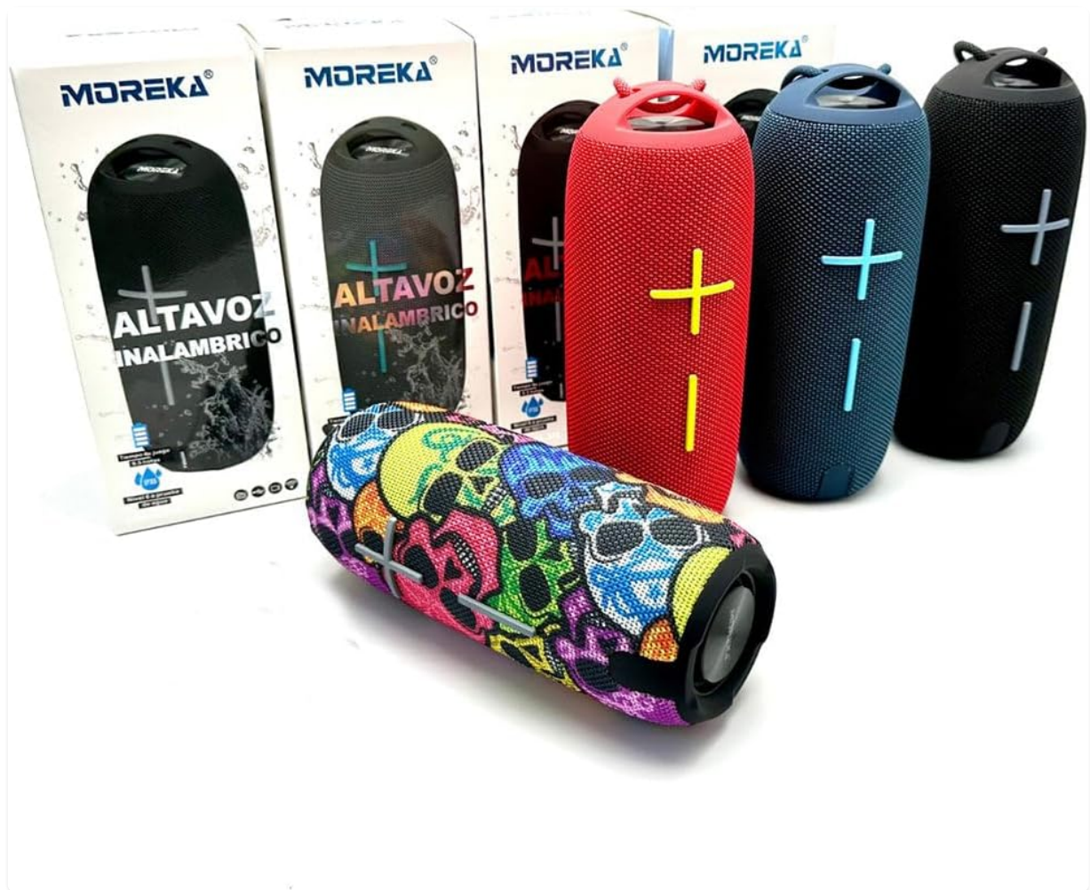
Image: The MOREKA Bluetooth Speaker Model 372 shown with its retail packaging, indicating the typical contents of the product box.