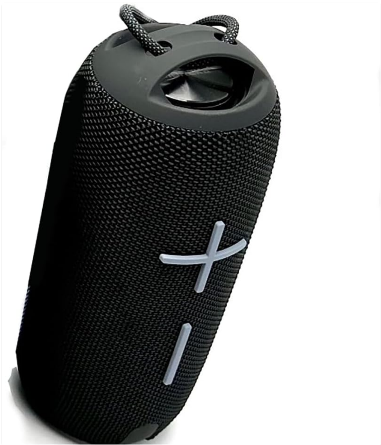
Image: A black MOREKA Bluetooth Speaker Model 372, showing its cylindrical shape and fabric mesh exterior.