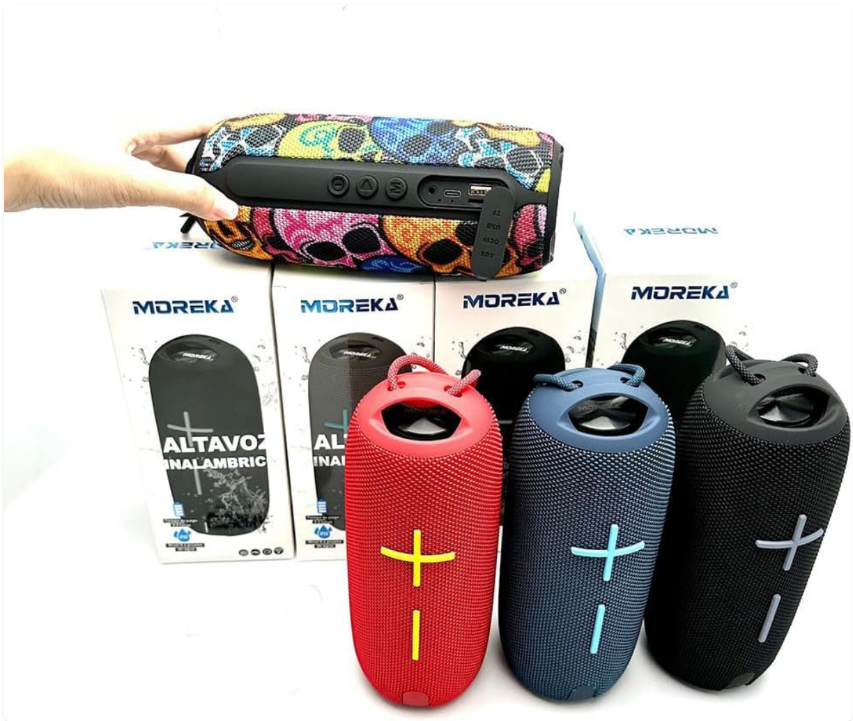
Image: A close-up of the top panel of the MOREKA Bluetooth Speaker, displaying the control buttons including power, play/pause, mode, and volume controls.