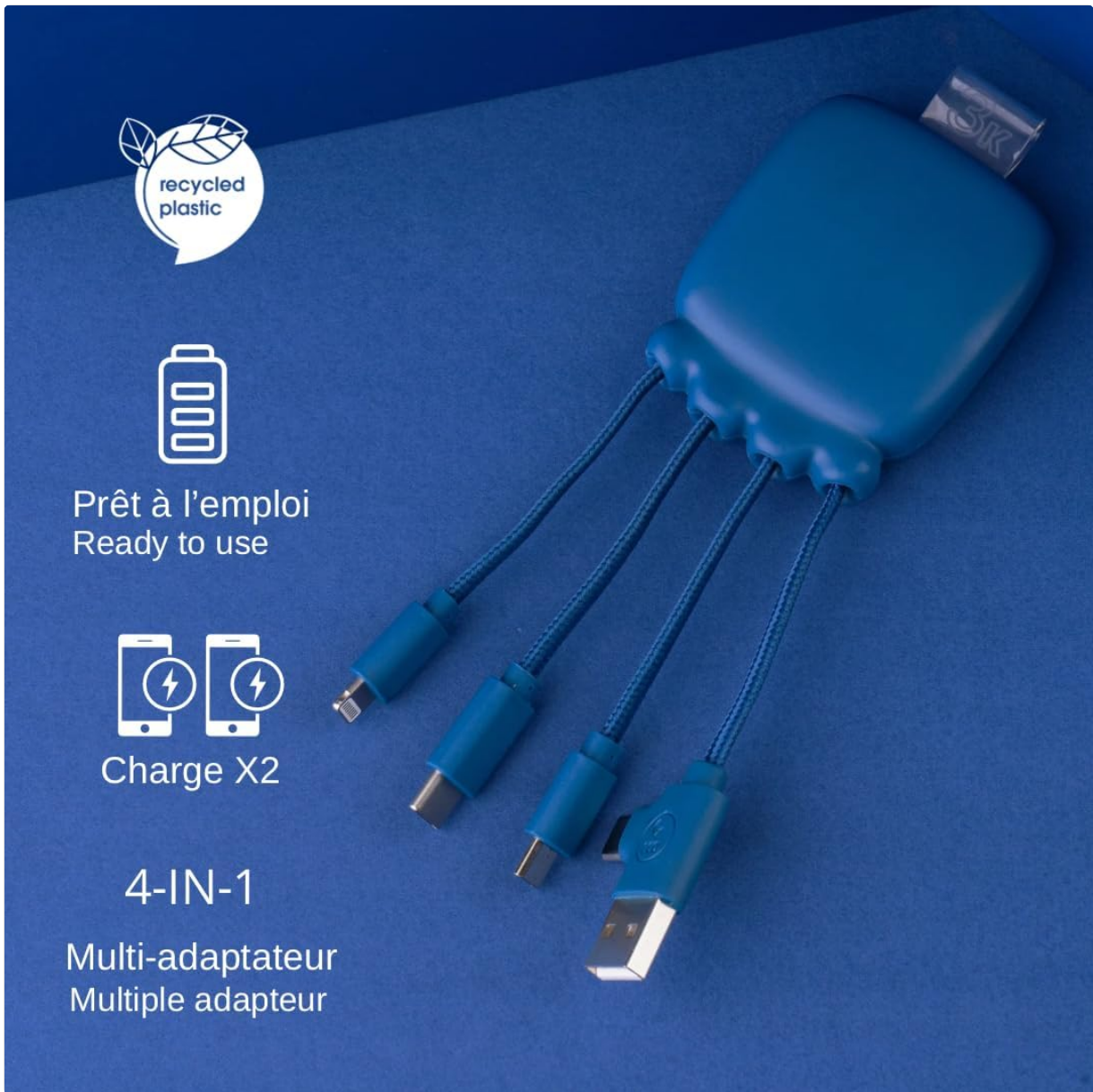
Image: The Xoopar Octopus Gamma XP61075 showing its various input and output connectors: Lightning, USB-C, Micro USB, and USB-A.