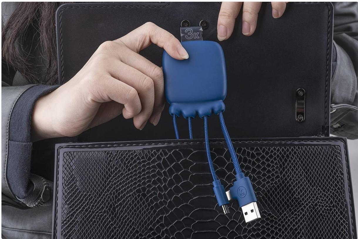
Image: The Xoopar Octopus Gamma XP61075 highlighting its construction from recycled plastic, 4-in-1 multi-adapter functionality, and ability to charge two devices simultaneously.