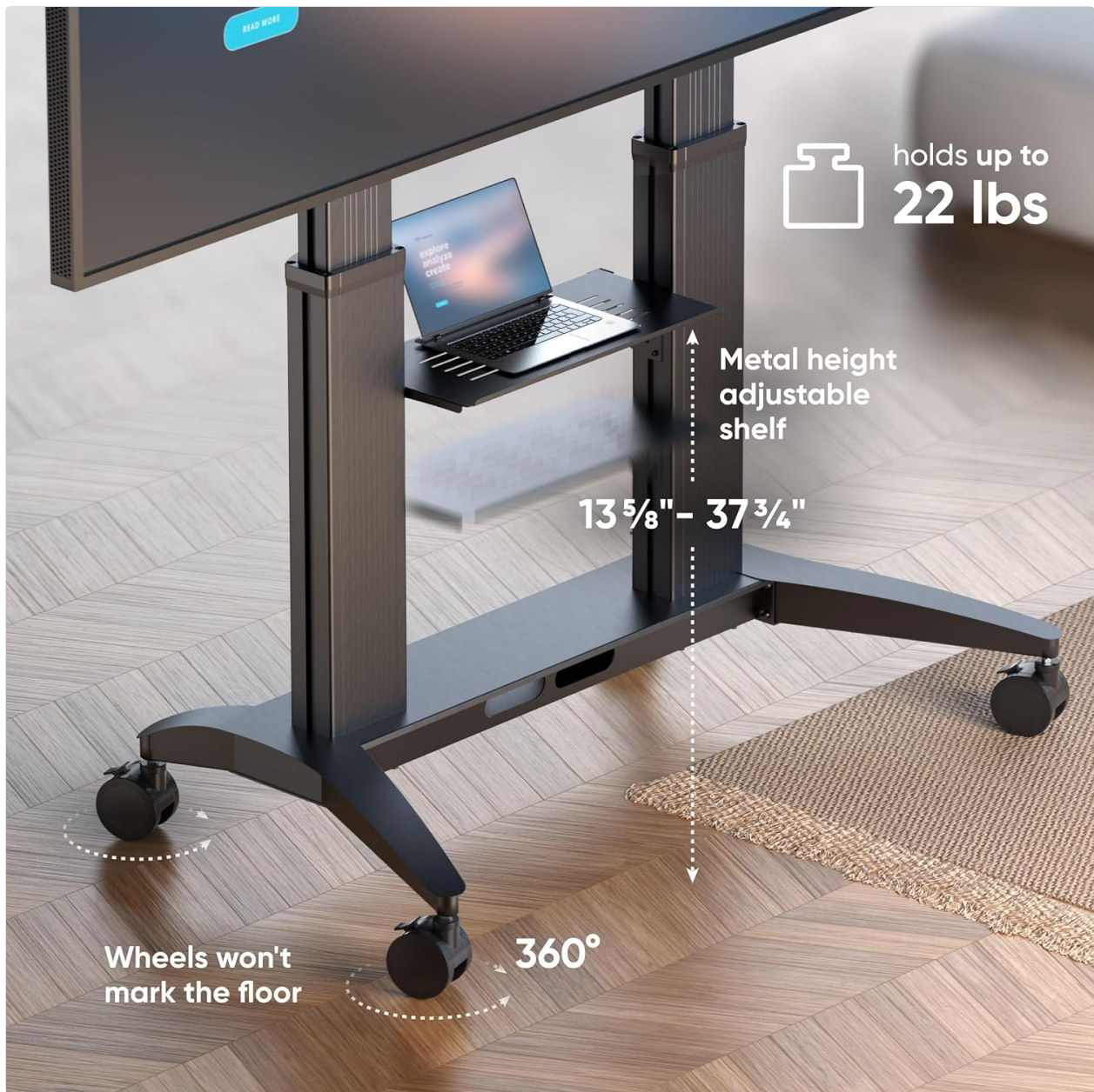
Image Description: This image focuses on the height-adjustable metal shelf of the TV stand, which is shown holding a laptop. An arrow indicates the shelf's adjustable range. Below the base, an arrow illustrates the 360-degree rotation capability of the wheels, emphasizing the stand's maneuverability.