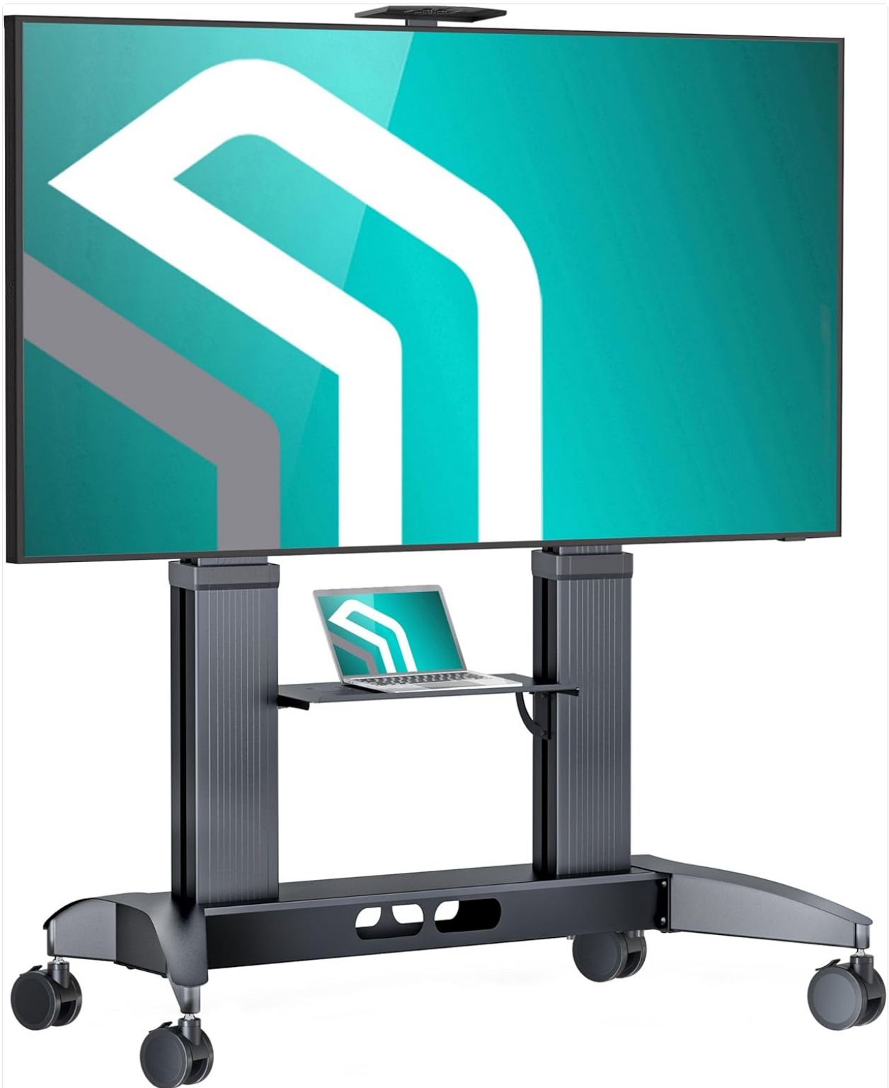
Image Description: This image shows the ONKRON Mobile TV Stand TS2821-B in a contemporary office setting. A large television is mounted on the stand, with a laptop placed on the adjustable lower shelf and a webcam positioned on the upper shelf. The stand is black and features wheels for mobility.