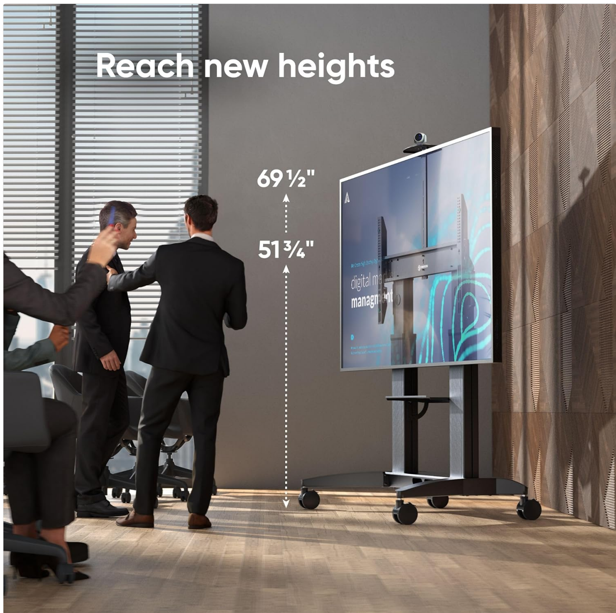
Image Description: This image shows two individuals standing near the ONKRON Mobile TV Stand, which has a large display mounted. Dotted lines and measurements indicate the adjustable height range of the TV from 51 3/4 inches to 69 1/2 inches, demonstrating the stand's flexibility for different viewing preferences.