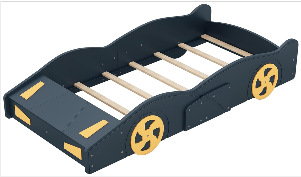
Figure 4.1: View of the bed frame structure with wooden slats installed, prior to mattress placement.