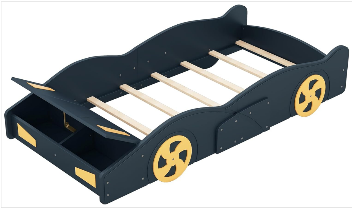
Figure 5.1: Front view of the race car bed, demonstrating the storage compartment in its open position.