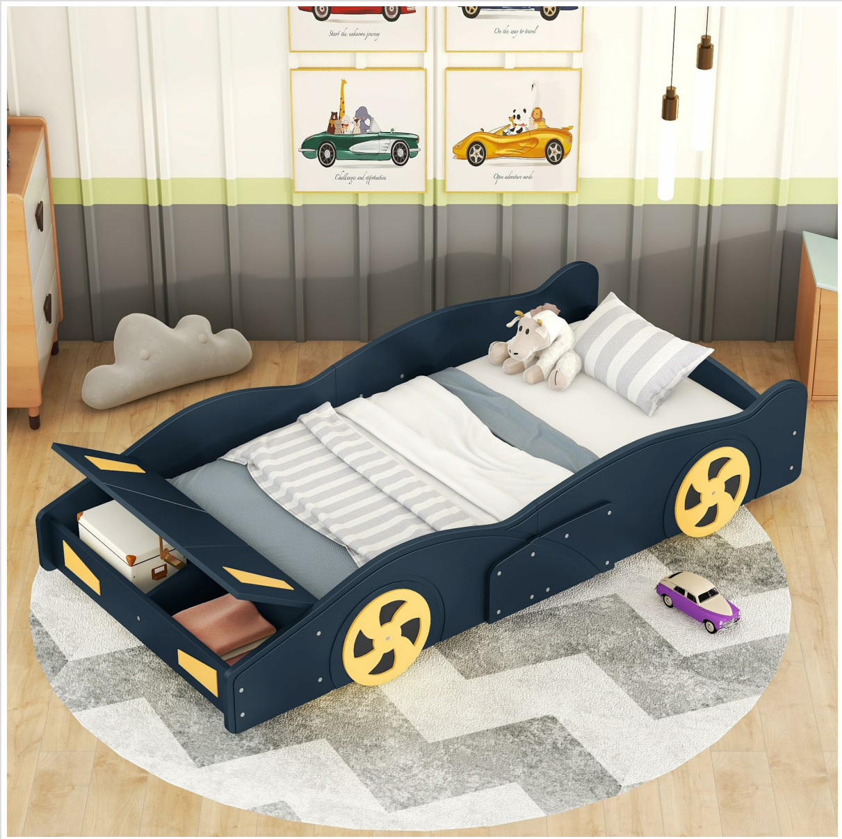
Figure 2.1: Overall view of the Bellemave Twin Size Race Car Bed in dark blue with yellow accents.