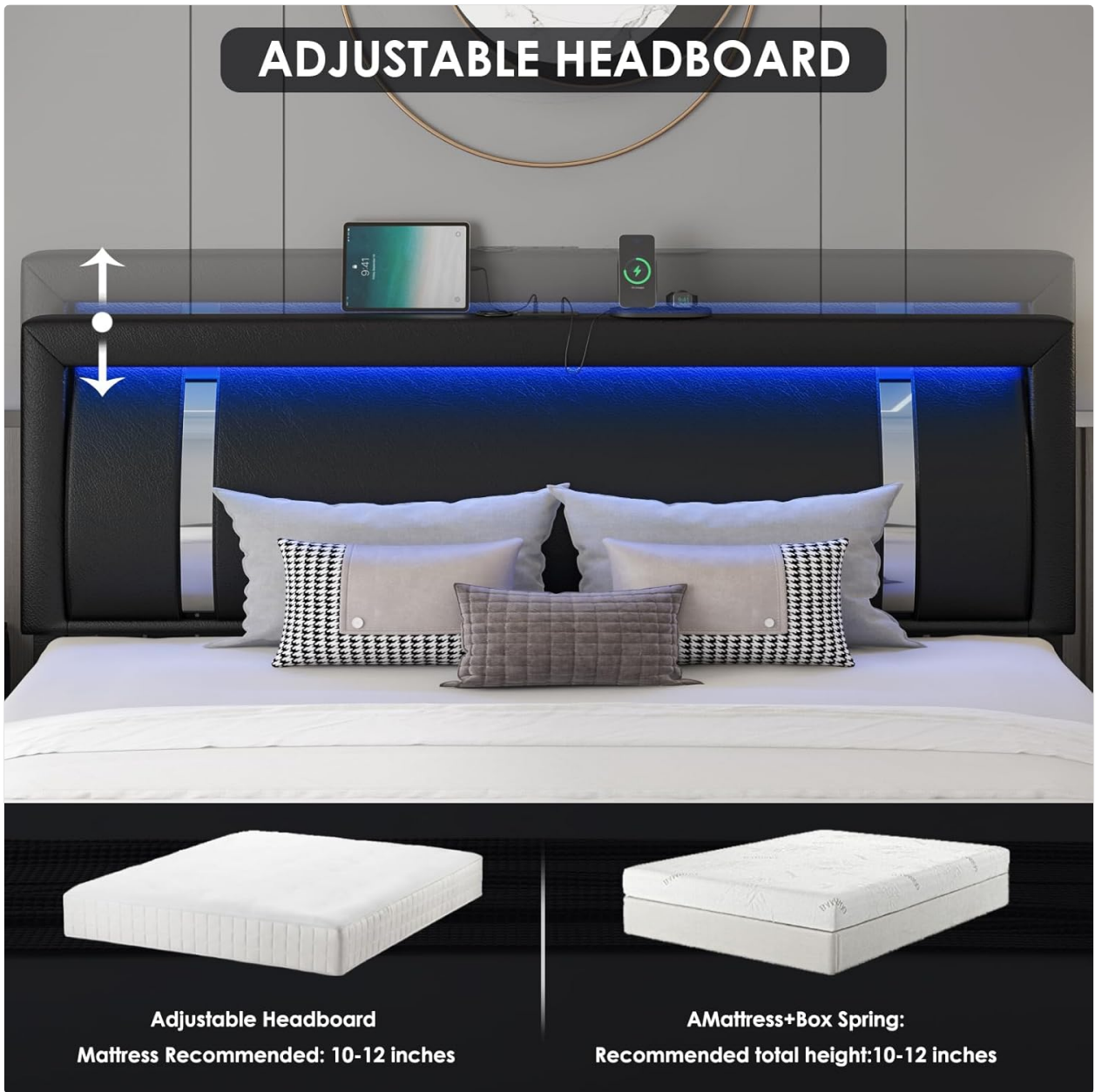
Figure 4.2: Adjustable headboard mechanism.