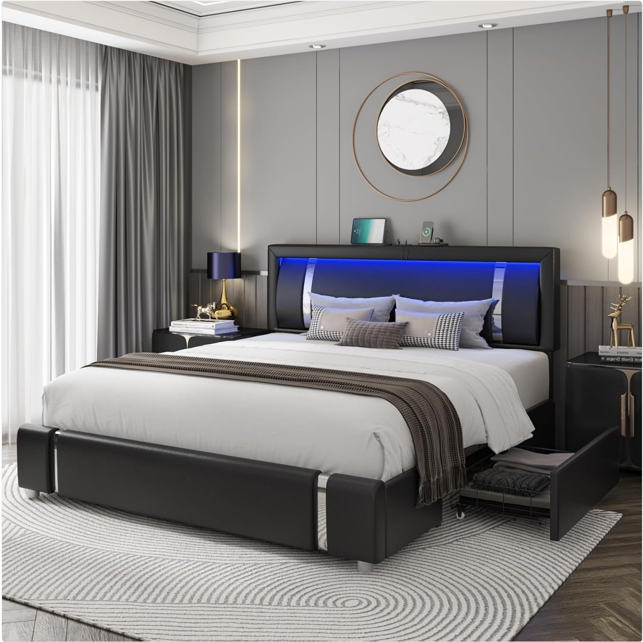
Figure 2.1: Keyluv KLV-UP-232 Full Size Bed Frame with RGB LED lights and storage drawers.