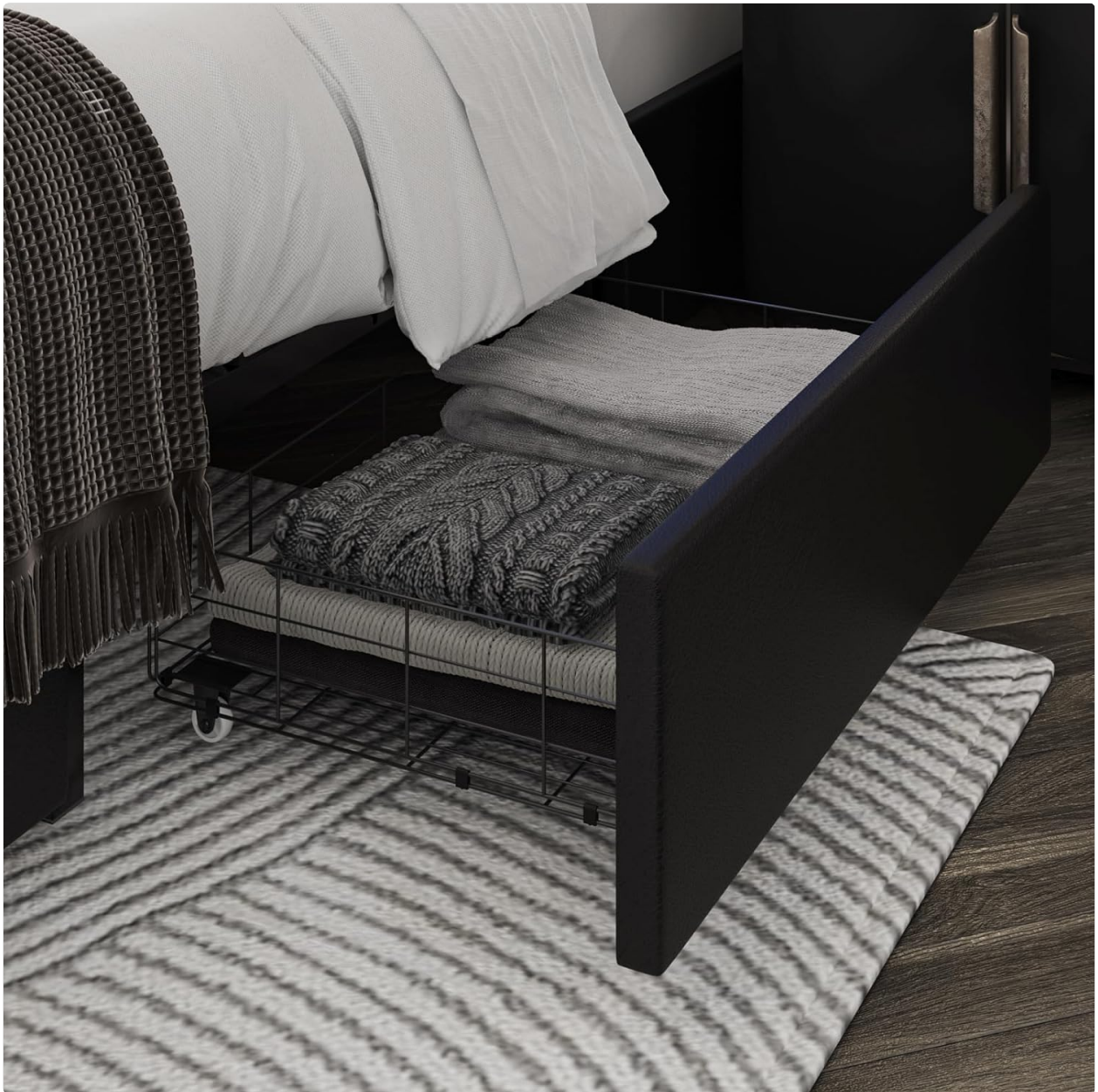
Figure 5.3: Storage drawer in use.