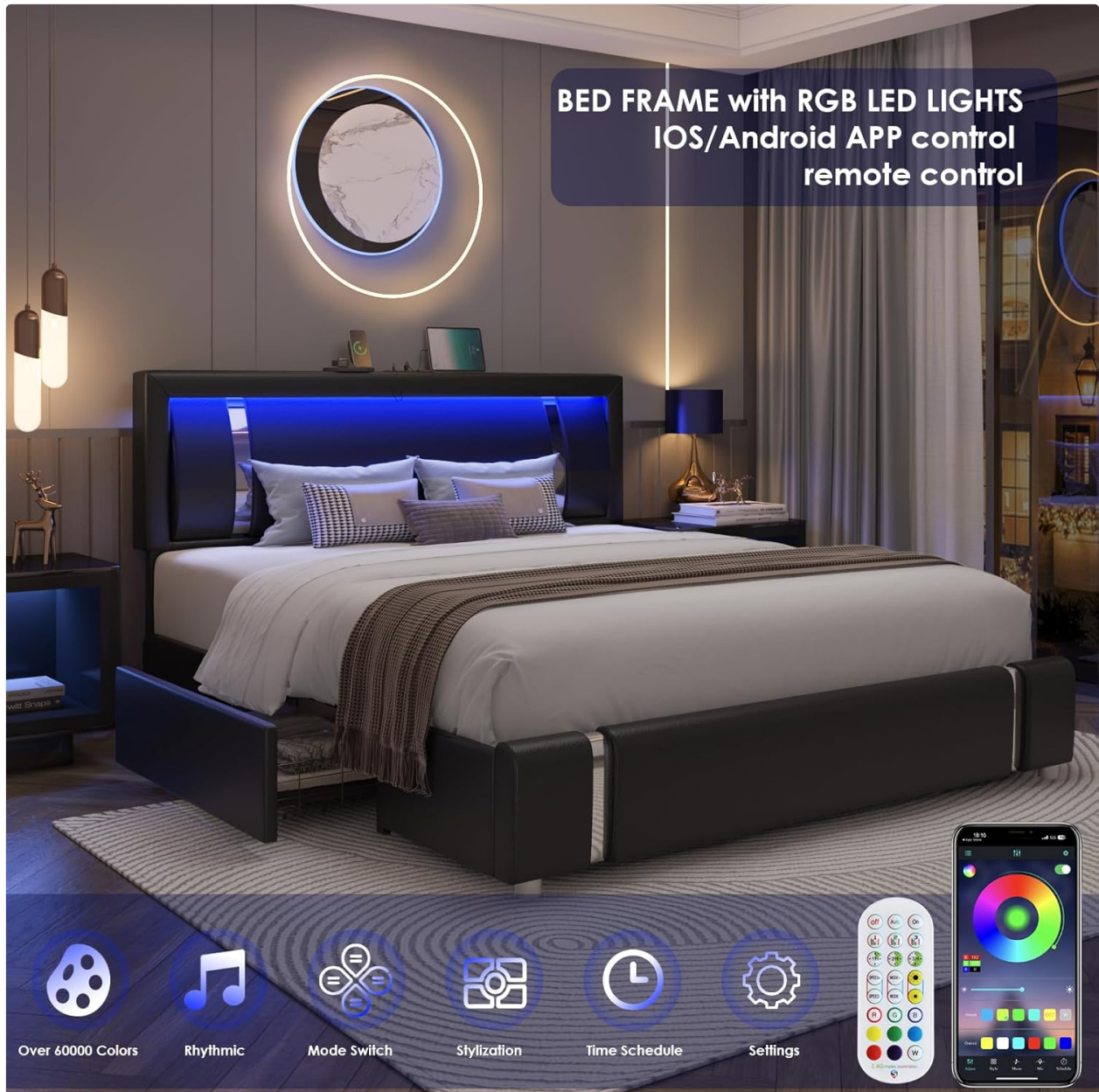
Figure 5.1: Remote control and smartphone app for LED light operation.