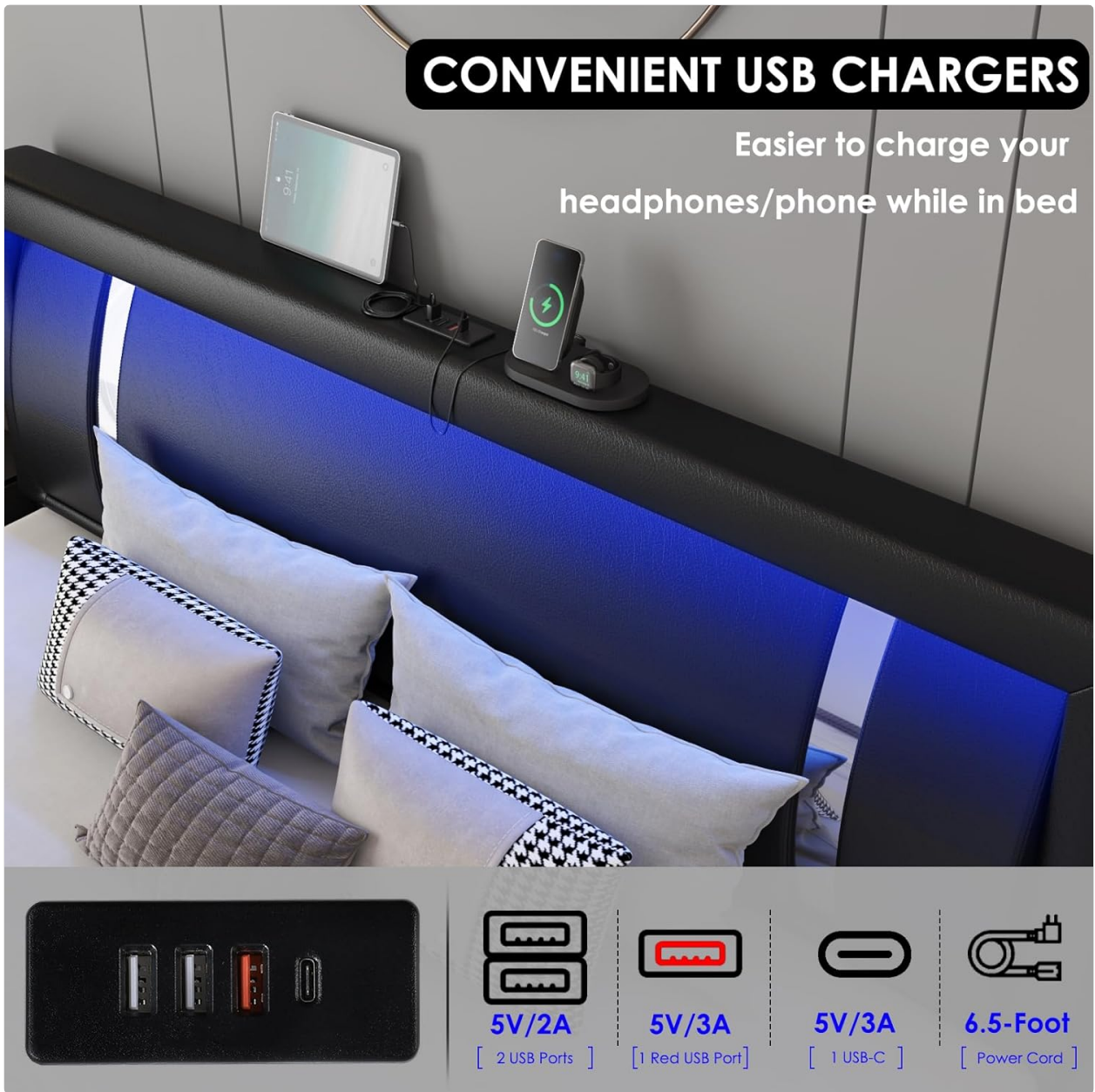
Figure 5.2: Integrated USB and USB-C charging ports on the headboard.