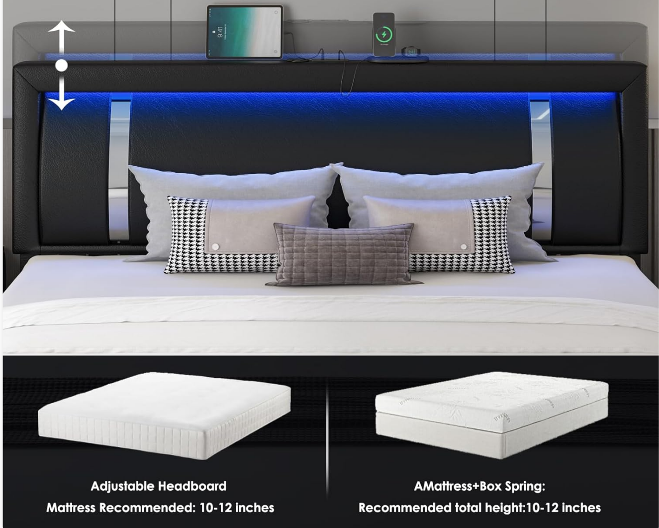
Image 5.4: The adjustable headboard, illustrating the range of height settings to suit various mattress sizes.