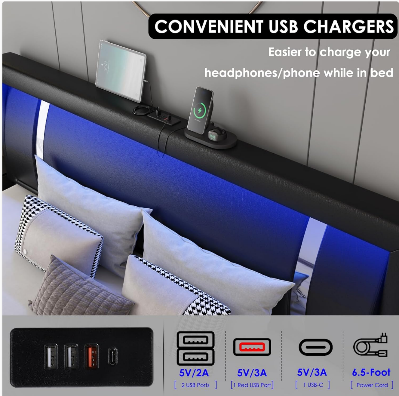
Image 5.2: Detailed view of the USB charging station on the headboard, showing various port types and power output.