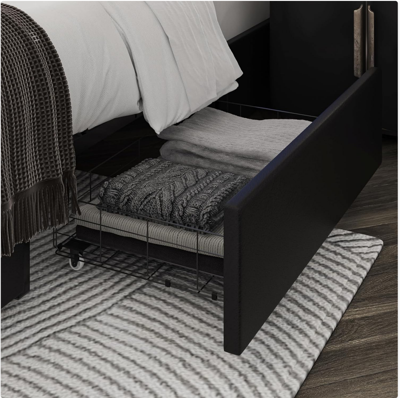
Image 5.3: A storage drawer pulled out from under the bed, demonstrating its capacity for storing items.