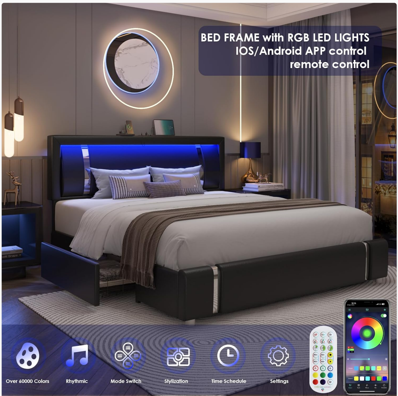
Image 5.1: Illustration of the RGB LED lights in operation, showing control options via remote and mobile app.