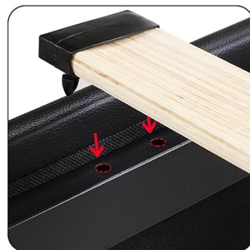
EASY ASSEMBLY SLATS