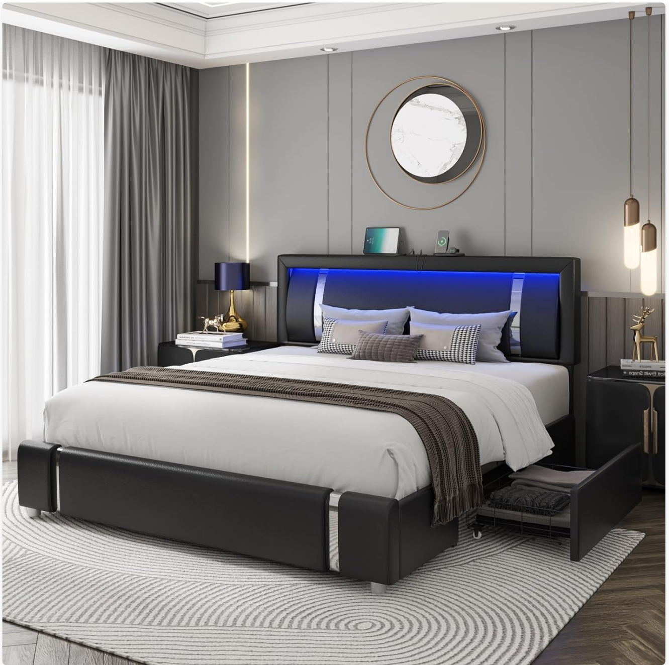
Image 1.1: Fully assembled Keyluv King Size Bed Frame in a modern bedroom setting.