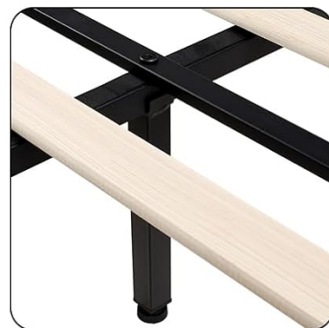
WOOD SLATS SUPPORT