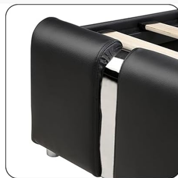
SAFE ROUND DESIGN