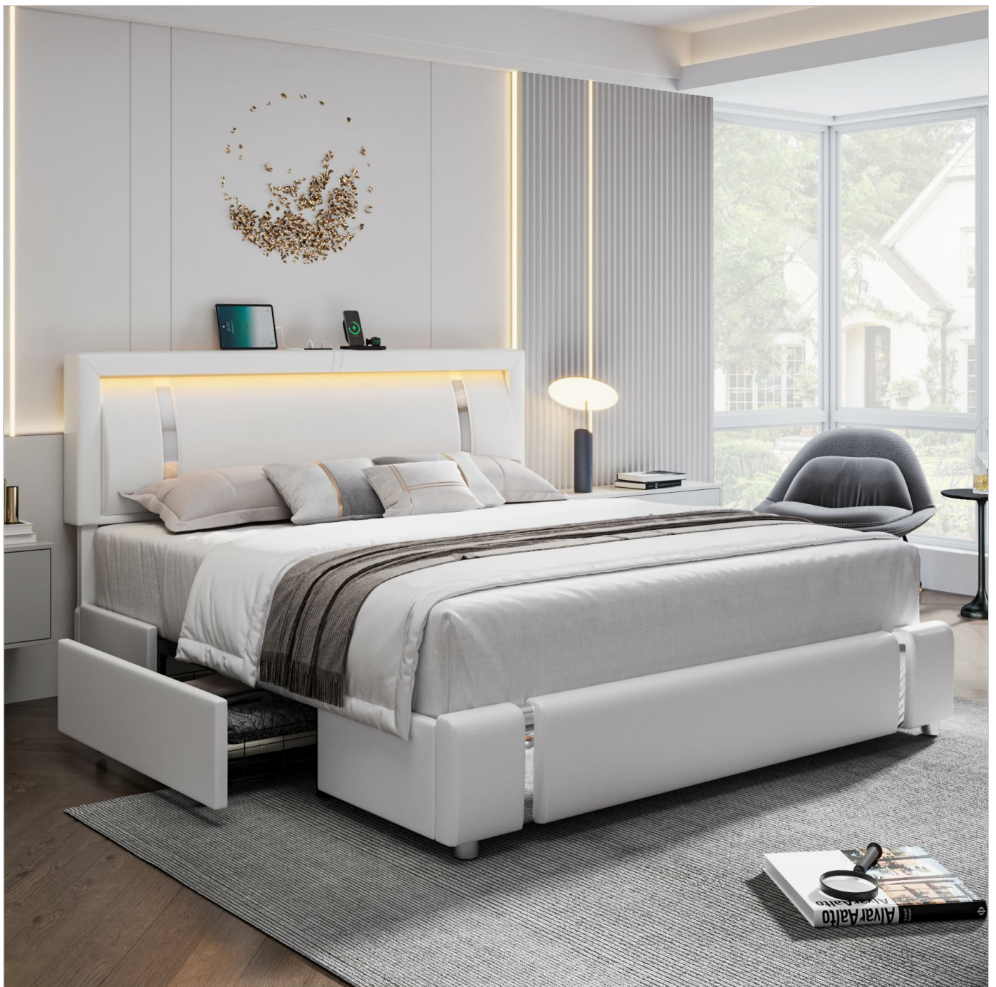
Figure 7.1: The Keyluv KLV-UP-229 Full Size Bed Frame in white, showcasing its modern design and features.