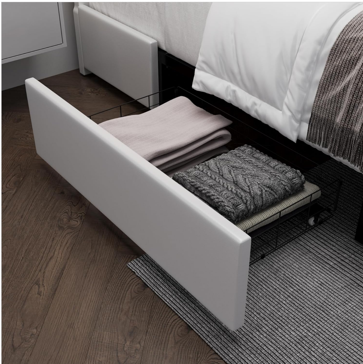
Figure 3.2: An open storage drawer, demonstrating its capacity for bedding and clothing.