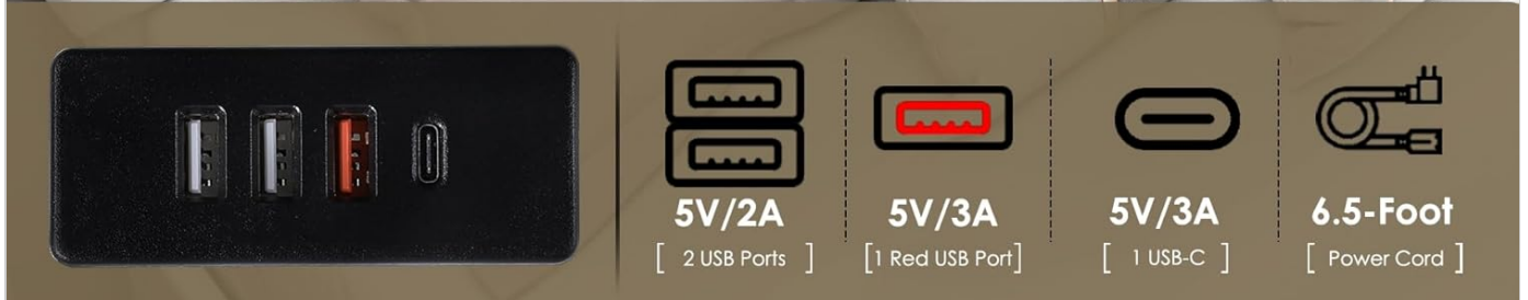
Figure 4.2: Close-up of the integrated USB and USB-C charging ports on the headboard, with devices connected.