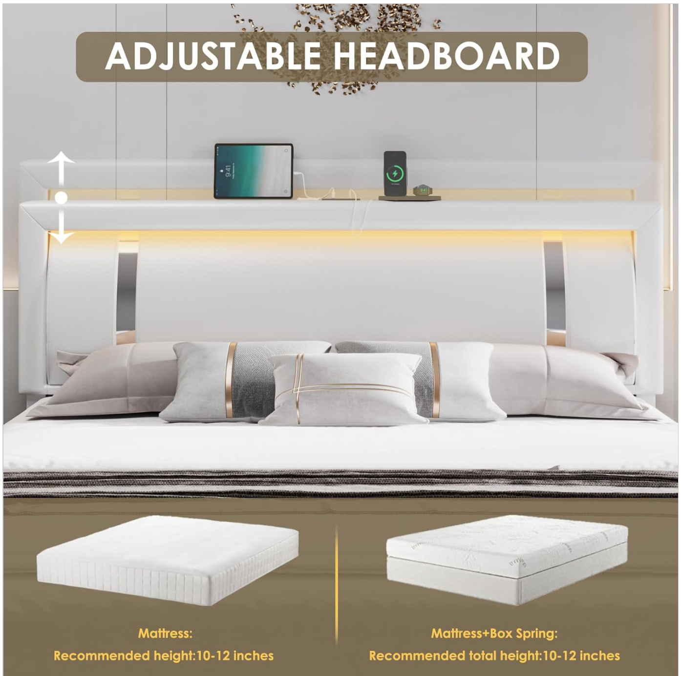
Figure 4.3: Illustration demonstrating the adjustable height feature of the headboard to suit different mattress thicknesses.