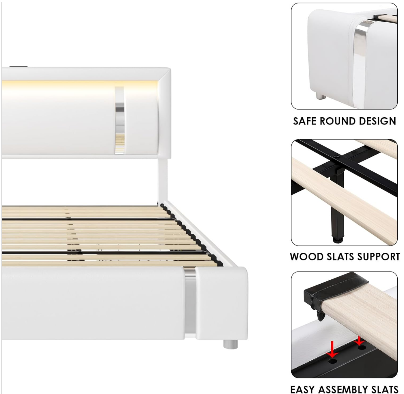
Figure 3.1: Close-up of the bed frame's safe round design, wood slat support, and easy assembly slats.

The bed frame features a steel frame structure and 12 padded hardwood slats for stability. The slats are designed for easy installation and support the mattress without the need for a box spring.