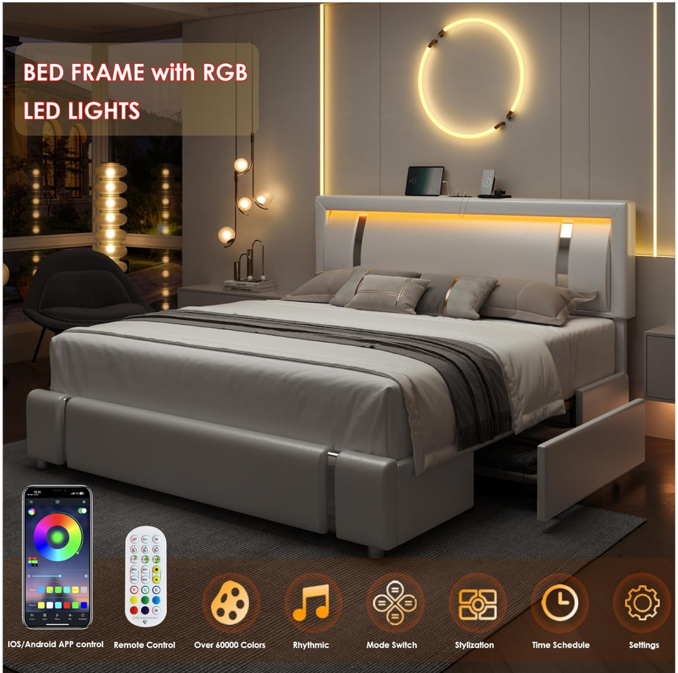
Figure 4.1: The bed frame with RGB LED lights illuminated, showing the remote control and mobile app interface for light customization.