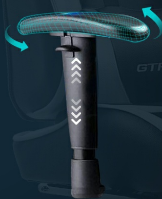
Figure 3: Illustration of the 3D adjustable armrests, highlighting their multi-directional movement for personalized comfort.

Features innovative linked armrests that automatically adjust to any backrest angle, ensuring constant arm support. The armrest surface is padded with a 4cm thickness, providing optimal comfort during extended gaming sessions and alleviating pressure points on your arms.