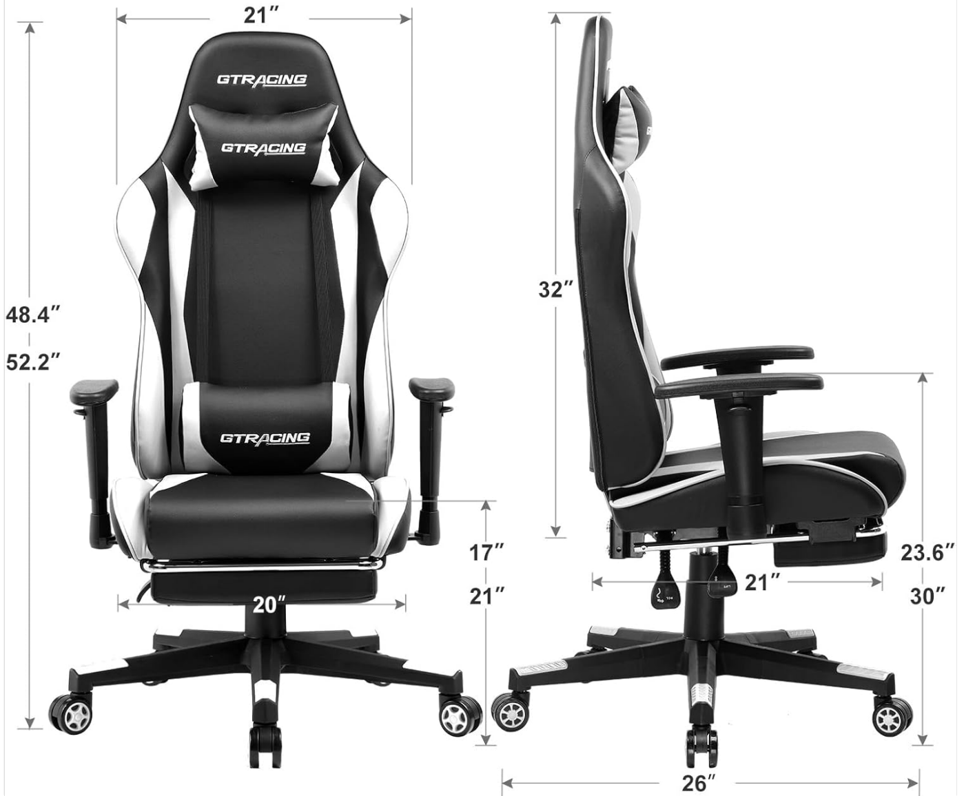
Figure 5: Detailed product dimensions, including seat height range (17-21 inches) and overall chair measurements.