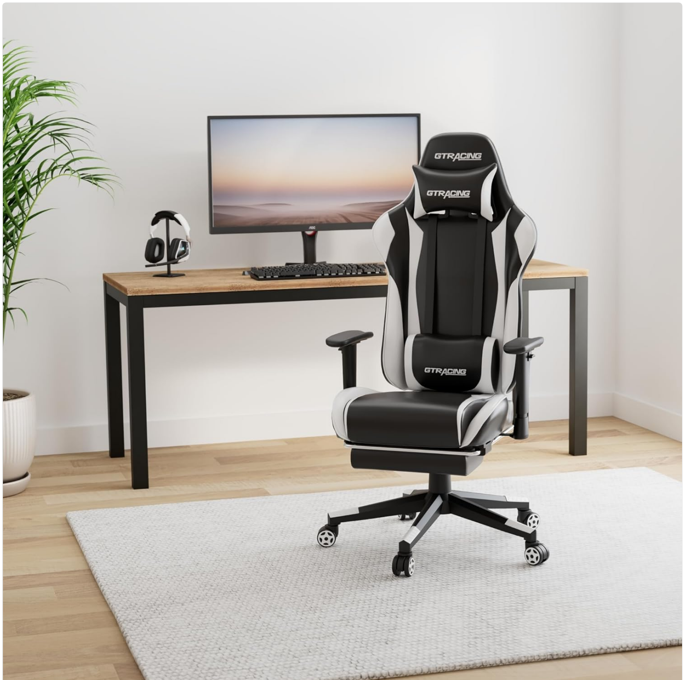
Figure 2: The gaming chair positioned in a modern home office environment, demonstrating its suitability for various settings.