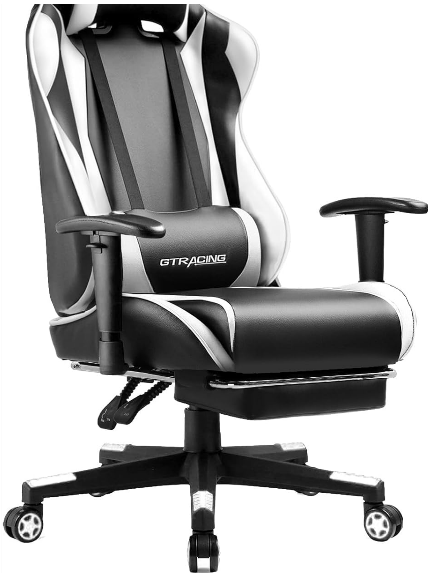
Figure 1: Front view of the GTRACING Gaming Chair in white, showcasing its ergonomic design and integrated footrest.