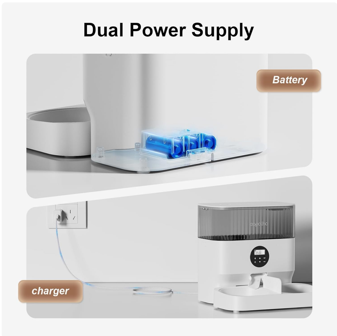
Image: The feeder illustrating its dual power supply capability, showing both battery compartment and power adapter connection.