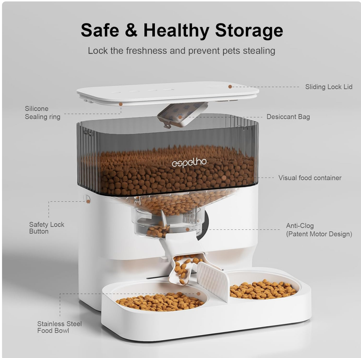
Image: An exploded view diagram of the feeder showing its components: Sliding Lock Lid, Silicone Sealing Ring, Desiccant Bag, Visual Food Container, Safety Lock Button, Anti-Clog Patent Motor Design, and Stainless Steel Food Bowl.

The Espelho Automatic Cat Feeder consists of several key components designed for optimal functionality and ease of use.