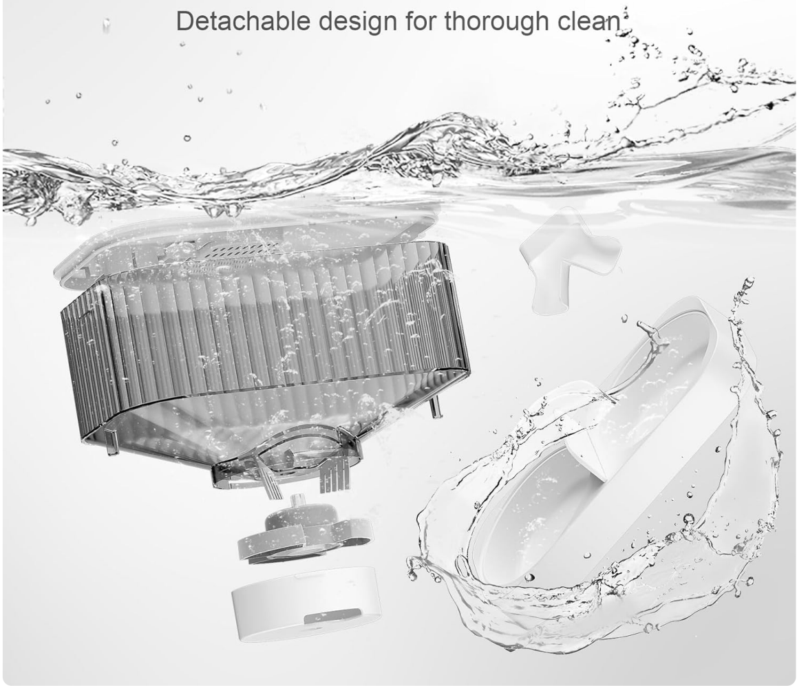
Image: The detachable components of the feeder, including the food reservoir and base, being cleaned with water, highlighting the easy-to-clean design.