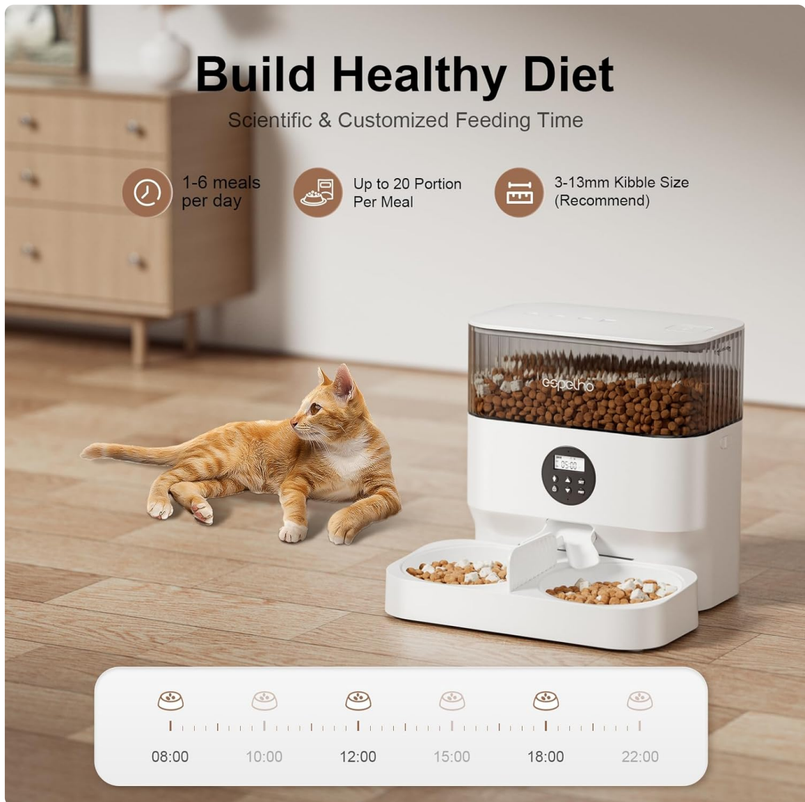
Image: A visual guide to setting up a healthy diet with the feeder, showing 1-6 meals per day, up to 20 portions per meal, and recommended kibble size.