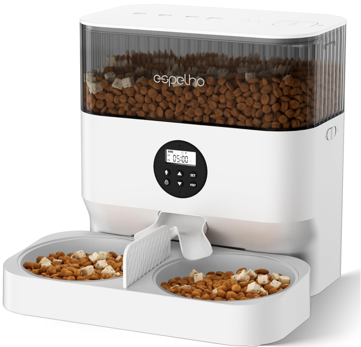
Image: The Espelho Automatic Cat Feeder, a white unit with a transparent food reservoir filled with kibble, dispensing into two stainless steel bowls.