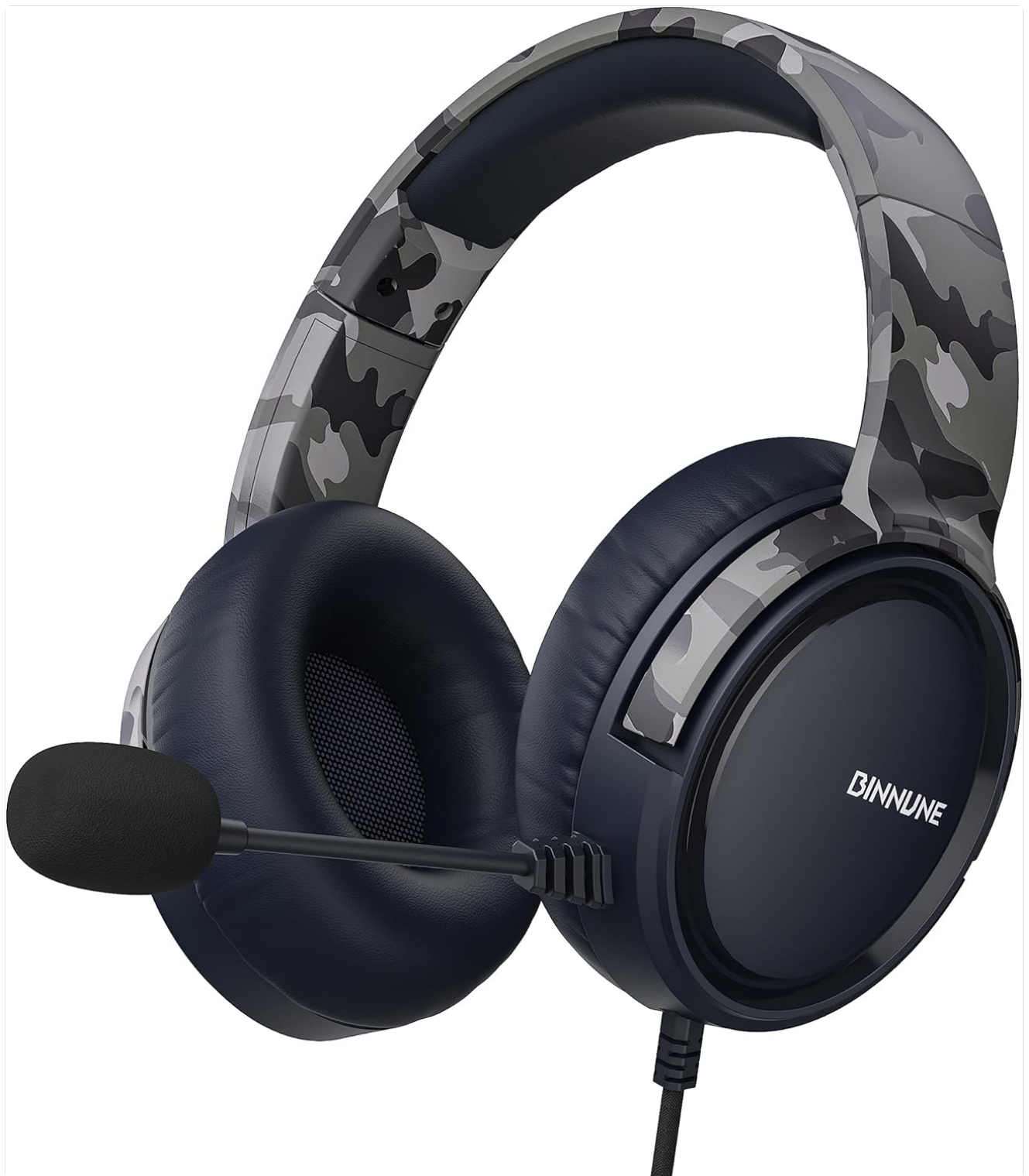
Figure 2.1: Front view of the BINNUNE BG02 Gaming Headset with its attached microphone.