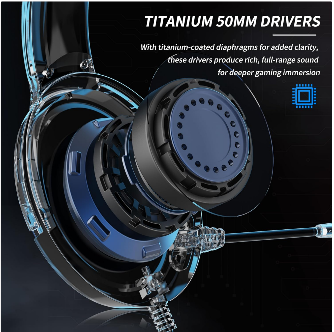
Figure 2.3: Detailed view of the 50mm titanium-coated drivers, engineered for enhanced audio clarity and immersive sound.