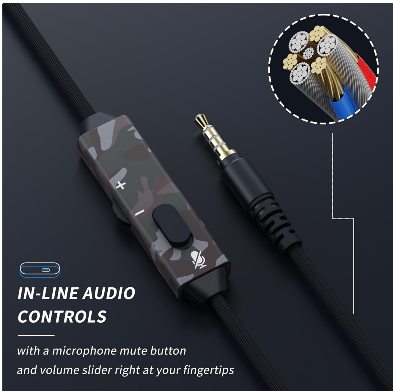
Figure 4.1: Detailed view of the in-line audio controls, featuring a volume slider and a microphone mute button for easy access.