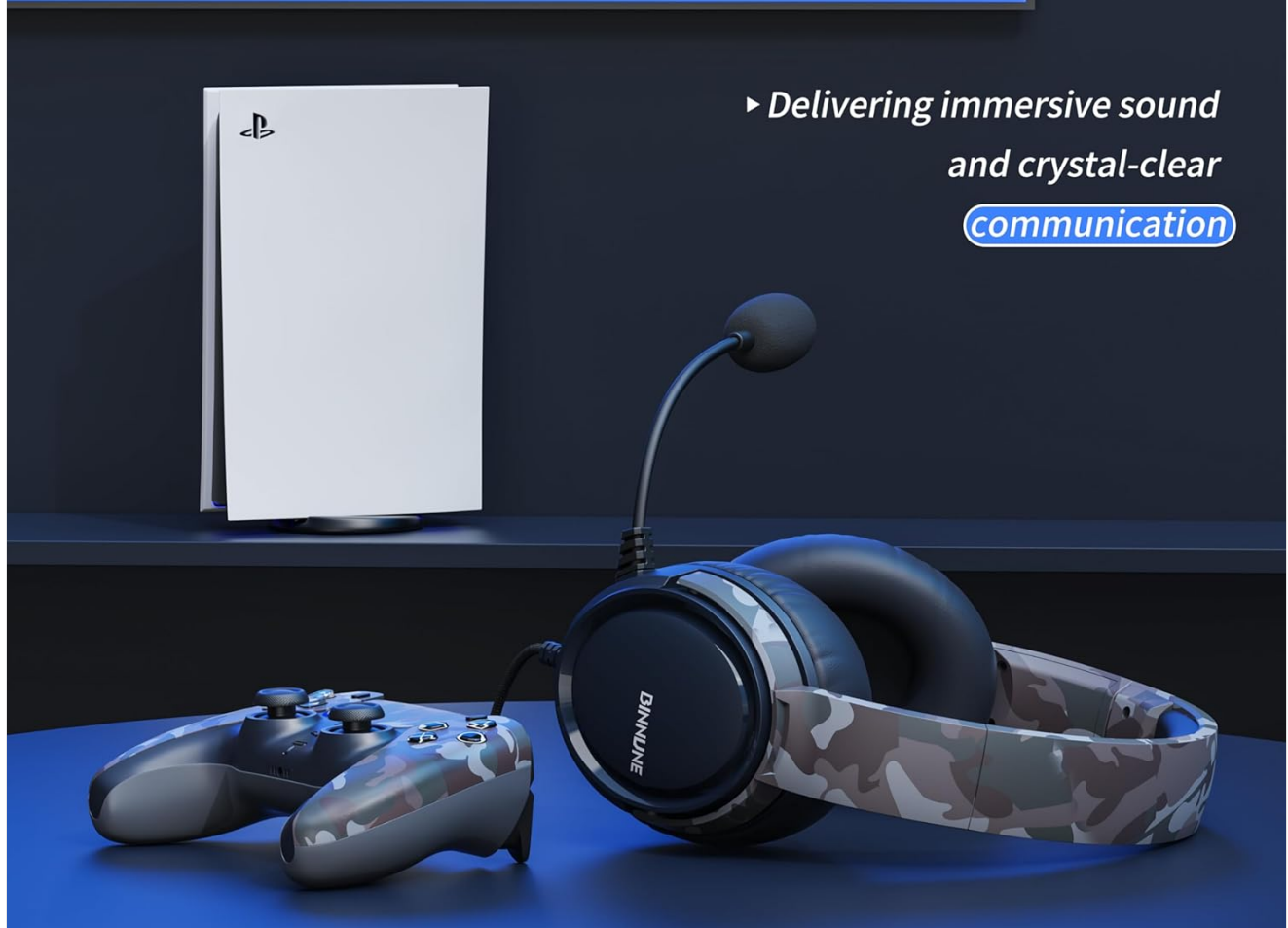
Figure 3.1: The BINNUNE BG02 Headset positioned with a PlayStation 5 console and controller, illustrating its intended use for gaming.