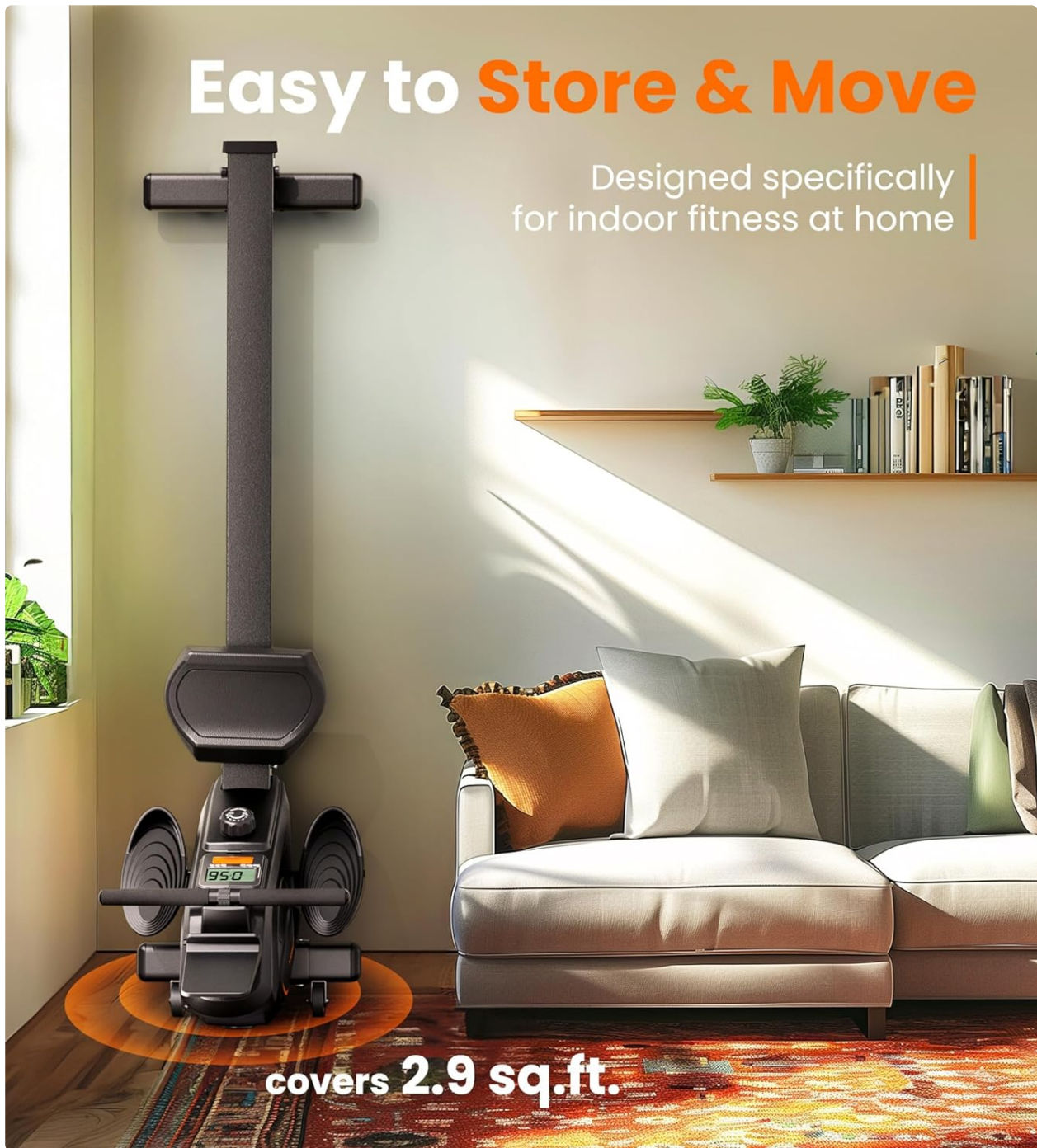
Image: The YOSUDA Magnetic Rowing Machine stored upright, demonstrating its compact footprint.

The YOSUDA Magnetic Rowing Machine is designed for convenient storage and easy movement within your home.