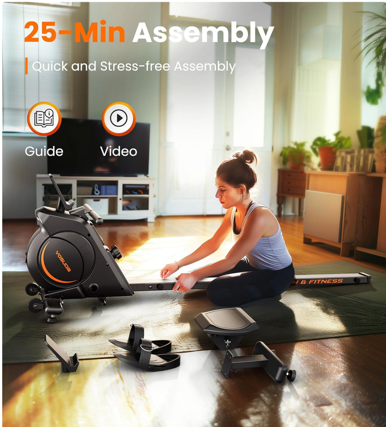
Image: A woman assembling the YOSUDA Magnetic Rowing Machine on a mat.

Assembly of your YOSUDA Magnetic Rowing Machine is designed to be quick and straightforward, typically taking around 25 minutes with only 6 main parts.