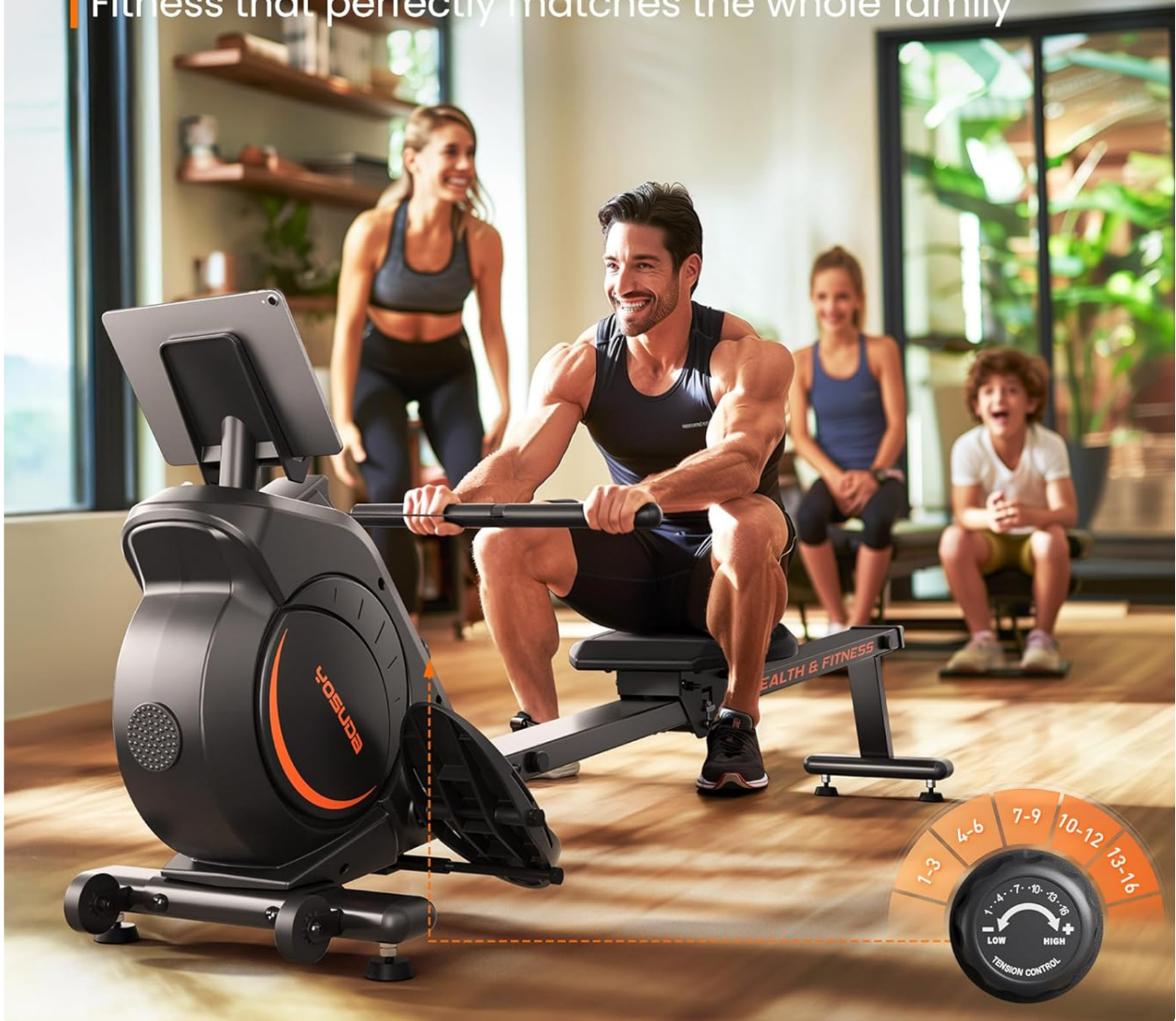
Image: A family demonstrating the use of the YOSUDA Magnetic Rowing Machine, highlighting its 16 resistance levels suitable for all.

Fitness that perfectly matches the whole family