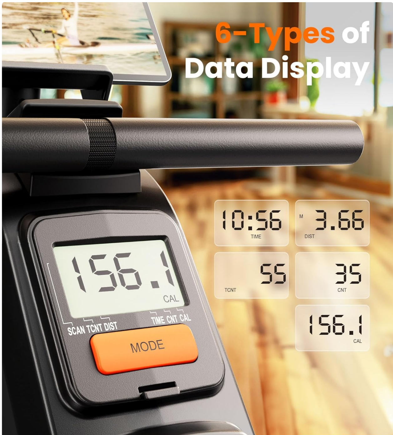
Image: A close-up of the LCD monitor showing different workout data points like time, distance, calories, and count.