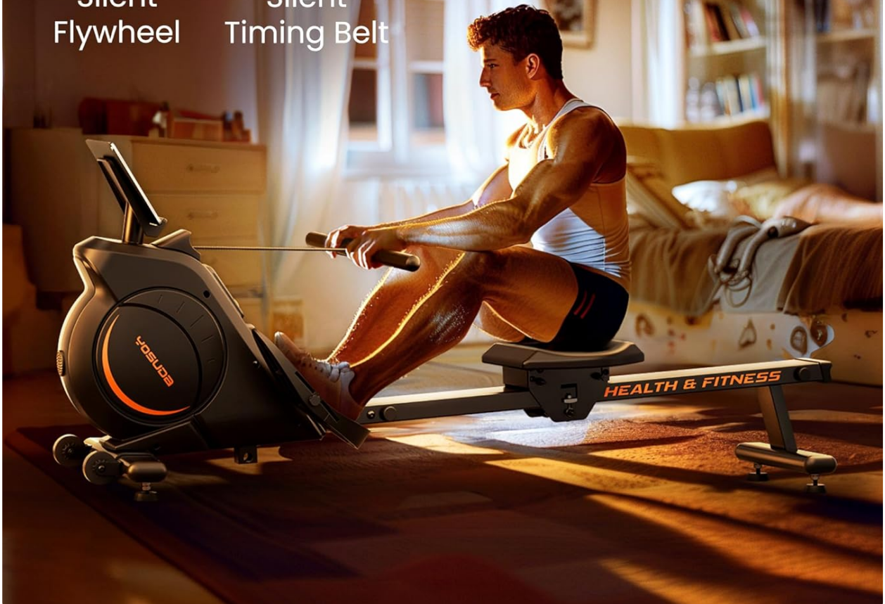
Image: A man using the YOSUDA Magnetic Rowing Machine in a quiet room, emphasizing its dual silent system.