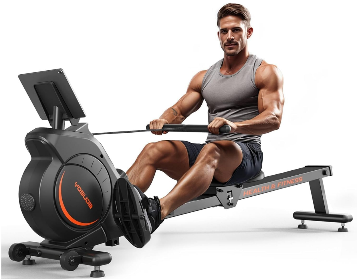
Image: A man demonstrating the YOSUDA Magnetic Rowing Machine in a home setting.

The YOSUDA Magnetic Rowing Machine is designed to provide an effective and quiet full-body workout in the comfort of your home. Featuring a robust magnetic resistance system and a user-friendly design, it accommodates various fitness levels and body types.