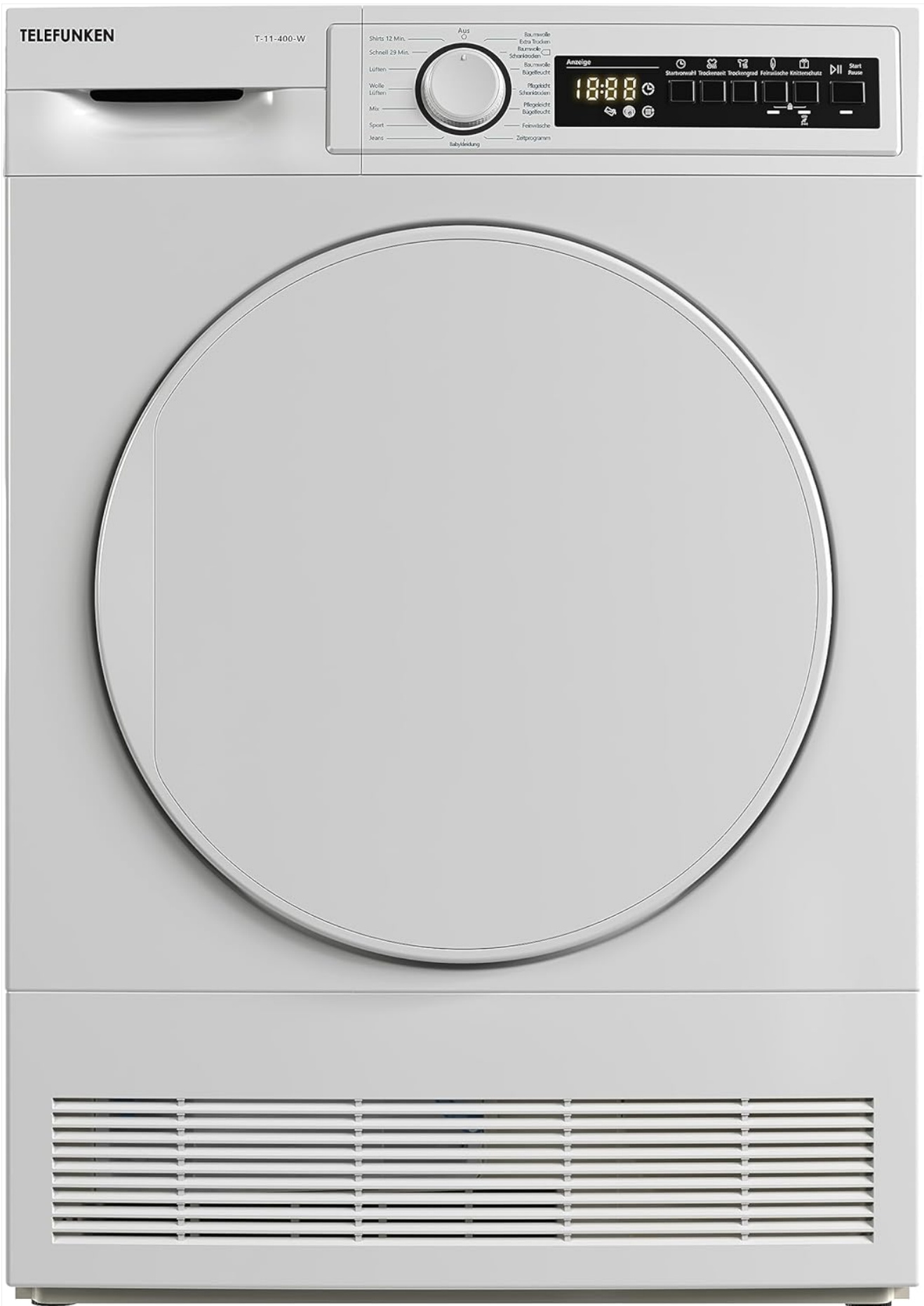
Image: A full front view of the Telefunken T-11-400-W Condenser Dryer, showcasing its white finish and the central loading door.