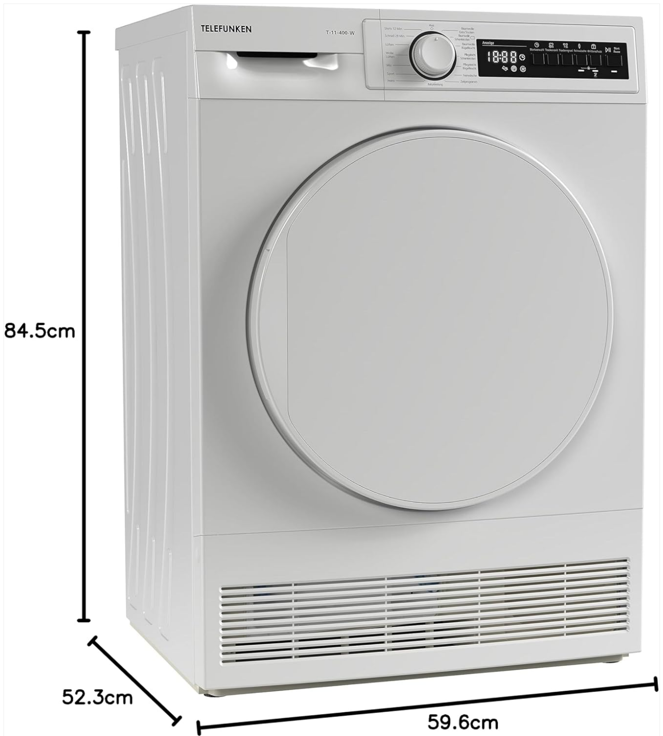
Image: Front view of the Telefunken T-11-400-W Condenser Dryer with its dimensions clearly marked. The dryer measures 84.5 cm in height, 59.6 cm in width, and 52.3 cm in depth.