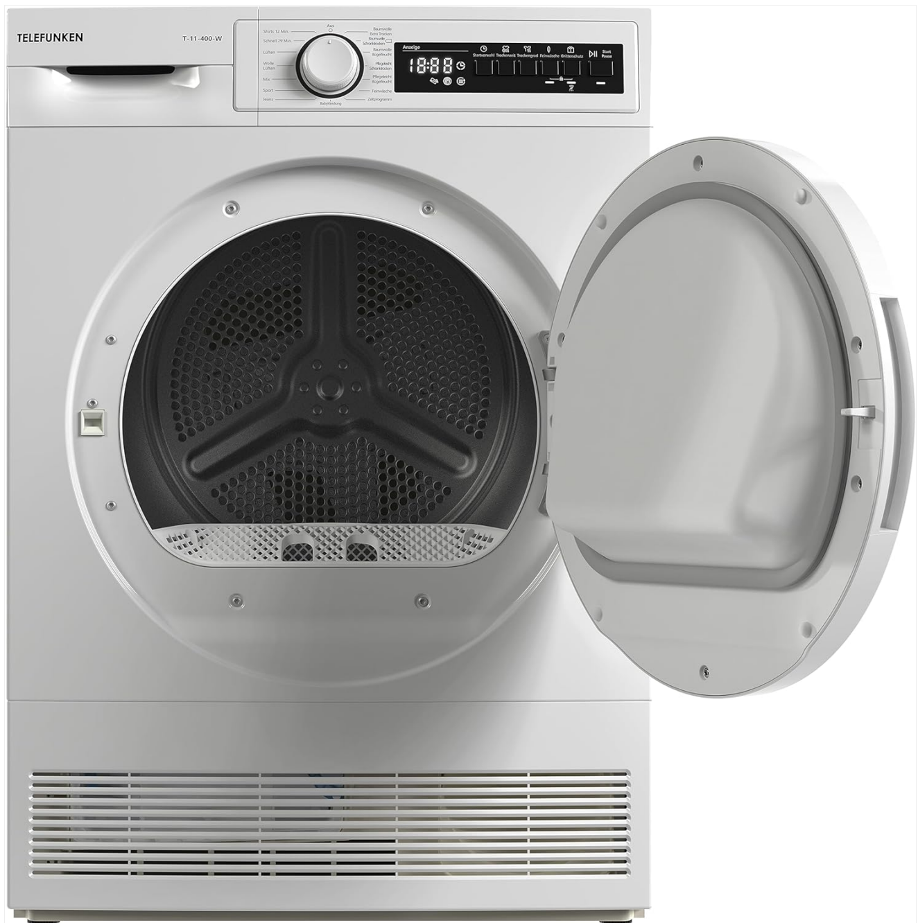
Image: The Telefunken T-11-400-W Condenser Dryer with its door open, revealing the interior drum and the location of the lint filter at the bottom of the door opening.