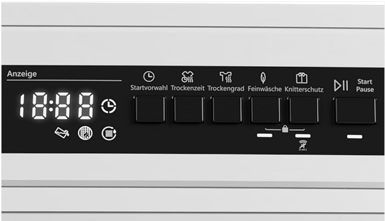
Image: A detailed view of the dryer's control panel, showing the LED display and various function buttons for delay start, drying time, drying level, delicates, anti-crease, and start/pause.

The control panel features an LED display for cycle information and various buttons for selecting options and starting/pausing the dryer.