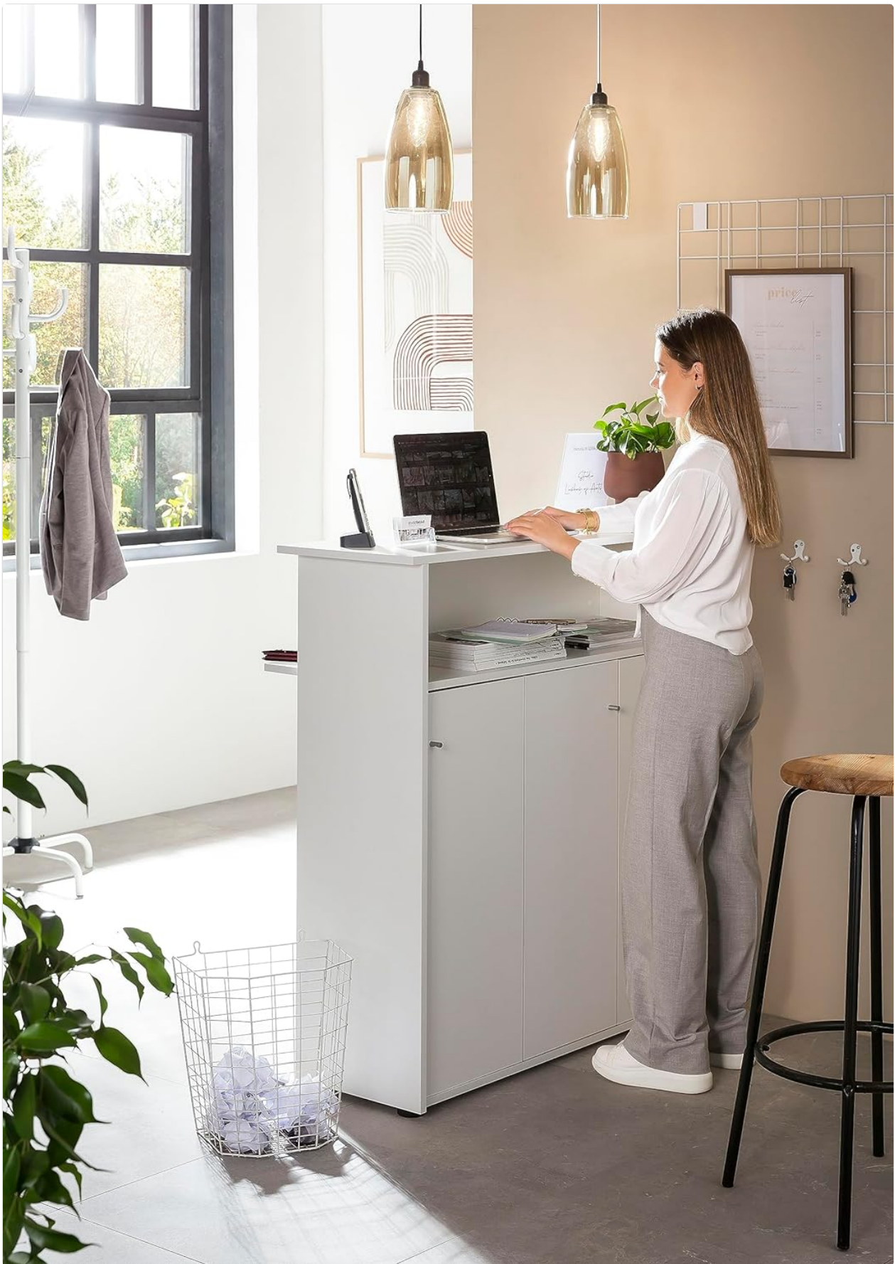
Image 1.1: The Schildmeyer Reno 400 Reception Counter in use, showcasing its functional design and integrated workspace.