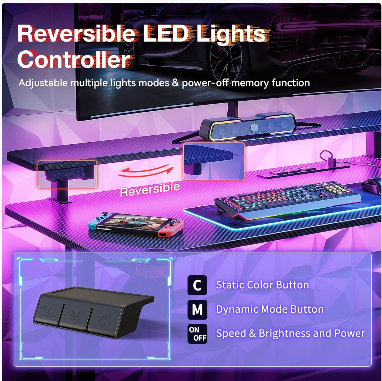
Figure 4: Reversible LED Lights Controller.