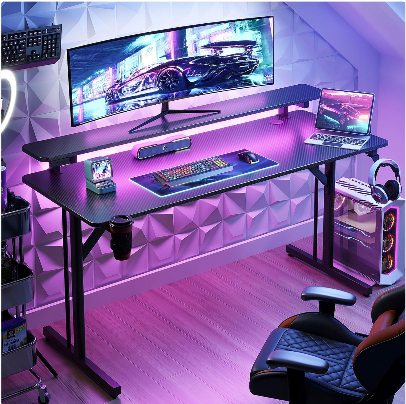
Figure 1: Fully assembled MOTPK 47-inch Gaming Desk setup.