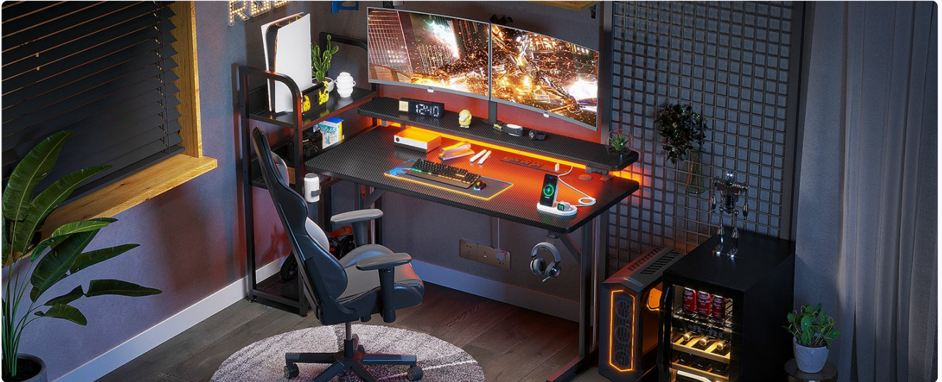
Figure 7: Detachable cup holder.