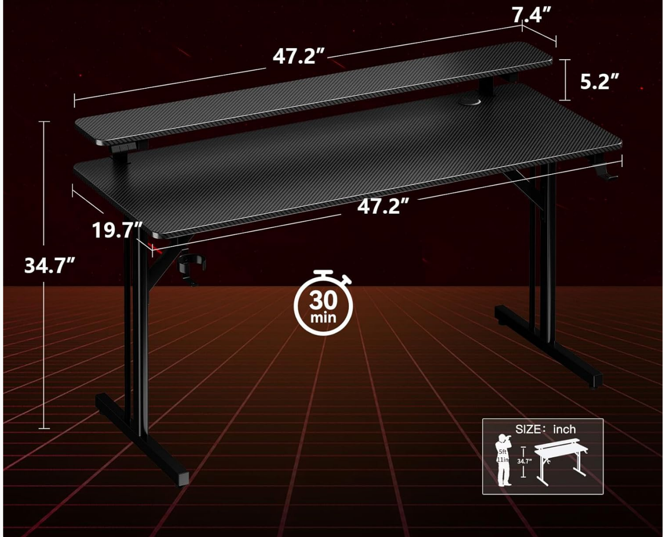
Figure 2: Desk dimensions for planning your setup.