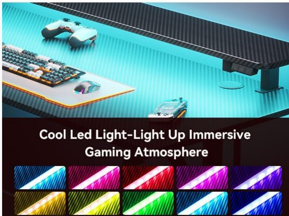
Figure 5: Examples of LED light colors.