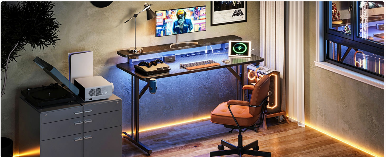
Figure 8: Detachable headphone hook.