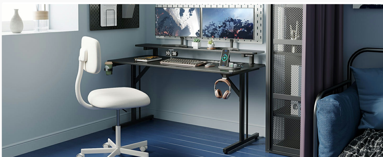
Figure 6: Integrated power outlets and USB ports.